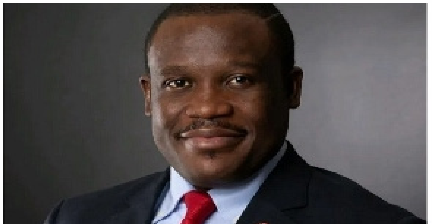
Samuel Nartey George, Minister of Communications

"I told them, it's a new dawn. It's a reset. I personally engaged with every single CEO and the chamber to ensure they understand my goals and secure their buy-in before making any announcements," he added.