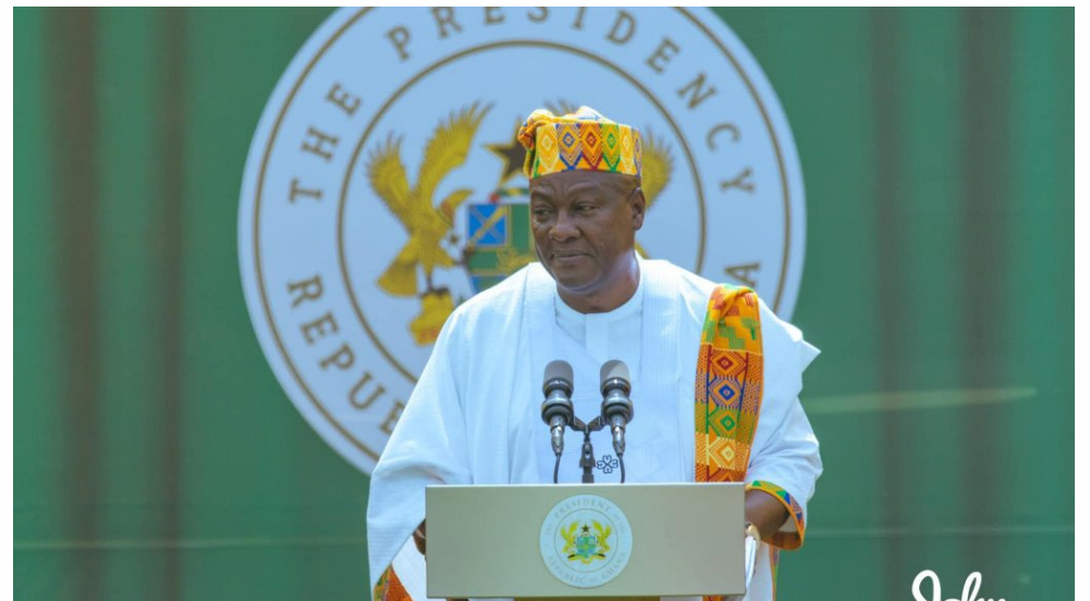
John Dramani Mahama, President of Ghana

In January, the committee revealed that it had received 700 petitions from the public, detailing alleged cases of corruption and mismanagement. With the report now set for submission, attention will turn to the government's next steps in implementing its recommendations.