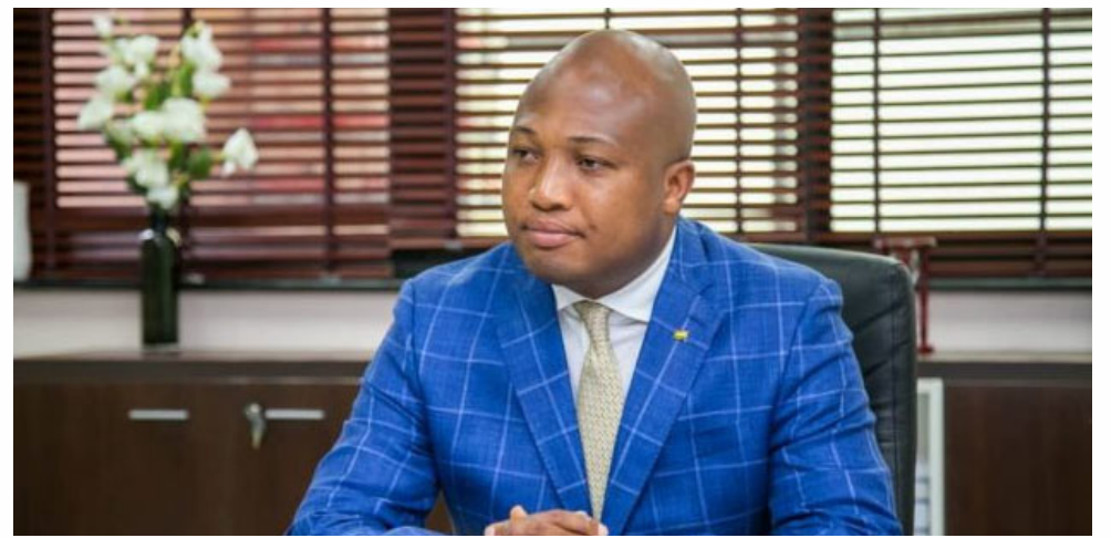
Samuel Okudzeto Ablakwa, Minister for Foreign Affairs

The government's proposed reforms aim to transform the passport issuance system, eliminate bureaucratic bottlenecks, and ensure that all applicants receive their documents promptly.