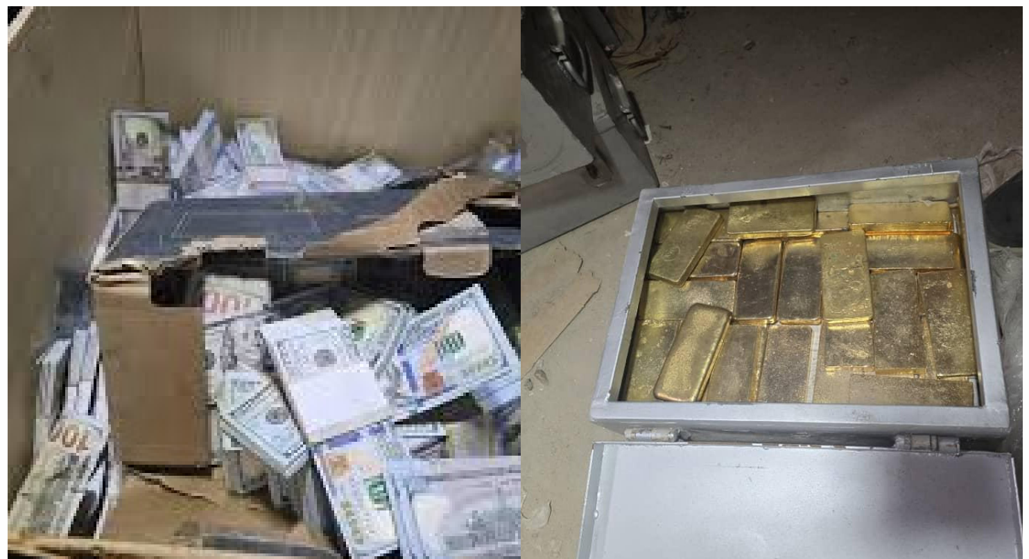
Fake Dollars and Gold

the public that investigations are continuing, with efforts underway to apprehend all individuals involved in this illegal operation.