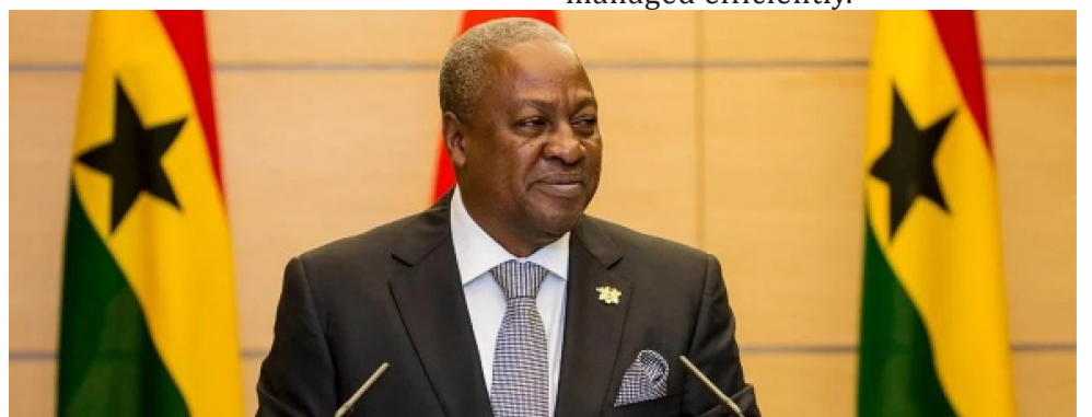
John Dramani Mahama, President of Ghana

With these measures, Mahama aims to instill a culture of responsibility among government officials while ensuring that public funds are managed efficiently.