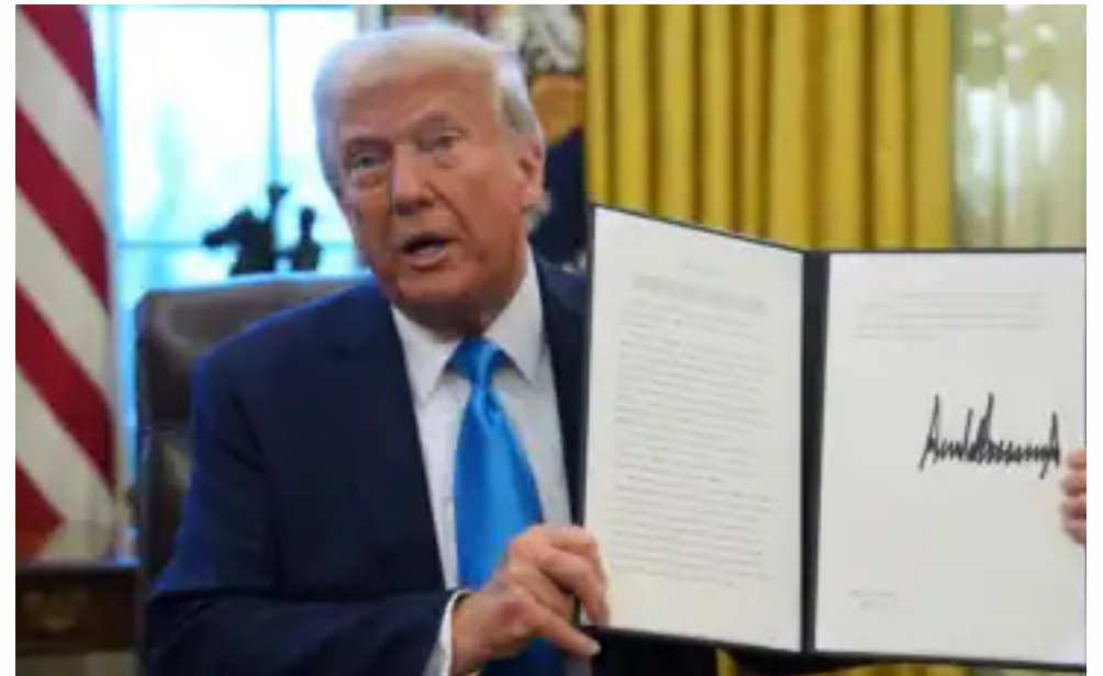
Donald Trump, US President

years since the end of the apartheid system of white minority rule in 1994.