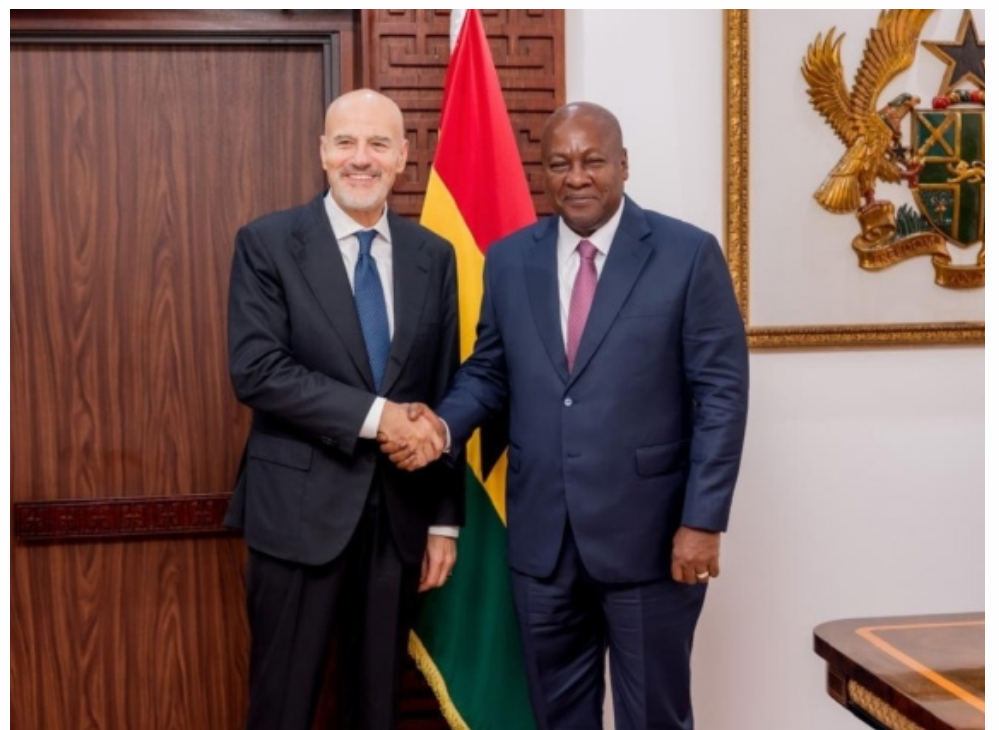
Claudio Descalzi, CEO of Eni, on the left, John Mahama, President of Ghana on the right

expand energy access, all of which reflect the company's commitment to sustainable development and the well-being of the region.