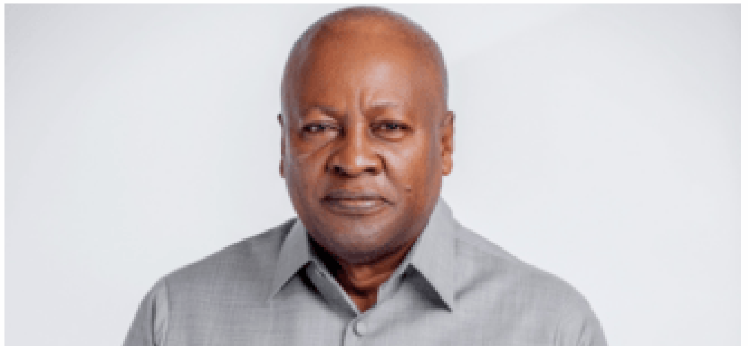
John Dramani Mahama, President of Ghana

Both appointments reflect Mahama's continued efforts to strengthen Ghana's key economic institutions, positioning the country for improved investment opportunities and trade growth.