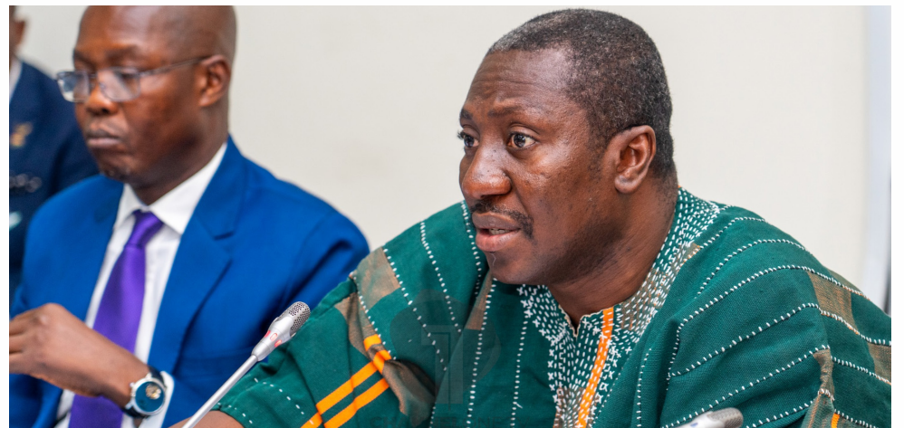
Alexander Afenyo-Markins, Minority Leader

With tensions still high, the committee’s findings are expected to provide clarity on the events that transpired during the vetting process.