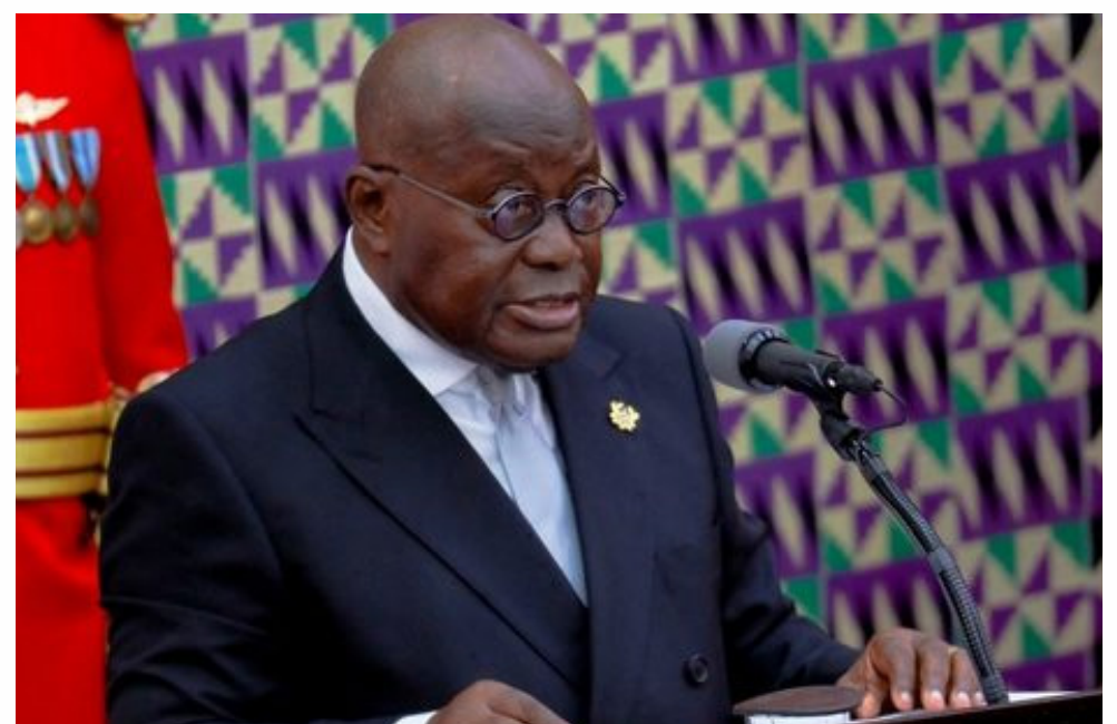
Nana Akufo-Addo, Outgoing President of Ghana

The government’s Domestic Debt Exchange Programme (DDEP) was introduced to address the rising debt by restructuring existing liabilities.