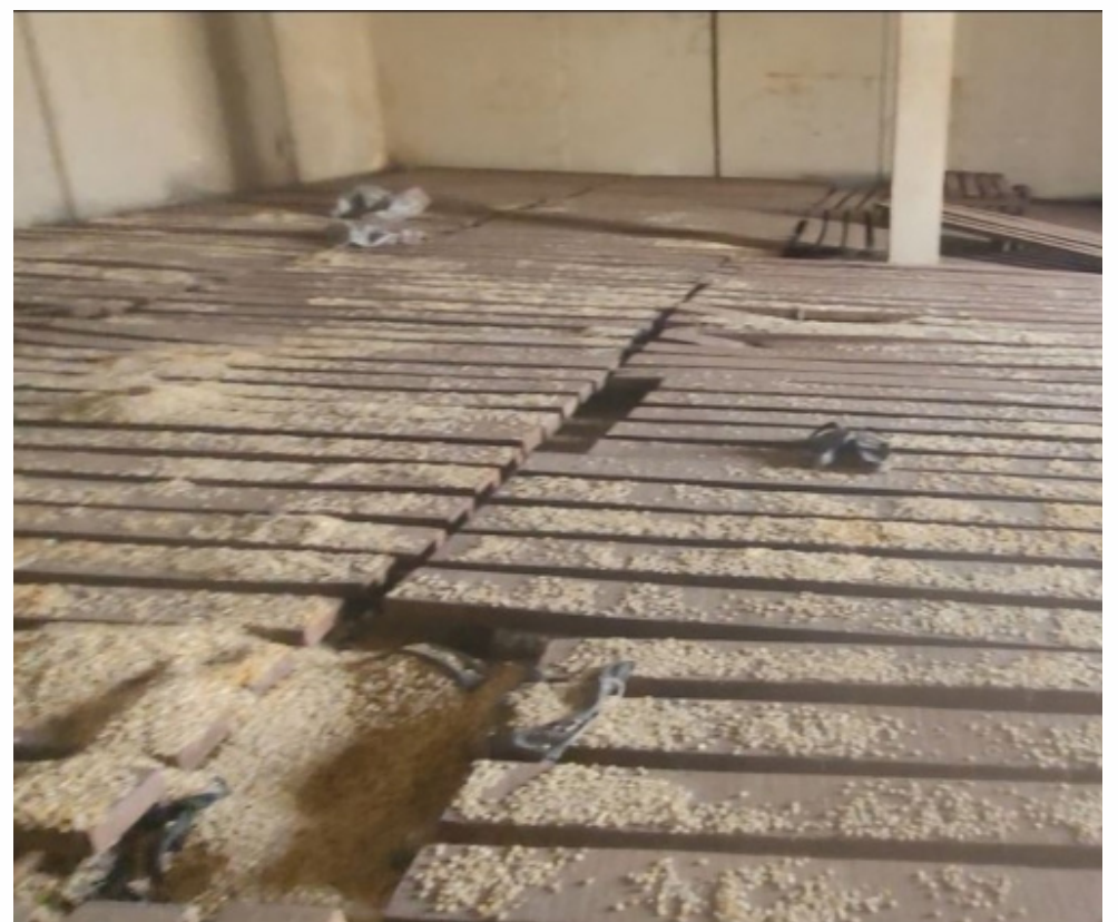
Buffer Stock Company warehouse

with food supplies, agricultural chemicals, and fertilizers reported stolen, raising concerns about food security and supply stability in the region.