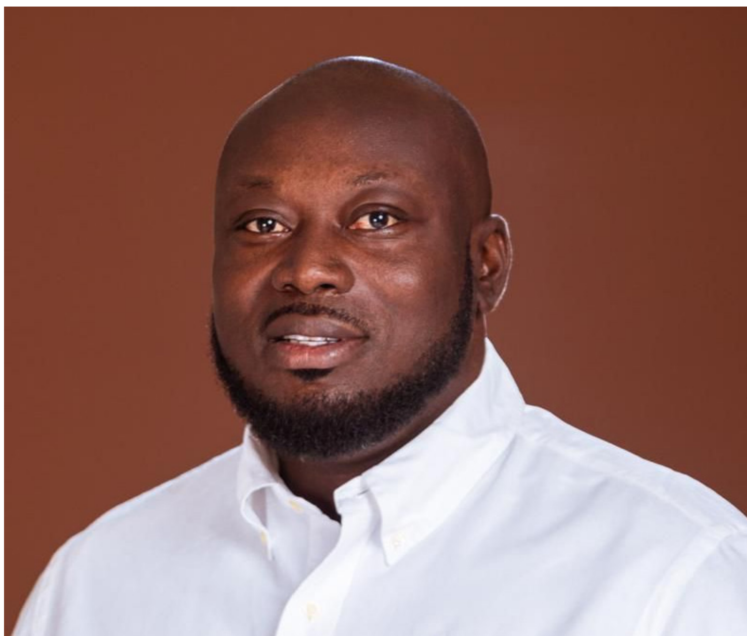
George Opare Addo, Minister-designate for Youth Development and Empowerment

"The joblessness, the homelessness, and the hopelessness of the youth cannot be taken lightly. We must act together and now to prevent a journey to calamity or a journey of no return," Bagbin cautioned.