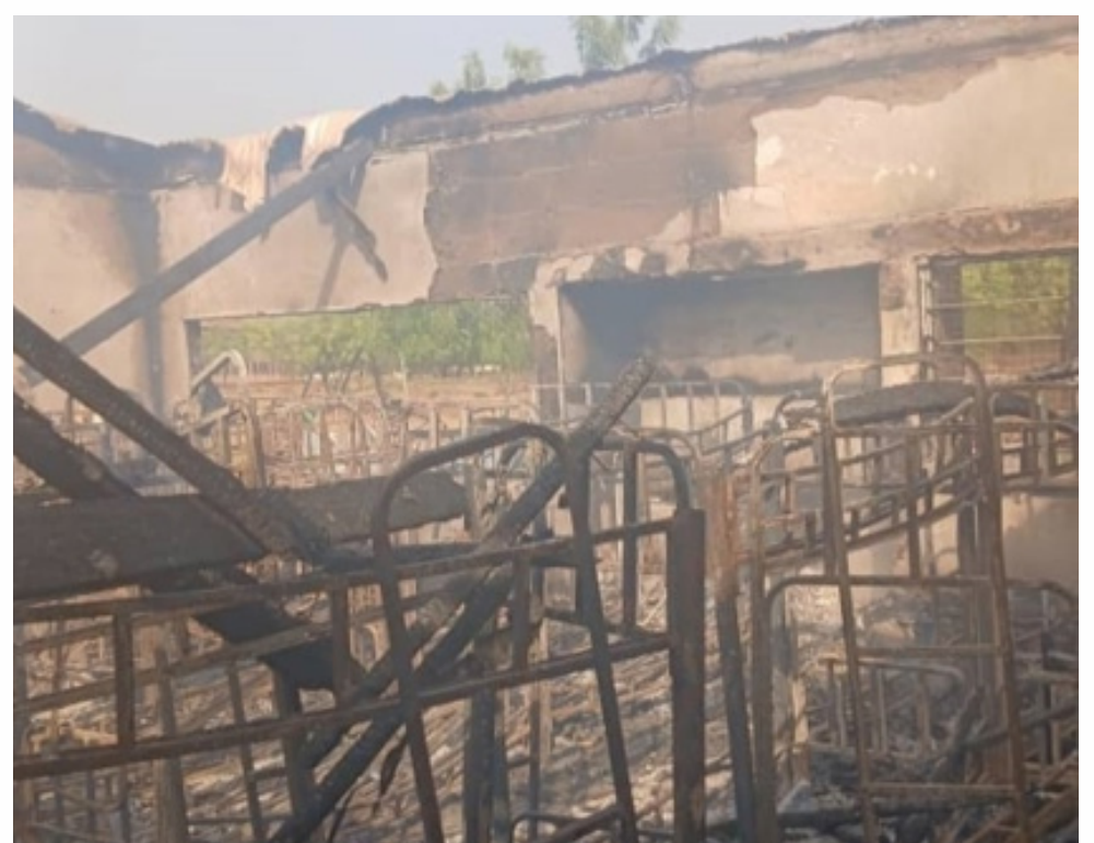
Saboba SHS building after Fire outbreak