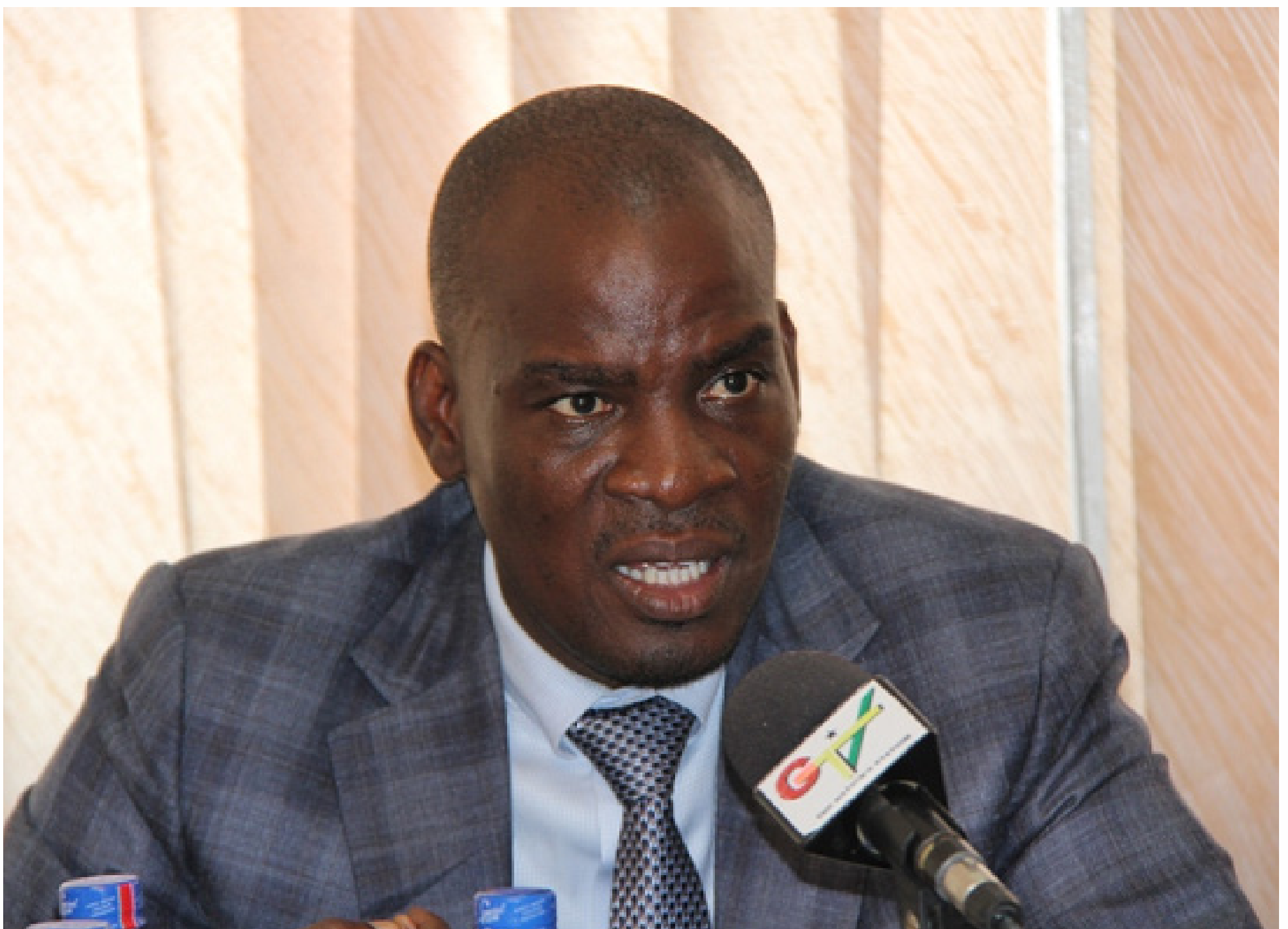
Haruna Iddrisu, Education Minister