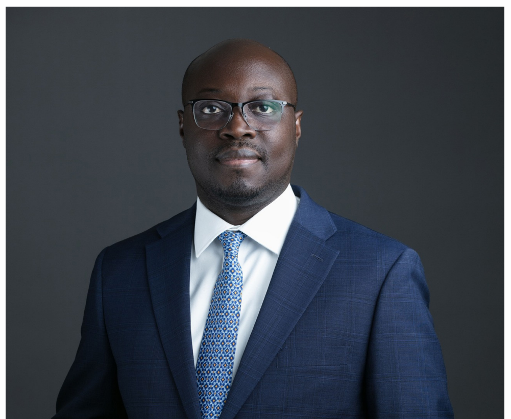
Dr. Cassiel Ato Forson, Minister of Finance