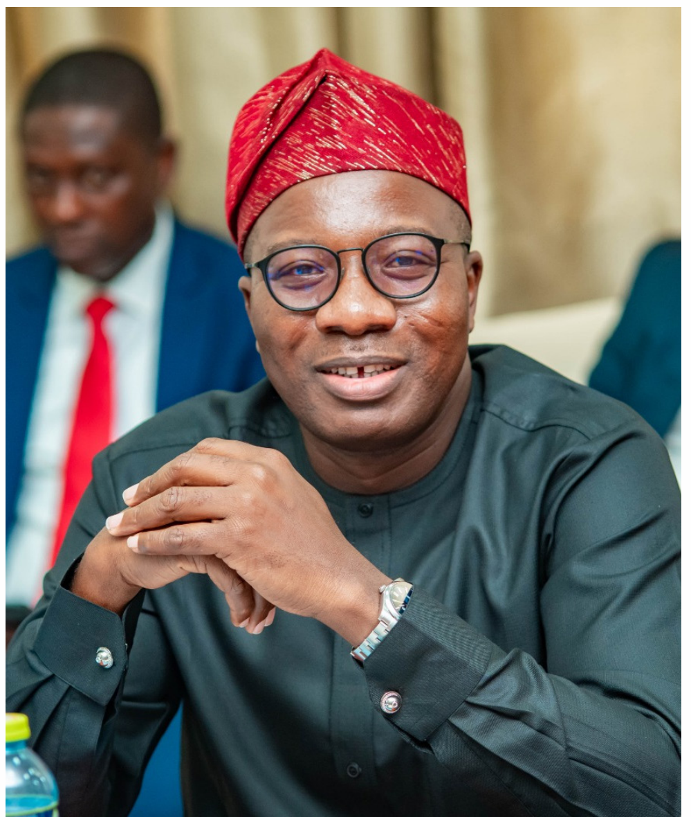
Mahama Ayariga, Majority Leadership in Parliament

Meanwhile, Dr. Ato Forson expressed heartfelt gratitude to his colleagues and the ruling National Democratic Congress (NDC) for entrusting him with the responsibility of leading the Majority Caucus since the inception of the 9th Parliament on January 7.