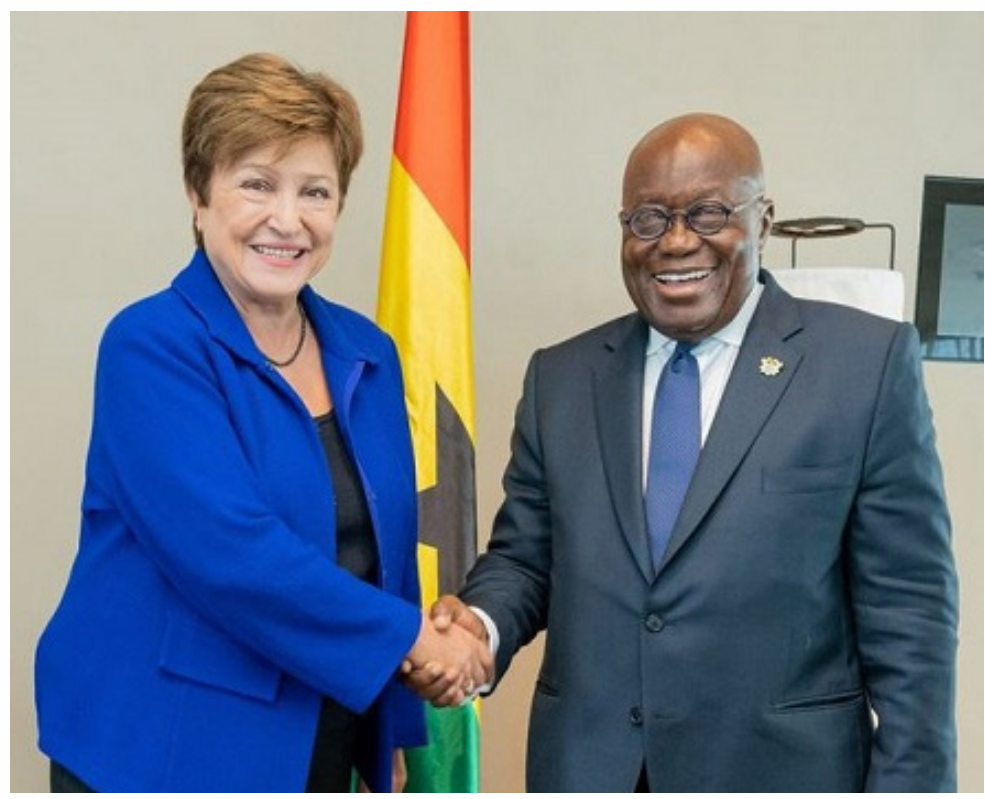
Kristalina Georgieva (L) and Nana Akufo-Addo (R)

the introduction of the e-levy, and new taxes on betting, all aimed at enhancing local revenue mobilization and addressing both domestic and external debt challenges.