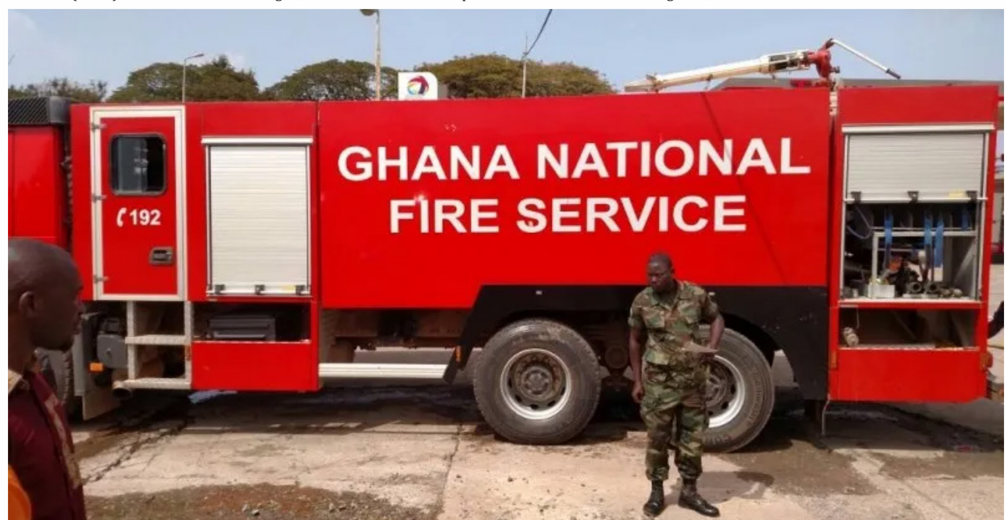
Ghana National Fire Service (GHFS)

The Ghana National Fire Service is yet to determine the cause of these recurring fires. However, public speculation is mounting, with suspicions of foul play involved in the incidents.