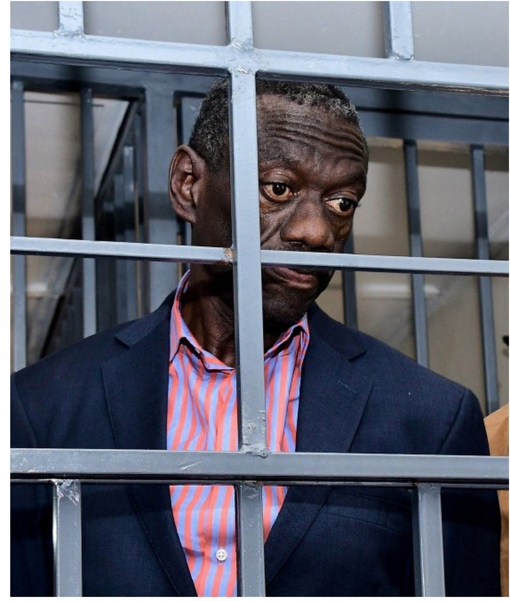
Kizza Besigye, Ugandan four-time presidential aspirant