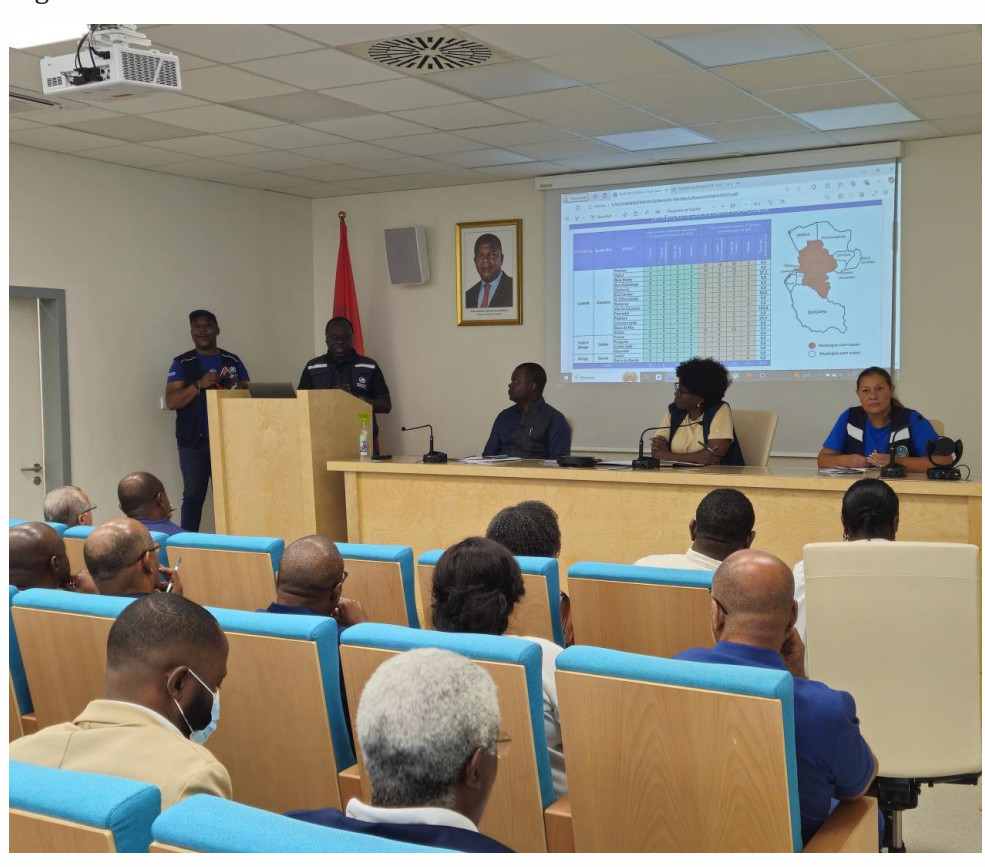
Angola's Ministry of Health and WHO held a high-level meeting