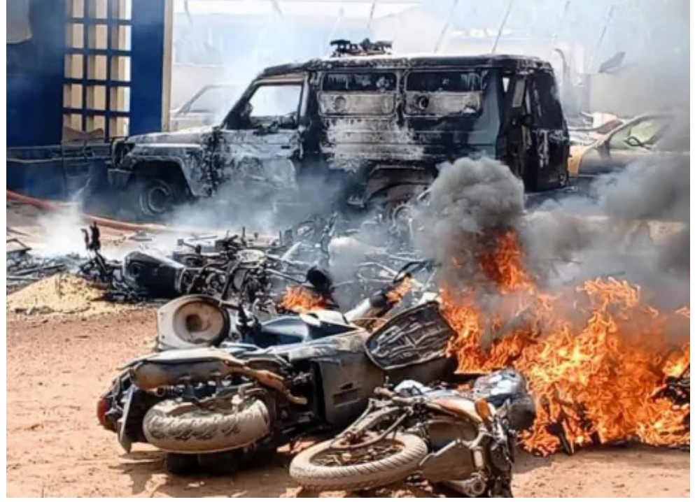
Ejura Police station set on fire