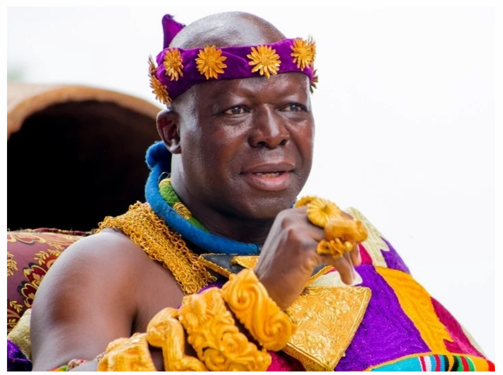
Asantehene Otumfuo Osei Tutu II

The Asantehene advocated for the decentralization of project management, urging that the project office and coordinator be based in Kumasi to enable effective stakeholder coordination.