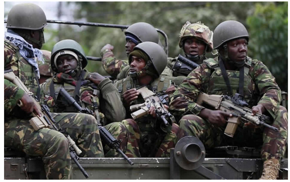
Ghana Armed Forces (GAF)

maintaining peace and stability in the country, stressing that any actions, whether deliberate or inadvertent, that disrupt the peace should be avoided.