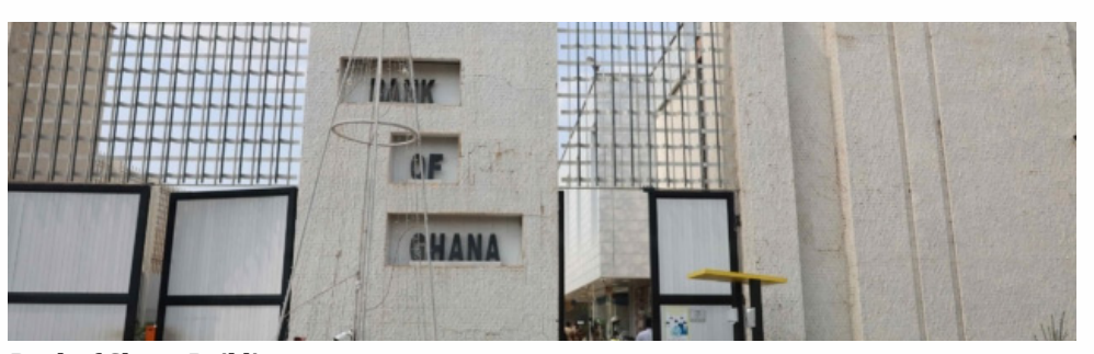
Bank of Ghana Building

In addition to the monetary penalties, potential sanctions for non-compliance may include the suspension of the RFI's involvement in bancassurance, restrictions on the institution's ability to issue further loans or make new financial commitments, limits on bonuses or excessive compensation for executives or directors as well as the removal or suspension of key individuals deemed no longer fit for their roles.