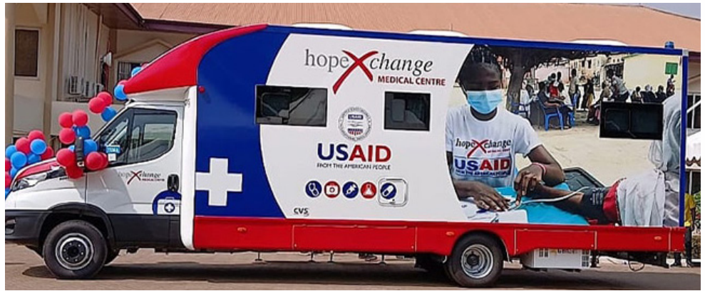
Mobile Clinic Van

A significant portion of this support, amounting to $30 million, is dedicated to advancing maternal and child health, improving nutrition, and promoting family planning, reinforcing the shared commitment of both nations to better the health and well-being of Ghanaians.