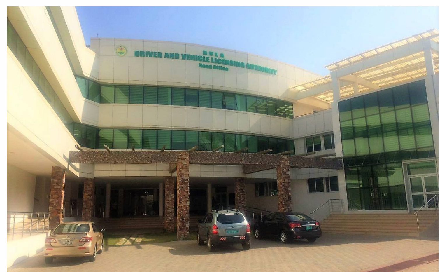
DVLA Head Office

This system aims to provide a more convenient and seamless experience for vehicle owners throughout Ghana.