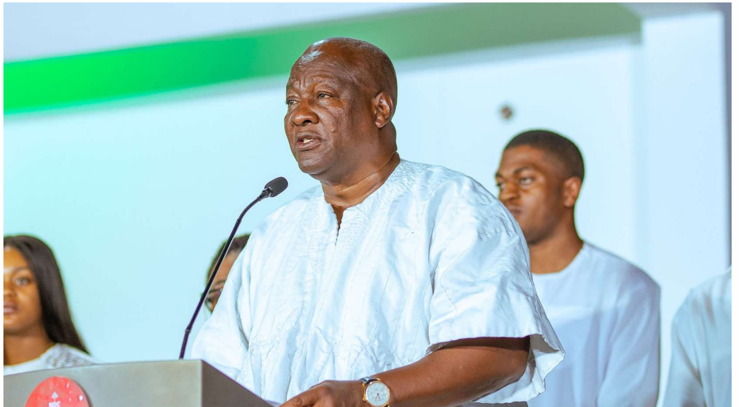
John Dramani Mahama, President-elect

"We don't think the goalpost should be shifted depending on who is at the other end of the stick. We think that there must be fairness and justice in everything we do," he added