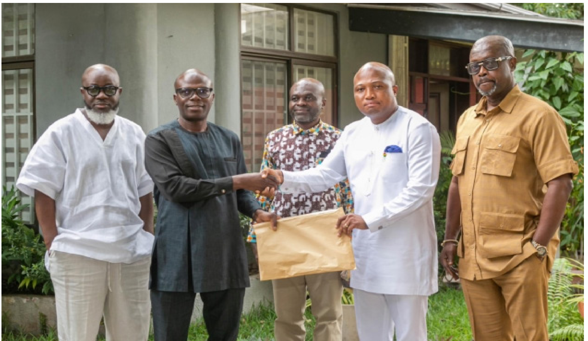
Dr Mahamudu Bawumia (L) and John Dramani Mahama (R)