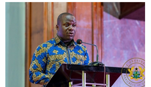
Samuel Abu Jinapor, Lands & Natural Resources Minister