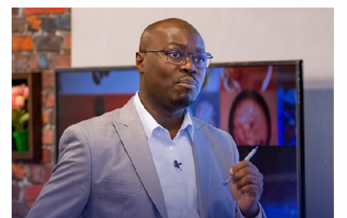
Dr. Cassiel Ato Forson, Minority leader

Additionally, key bills remain pending, such as the Architects Registration Bill 2024, the Economic and Organised Crime Office (Amendment) Bill 2024, the Vaccines Development and Manufacturing Bill 2024, and the Environmental Protection Agency Bill 2024. Notably, the Environmental Protection Agency Bill was finalized during the 5th meeting of the 4th session of the 8th Parliament on October 16 but awaits further deliberation.