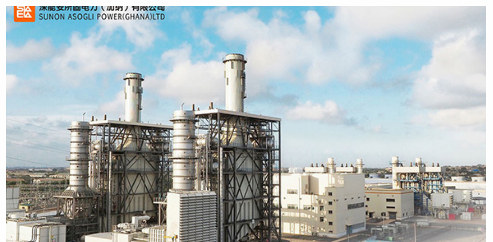
Sunon Asogli Power Plant