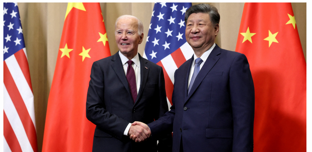
Joe Biden, US President on the left, Xi Jinping, Chinese President

"He also pointed out that the PRC does have influence and capacity, and should use it to try to prevent a further escalation or further expansion of the conflict with the introduction of even more DPRK forces."