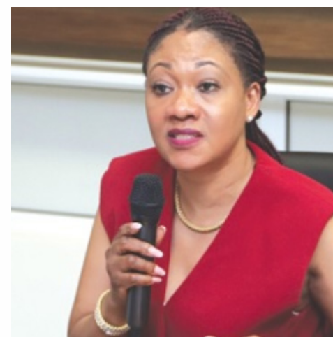
Jean Mensa, Electoral Commission Chairperson

The EC reaffirmed its commitment to maintaining a credible electoral process and assured the public that all measures are being taken to safeguard the integrity of the 2024 general elections.