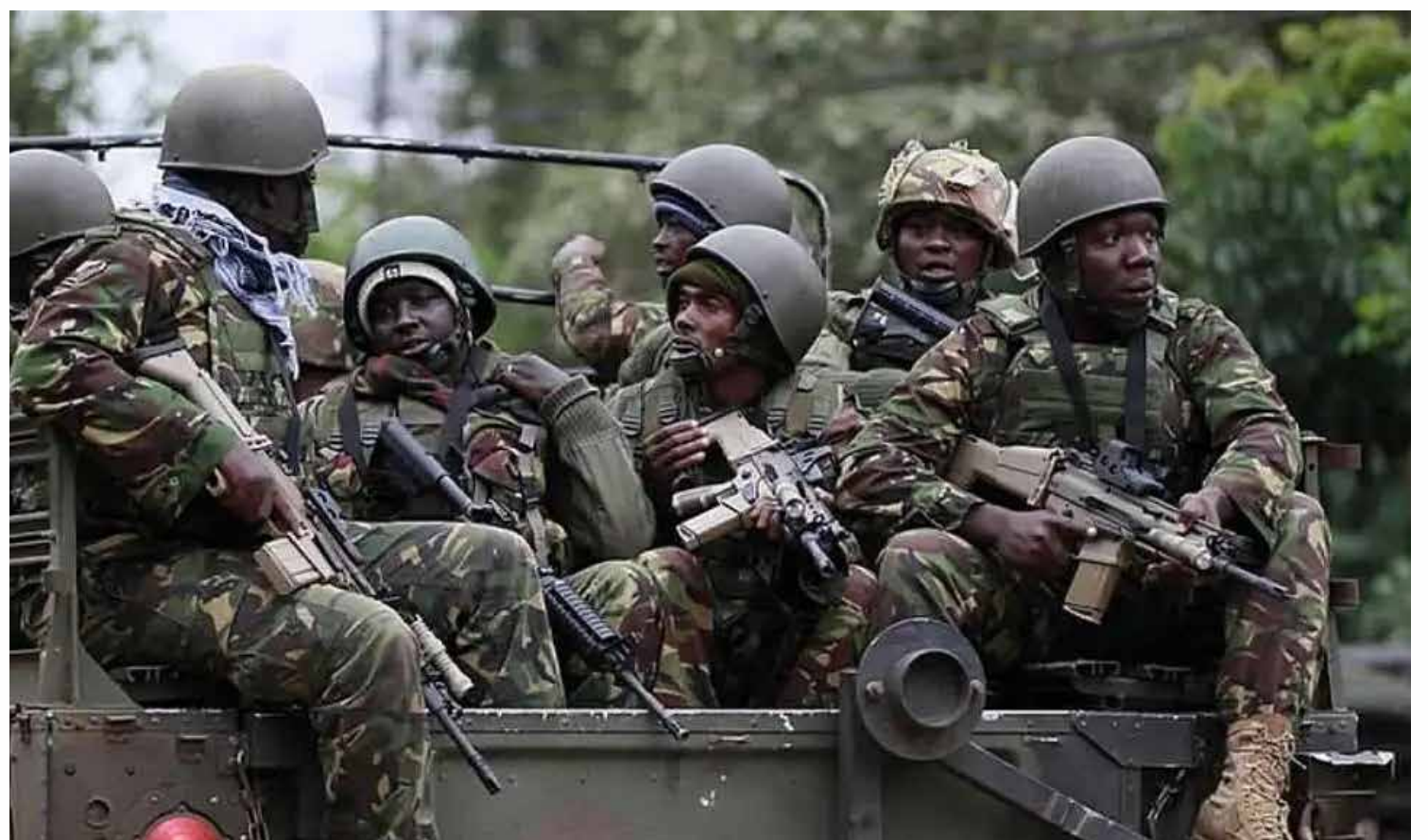
Ghana Armed Forces personnels

"No weapons should be allowed near polling stations or collation centers," Mahama insisted. He reiterated, "Election security falls under the Ghana Police Service, led by the Inspector General of Police. Therefore, no military or armed national security operatives should be deployed to polling stations or collation centers," he added.