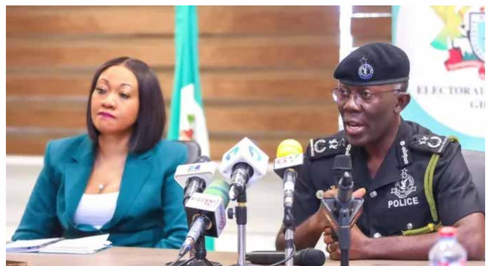
Dr George Akuffo Dampare (right), Head, National Election Task force, with Jean Mensa, Chairperson, Electoral Commission