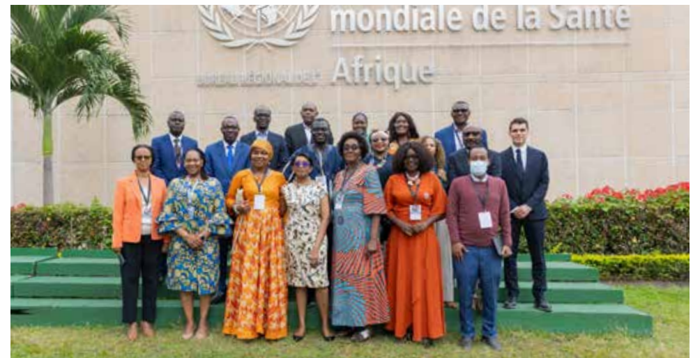
WHO Regional Validation Committee