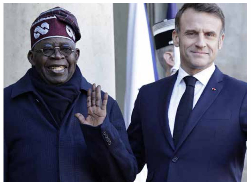
French President Emmanuel Macron (R) and Nigerian President Bola Tinubu (L)