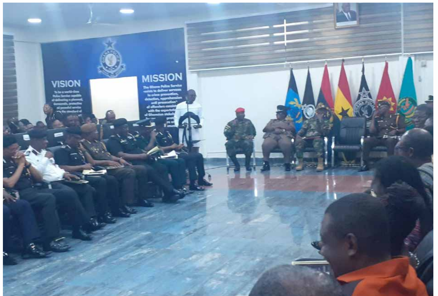
IGP Dr. George Akuffo Dampare met the University Teachers Association of Ghana (UTAG) in Accra