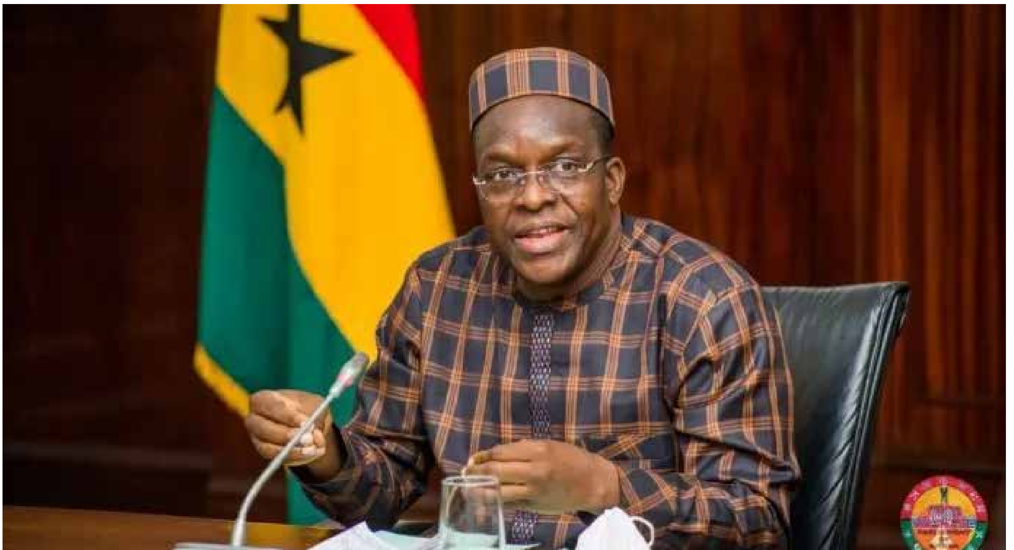
Alban Sumana Kingsford Bagbin, Speaker of Parliament

Political analysts believe the Speaker's stance reflects a broader understanding of the need for stability and focus during election periods.