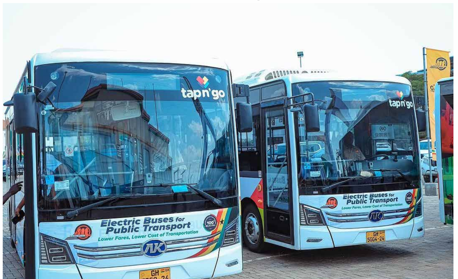
Newly acquired electric buses

broader effort to modernise Ghana's transport system while reducing dependence on fossil fuels. With high fuel costs and frequent vehicle breakdowns plaguing public transport, these electric buses are expected to provide a cost-effective and environmentally friendly alternative.