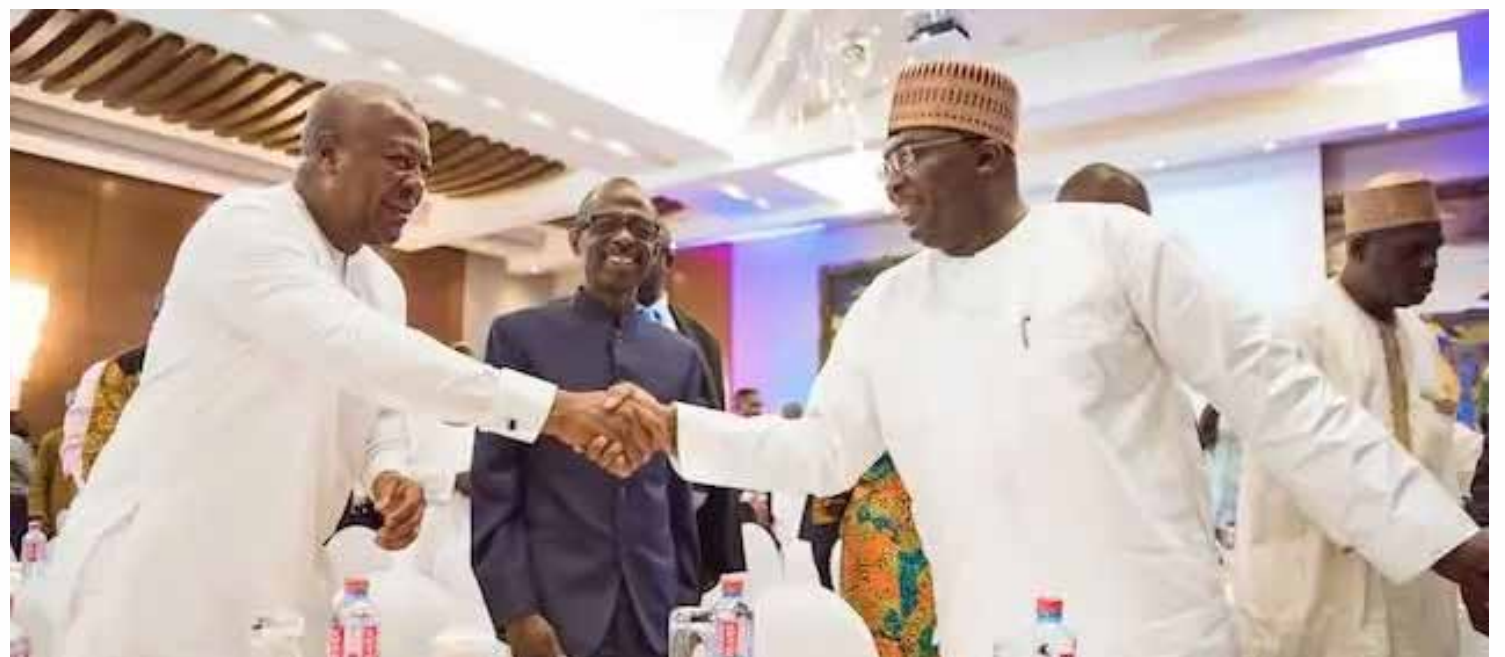
John Dramani Mahama (L) and Mahamudu Bawumia (R)

He also added that "My plea to everybody involved in the electioneering process, including candidates, political parties, electoral officers, voters, the media, security, and the general public, is to take responsibility for ensuring peace and harmony seriously and to demonstrate that we are not reluctant Democrats."