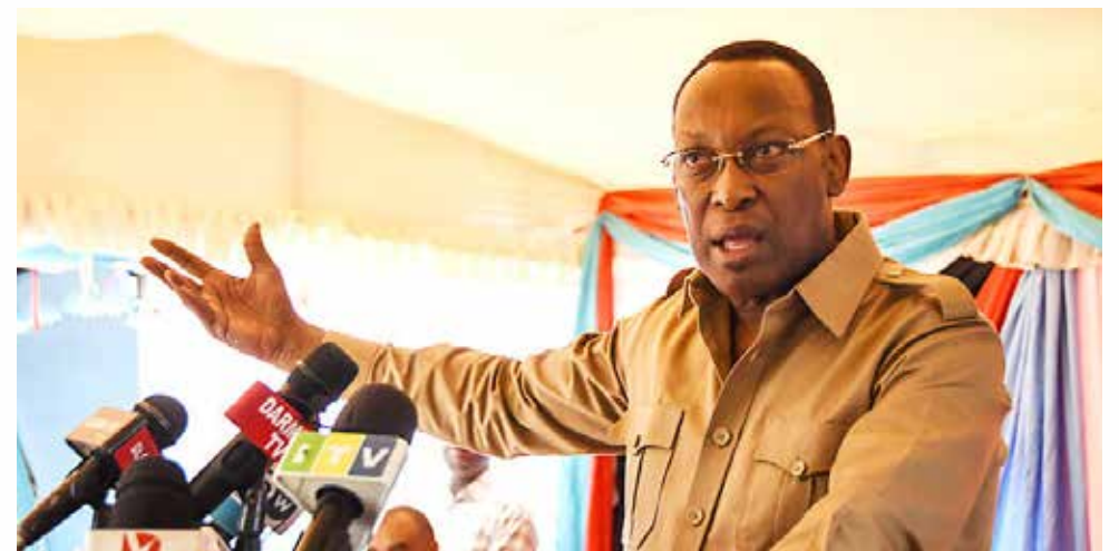
Freeman Mbowe, Leader of Tanzania's main opposition party Chadema

The resumption of opposition protests marks a renewed push for political openness and reform in Tanzania, echoing the changing political landscape under President Samia Suluhu Hassan's leadership.