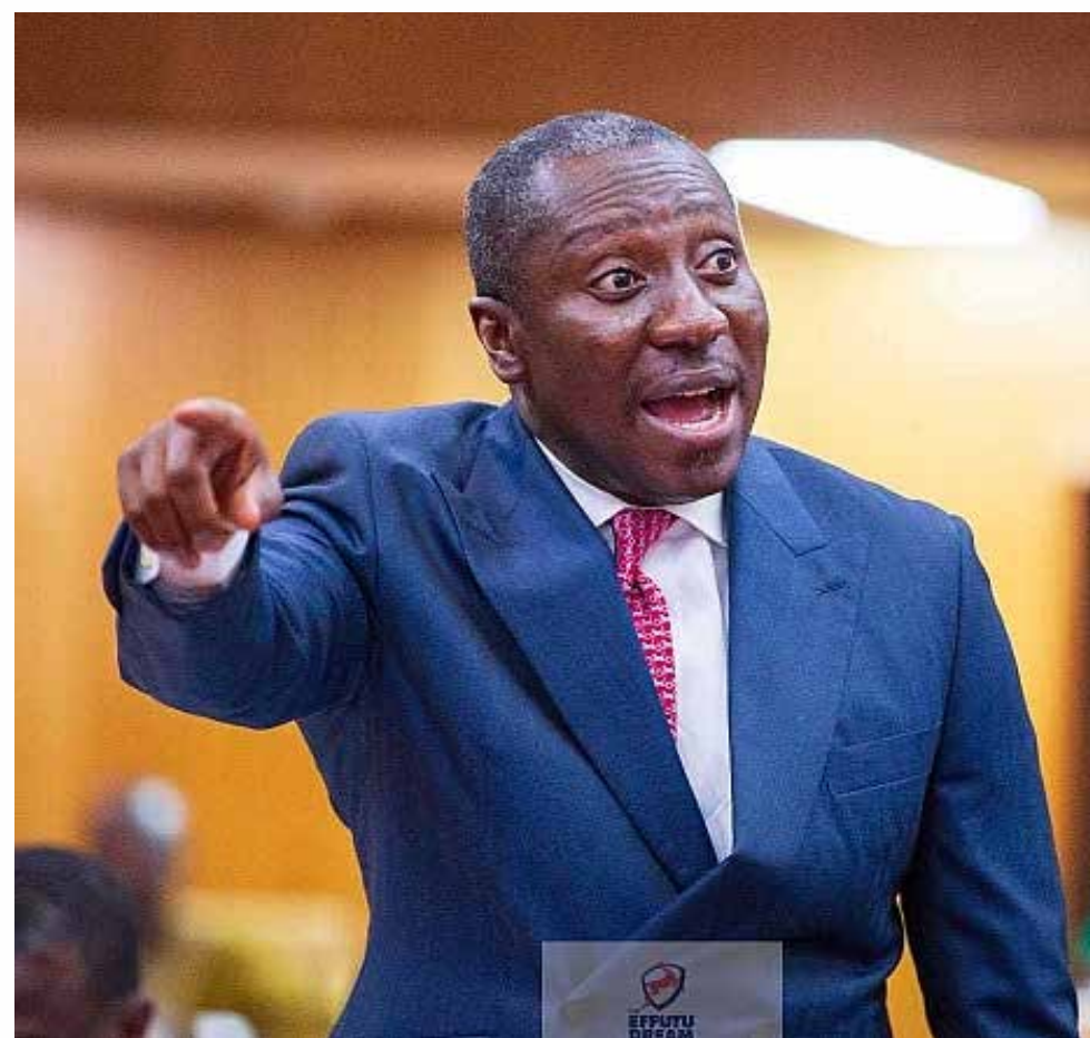
Alexander Afenyo-Markin, Majority Leader

The upcoming election and political divisions cast uncertainty over the likelihood of an effective parliamentary session.