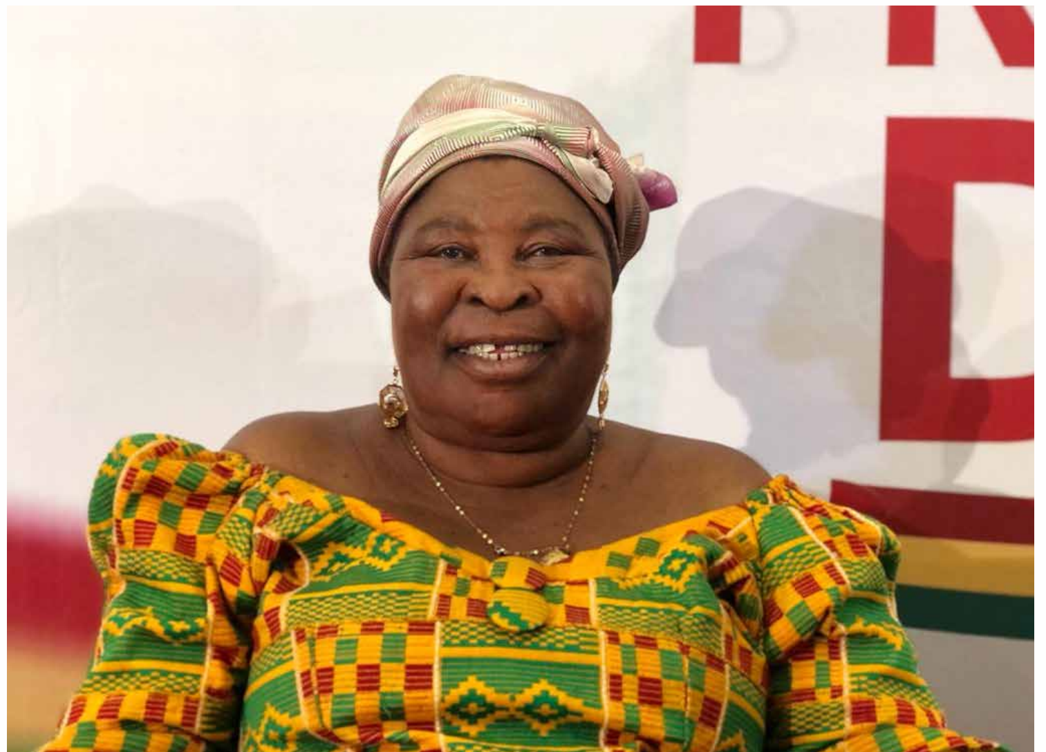
Late Madam Akua Donkor, ounder and former flagbearer of the Ghana Freedom Party (GFP)

With less than two weeks until Ghana heads to the polls to elect its new leaders, calls for peace have intensified to avoid a repeat of the electoral violence witnessed during the 2020 general elections. The EC has stood firm on its decision, citing cost savings as a primary consideration, but the controversy surrounding the matter continues to dominate discussions in the political space.