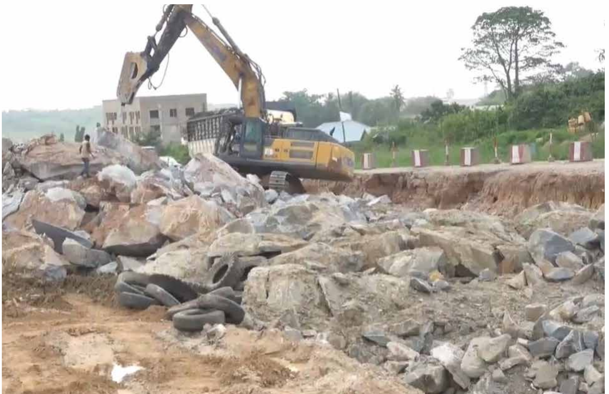
Kasoa-Winneba road expansion project

Mr Hackman also confirmed that medical expenses for victims of the Buduburam blast on October 14 had been covered, although compensation for property destruction from that incident remains unresolved.