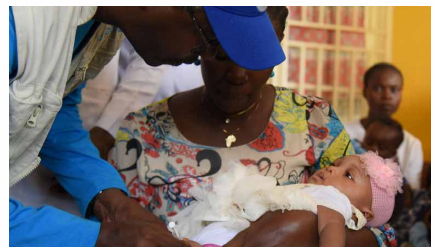
The Democratic Republic of the Congo introduces R21 malaria vaccine