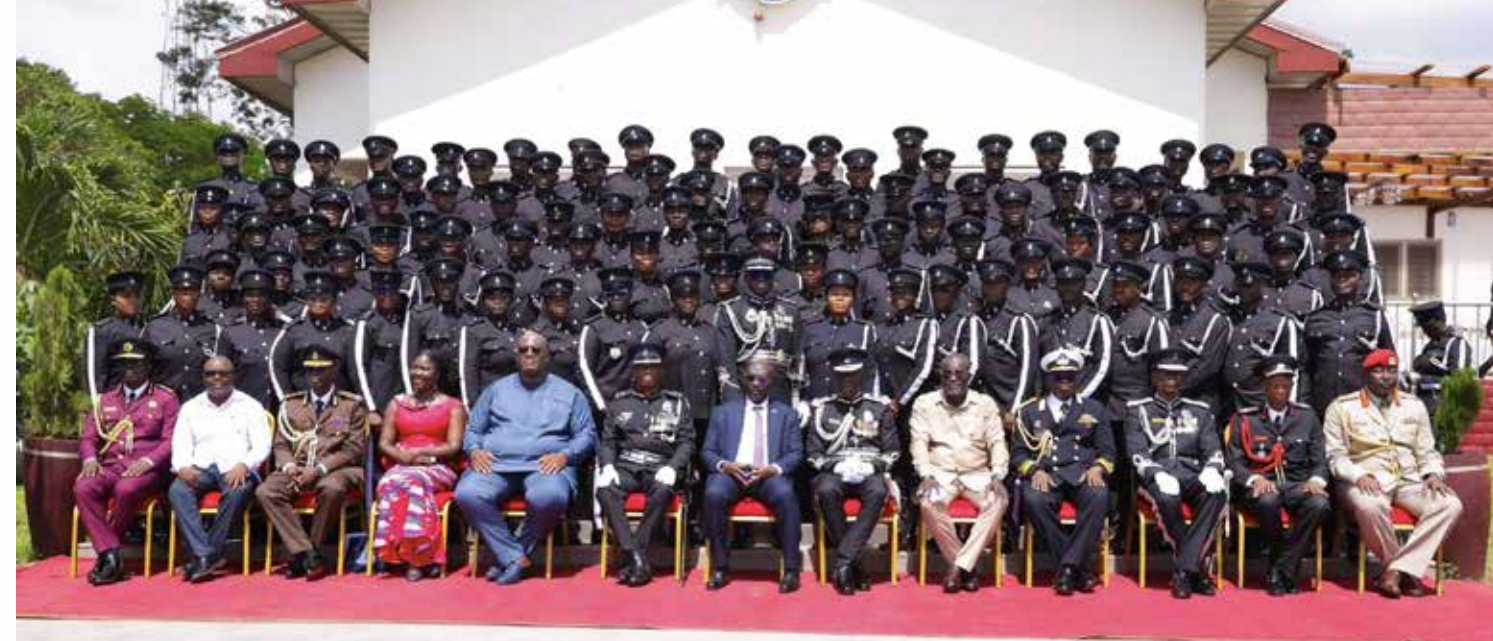
430 officers were commissioned into the Senior Officer Corps of the Ghana Police Service

As Ghana moves closer to election day, the recent graduates are expected to play a vital role in enhancing public safety and maintaining order, which authorities hope will deter potential disruptions at the polls.