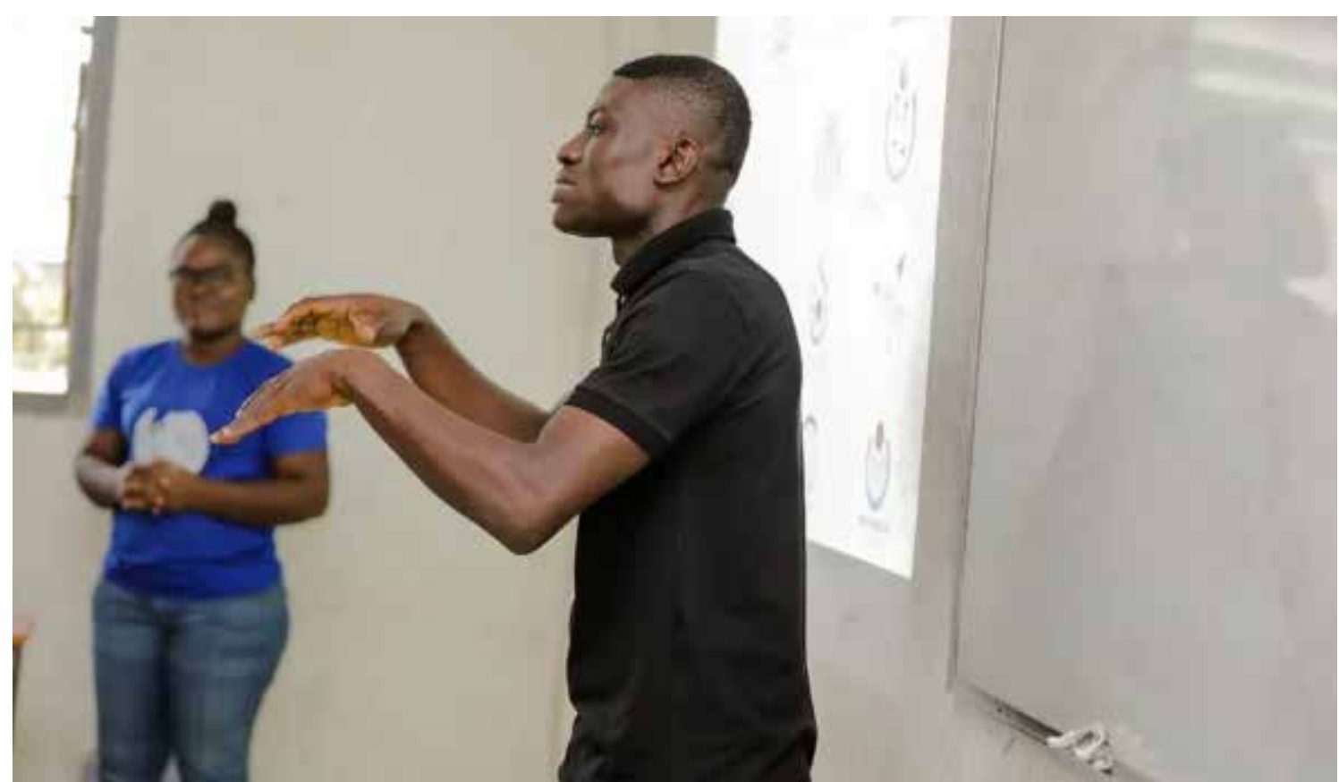
Sign language instructor

outlined in Section 21 of the Act. NaCCA's planned curriculum also aligns with core educational competencies that promote communication skills. competencies encourage learners to use language, symbols, and texts to share personal experiences and information, fostering more collaborative and inclusive learning environments.