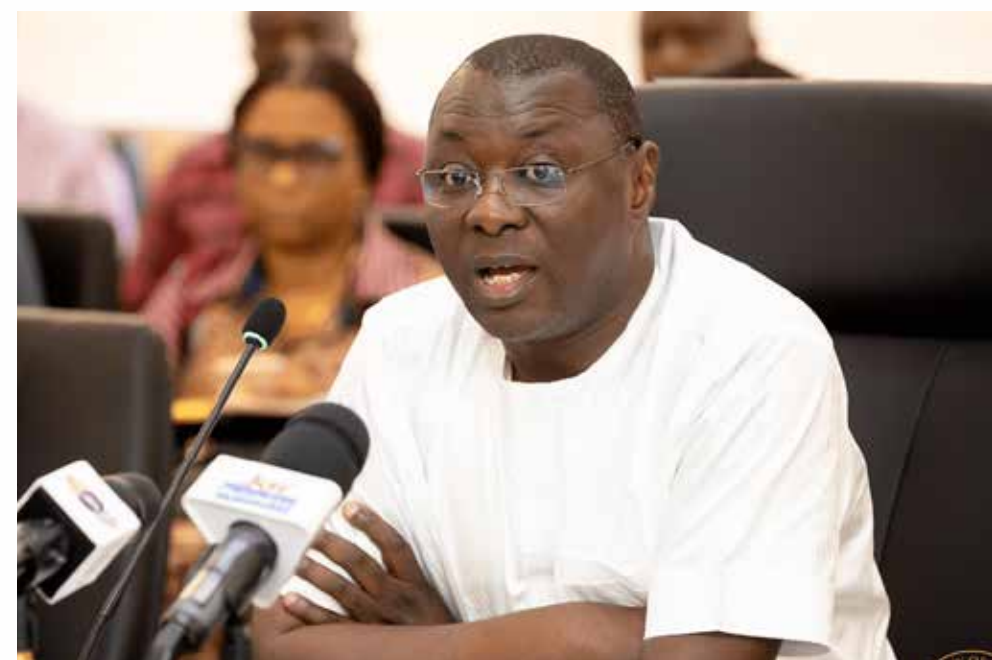
Dr Mohammed Amin Adam, Finance Minister

As the government continues managing high debt and interest payments, Ghana's fiscal health and foreign exchange reserves will be closely watched by local businesses and international investors alike.