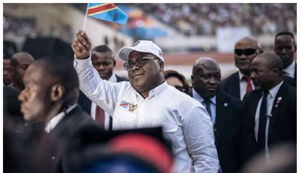
Felix Tshisekedi, President of DR Congo

They say that reforms are needed to protect the country’s sovereignty amid changing political and military dynamics in the region.