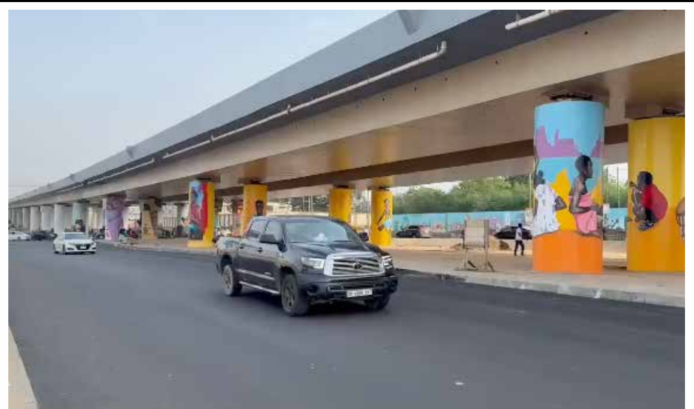
Flower Pot Interchange