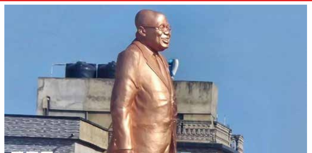
President Akufo-Addo's statue at the Effia-Nkwanta Regional Hospital in Takoradi