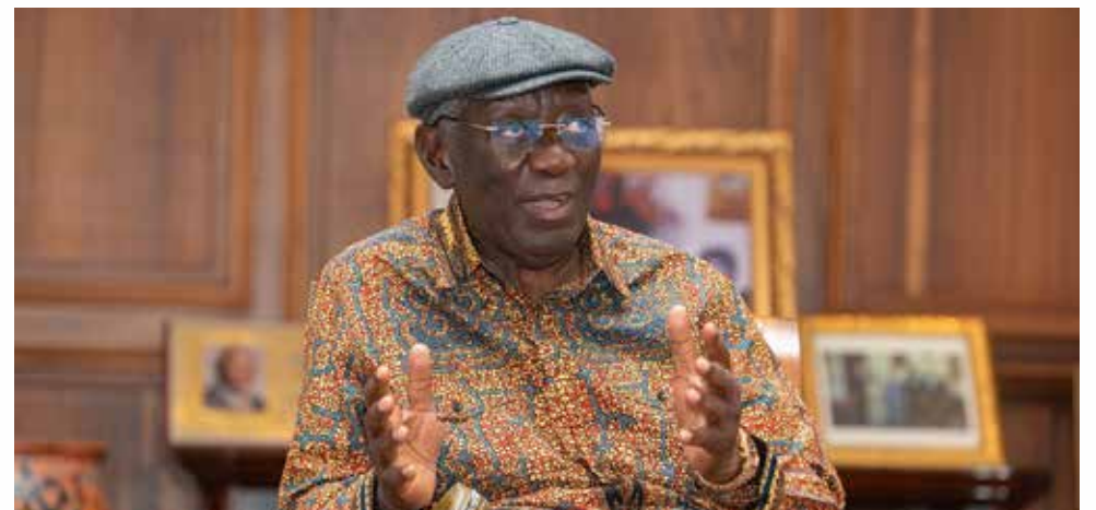
John Agyekum Kufuor, Former President of Ghana