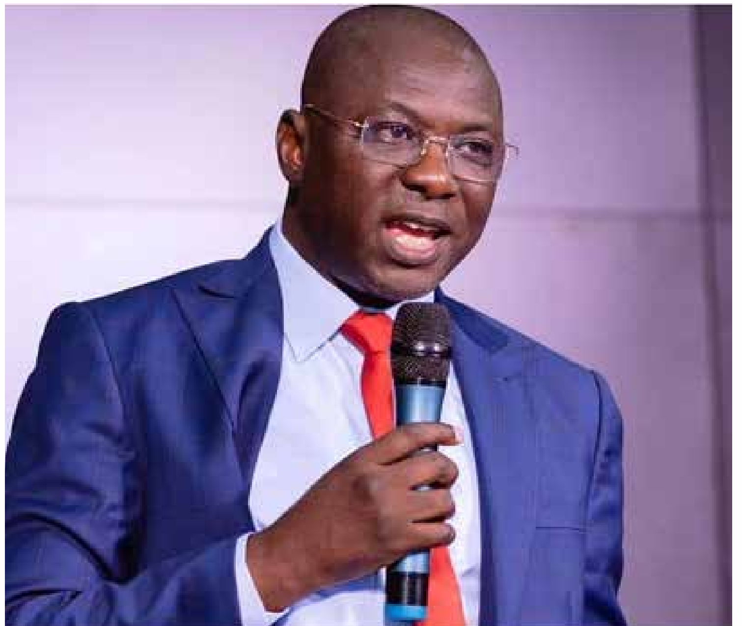
Dr. Mohammed Amin Adam, Finance Minister

Businesses in Ghana are currently grappling with high inflation, cedi depreciation, and multiple tax obligations, which continue to strain their operations. The GRA, tasked with ensuring compliance with tax laws, is under pressure to secure a stable revenue flow for the government amid these economic challenges.