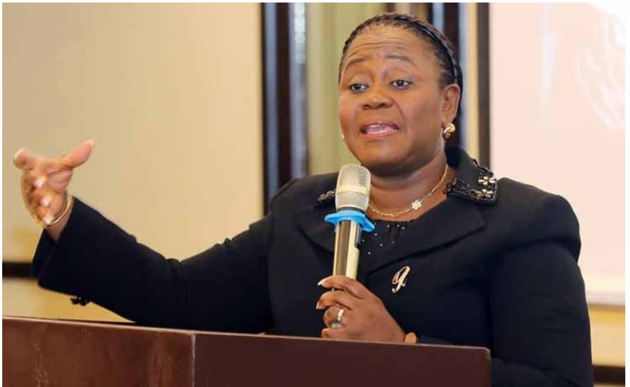
Gertrude Torkornoo, Chief Justice

in Kumasi on October 17, 2024, annulled the warrant, paving the way for his return. His return on October 26 reignited the chieftaincy conflict, resulting in gunfire that left two dead and several others injured. The community now faces heightened tensions, with a curfew from 6:00 p.m. to 6:00 a.m. enforced by security forces in an effort to restore peace. As of now, approximately 21 people are believed to have died due to the unrest in the area.