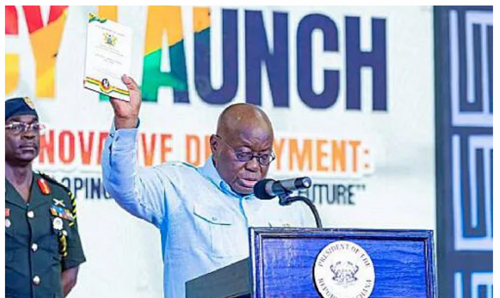
Nana Akufo-Addo, President of Ghana

With its new mandate, the NSA aims to play a key role in driving national development by harnessing the talents and skills of young Ghanaians.