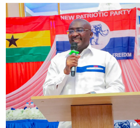
Dr. Mahamudu Bawumia, Vice President & NPP Flagbearer

He encouraged NPP supporters to stay united and continue their efforts ahead of the December 7 elections, emphasising that victory would be determined at the polling stations. "By midnight on December 7, you'll hear that the NPP has won a decisive majority in Parliament," Dr. Bawumia confidently predicted.