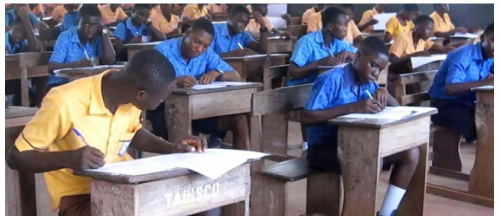
Kotoka International Airport

The BECE for Private Candidates saw 1,390 participants—750 males and 640 females—who sat for the exam at 15 centres in the regional capitals. Among these, 57 candidates were reported absent.