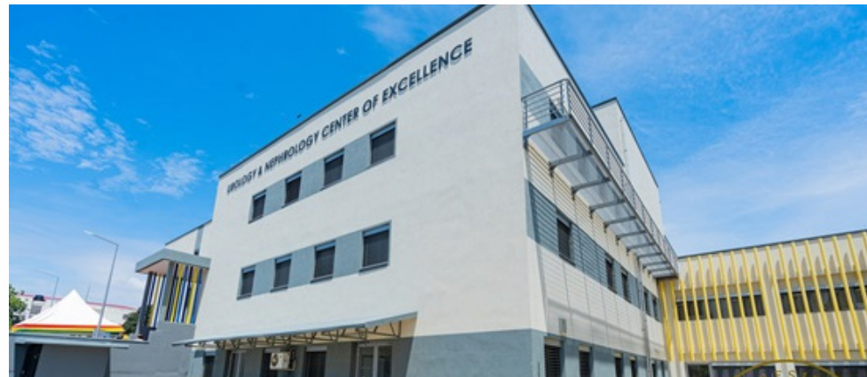
Urology & nephrology centre, Korle Bu

In addition to the new centre, President Akufo-Addo reaffirmed his government's commitment to the Agenda 111 project, aimed at expanding the country's healthcare facilities. Once completed, the project is expected to significantly increase the number of hospital beds across Ghana, further improving access to quality healthcare.