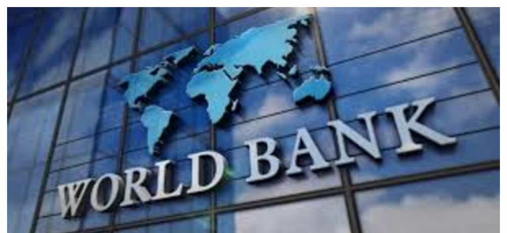
World Bank Logo

Despite the recent rate cut, Fitch highlighted concerns about the cedi's sharp depreciation and the Bank of Ghana's strong focus on controlling inflation. The firm adjusted its year-end forecast for the policy rate from 25%, reflecting the persistent challenges facing Ghana's economy.