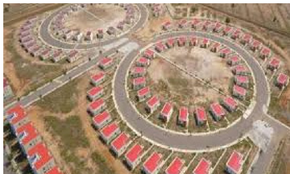
Saglemi Housing Project

Analysts suggest that the completion of the project will not only provide much-needed accommodation but also stimulate related industries such as construction, real estate, and infrastructure development. However, questions remain over whether the government's financial strategy—recovering investments upon completion—will be enough to meet the project's long-term goals.