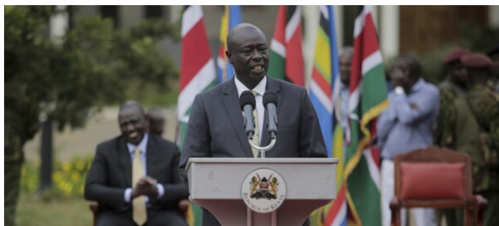
Rigathi Gachagua, Kenya's Impeached deputy President

On Sunday, while addressing a national holiday celebration, Ruto called for national cohesion and an end to "tribalism and exclusion".