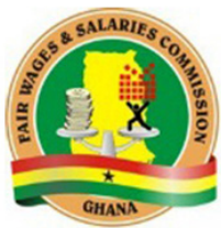
Fair Wages & Salaries Commission

Fair Wages Commission rejects PSWU strike call amidst ongoing negotiations