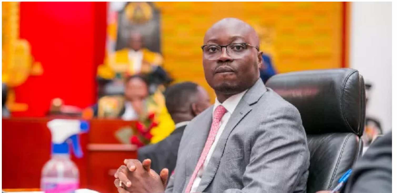
Dr Cassiel Ato Forson, Minority Leader

The Supreme Court has ordered the Speaker and Attorney General to file their statements of case within seven days, indicating that this battle is far from over. In the meantime, Ghana's political landscape remains fraught with uncertainty as both parties vie for supremacy in Parliament and beyond.