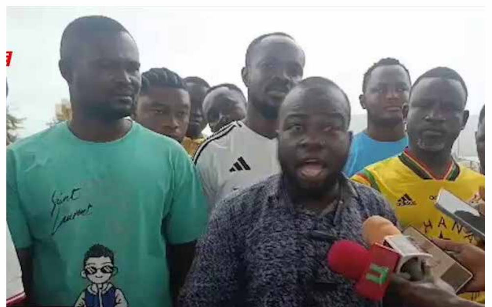
Tricycle operators and okada riders from New Abirem