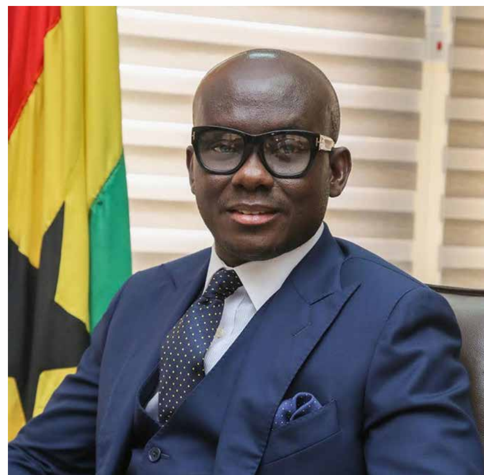
Godfred Dame, Attorney-General and Minister for Justice

"The peace and territorial integrity of our nation at this time... is far greater than the pursuit of any parochial political goals, just as the right to free expression is no more paramount than the right of others to access essential services and the duty of the Police to maintain the peace of Ghana," Mr. Dame concluded.