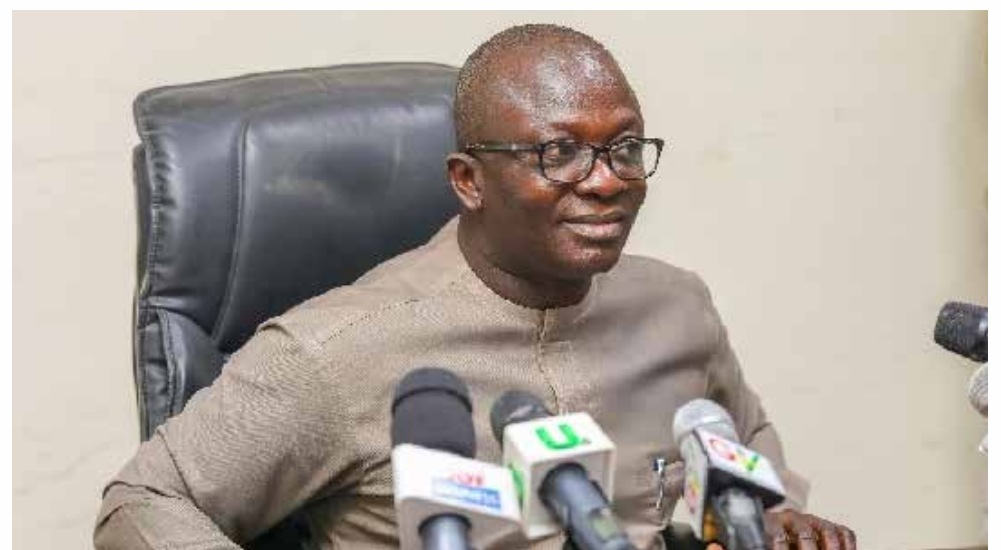
Dr. Bryan Acheampong, Minister for Food and Agriculture