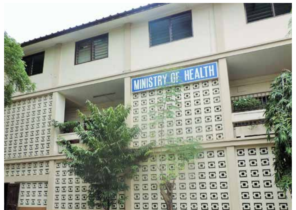
Ministry of health

The Ministry has requested police assistance in identifying the driver involved in the patient's initial accident and verifying her identity through missing persons records. An autopsy has been commissioned to establish the exact cause of death.