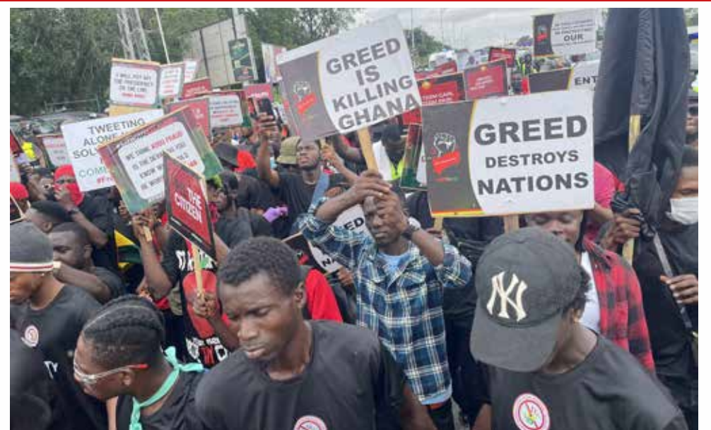
Protectors at the anti-galamsey, FreeTheCitizens demonstration