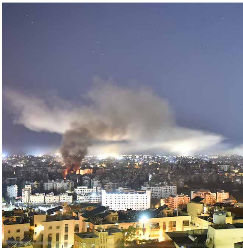
Smoke rises from the site of an Israeli airstrike in Dahiyeh, Beirut, Lebanon

This article is based on information from CNN and AP news reports.