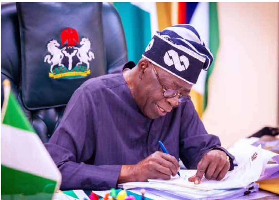
Bola Ahmed Adekunle Tinubu, President of Nigeria

He said the bills will strengthen fiscal institutions in the country and align with the objective of the government.