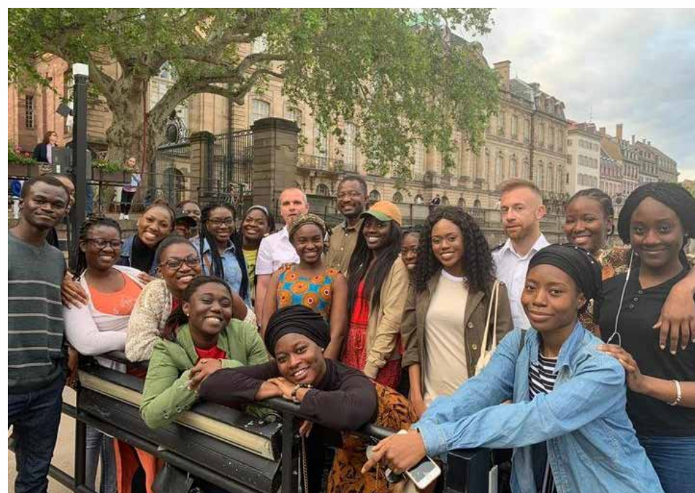
Ghanaian students studying abroad