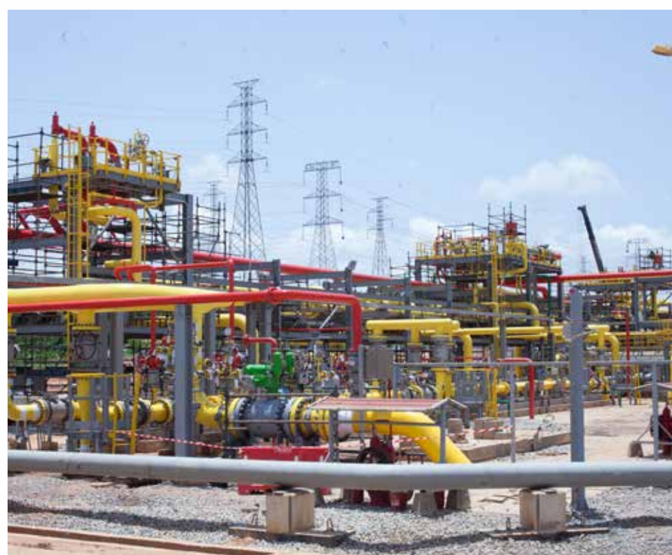
Ghana gas processing plant

sector was projected to add GHS10.25 billion (approximately $855.3 million) to Ghana's Gross Domestic Product (GDP), emphasizing the importance of ongoing investment and infrastructure development in the gas industry.