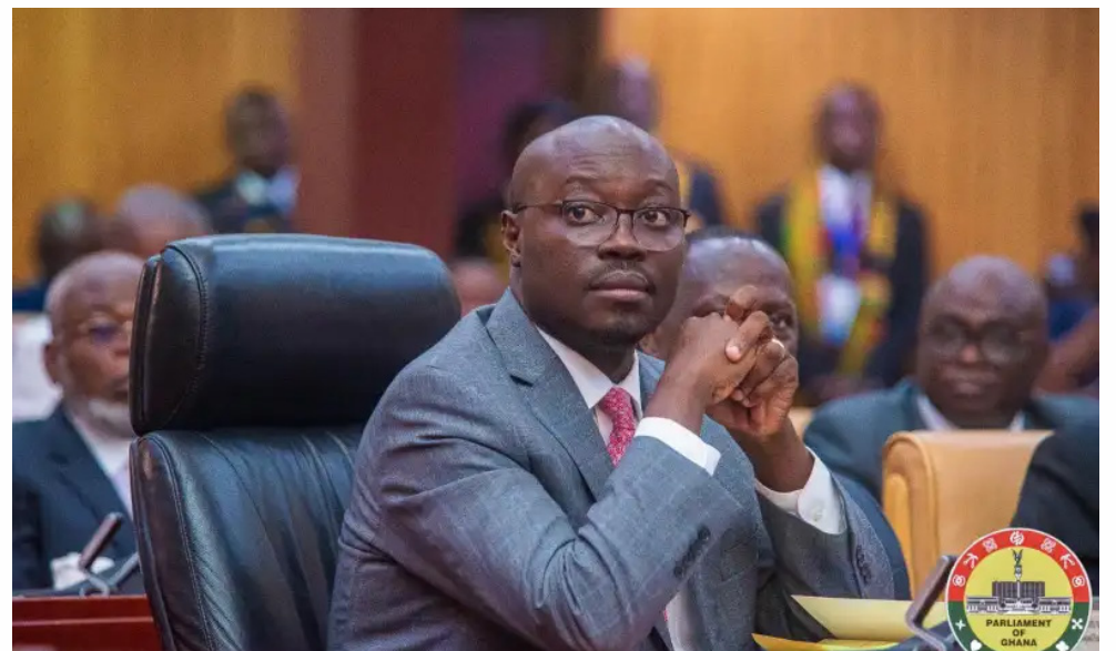
Dr. Cassiel Ato Forson, Minority Leader

tax exemptions for 42 companies under the 1D1F initiative in 2021. The Exemptions Act, 2022 (Act 1083), introduced by former Finance Minister Ken Ofori-Atta, supports this process. Among the companies, Sentuo Oil Refinery Limited has requested the largest exemption amounting to $164,633,012.00.