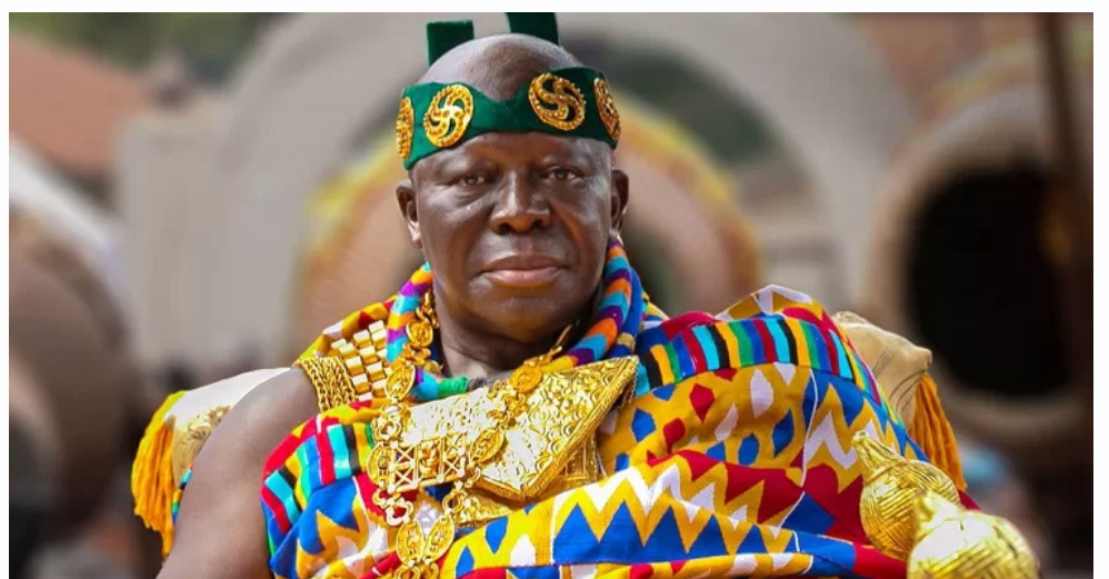
Otumfuo Osei Tutu II, Asantehene

The actions of the Gyaasehene are said to have contributed to the pollution of the River Asuonfou, a major water source in the area, disrupting the daily activities of residents, both domestic and commercial, that are dependent on water.