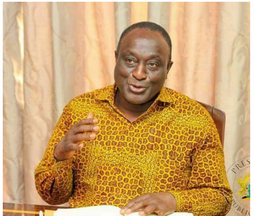
Alan Kyerematen, Leader for Movement for Change

including deploying security forces and making arrests, have not yet effectively resolved the problem.