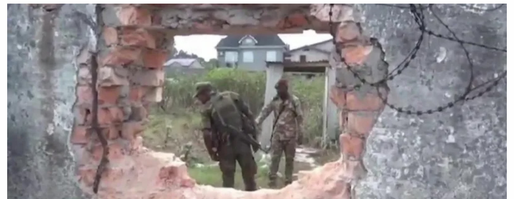
Broken prison wall

The justice minister has promised to intensify efforts to decongest prisons across the country.