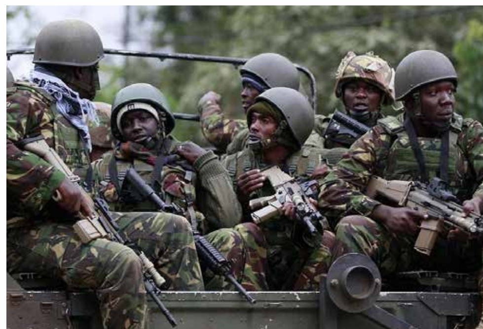
Ghana Armed Forces

GAF wishes to remind the general public that it does not employ middlemen or agents for enlistment. Therefore, the public is strongly advised to desist from paying monies to any person(s) who present themselves as middlemen or agents with the promise of helping potential applicants to secure enlistment into GAF.