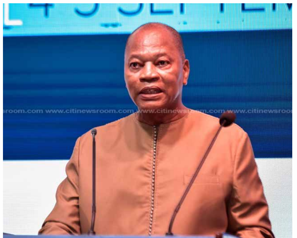
Dr. Mohamed Ibn Chambas, Former United Nations Special Representative