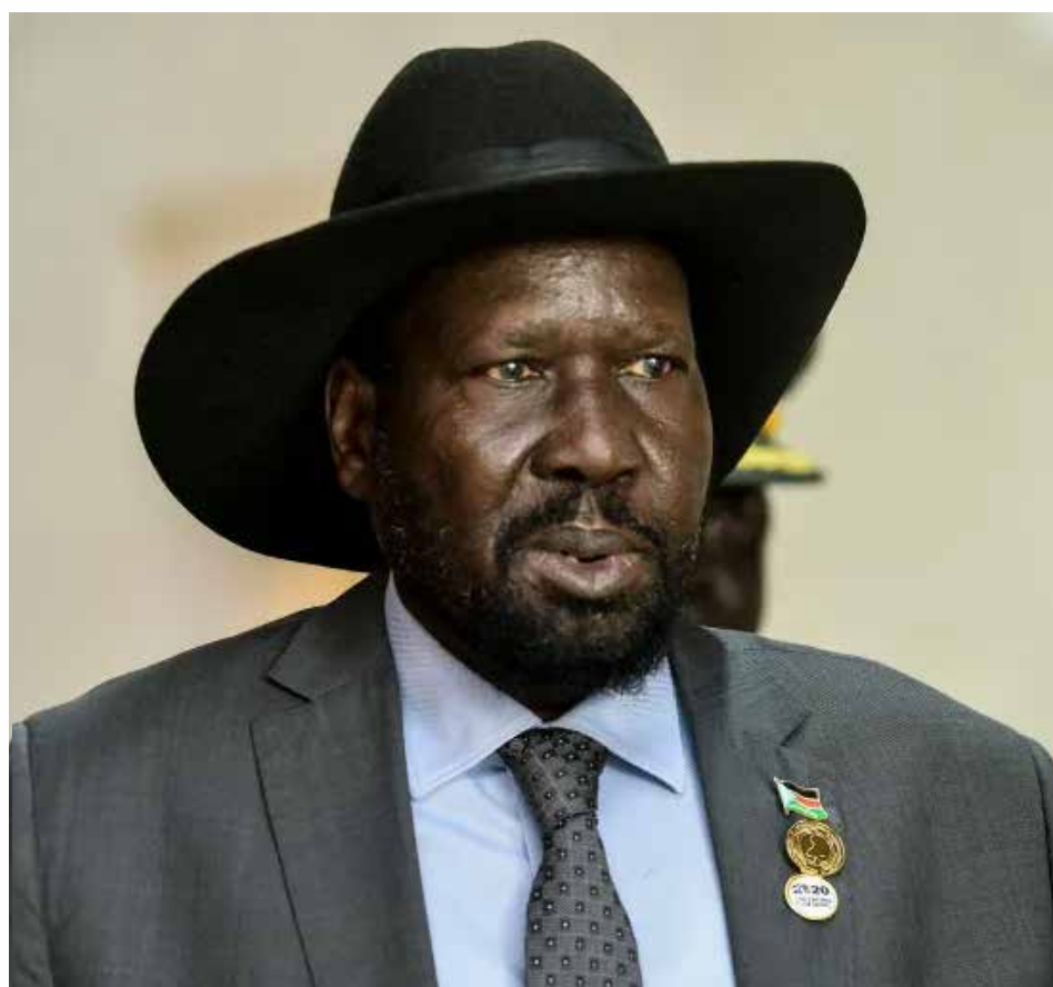
Salva Kiir Mayardit, President of Southern Sudan

Those in charge are the same leaders who plunged the country into a five-year civil war. Given the current relative peace and the fact that neighbouring Sudan is being destroyed by conflict, South Sudan's politicians may not come under much international pressure.