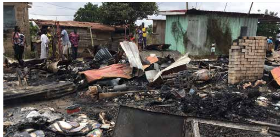
Kpone kokompe after fire outbreak