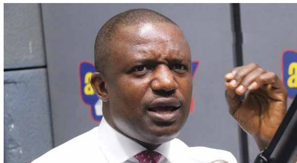
John Abdulai Jinapor, MP for Yapei-Kusawgu and former Deputy Minister of Energy

The situation has raised concerns about the long-term stability of Ghana's energy sector, with stakeholders calling for decisive action to prevent further deterioration.