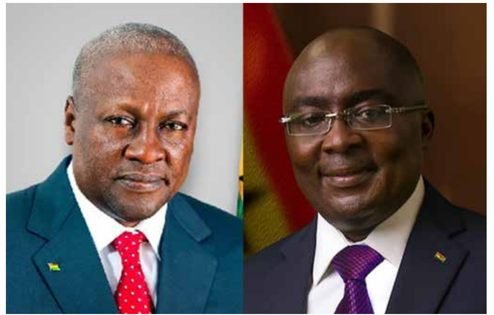
John Dramani Mahama (L) and Dr Mahamudu Bawumia (R)

The outcome of these deliberations by the two major political parties will determine the structure of the presidential debate as Ghana prepares for the upcoming election.