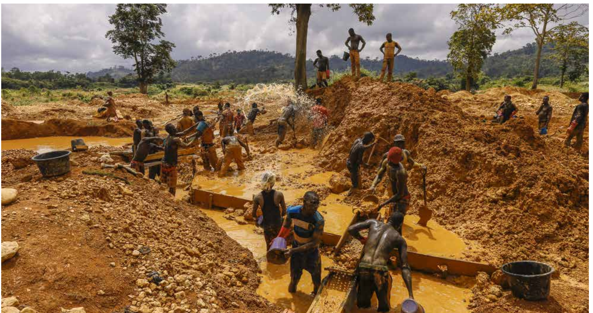
Illegal mining (Galamsey)

The ministerial committee is expected to provide key insights and recommendations that will shape future government initiatives aimed at eliminating illegal mining and preserving Ghana's natural resources.