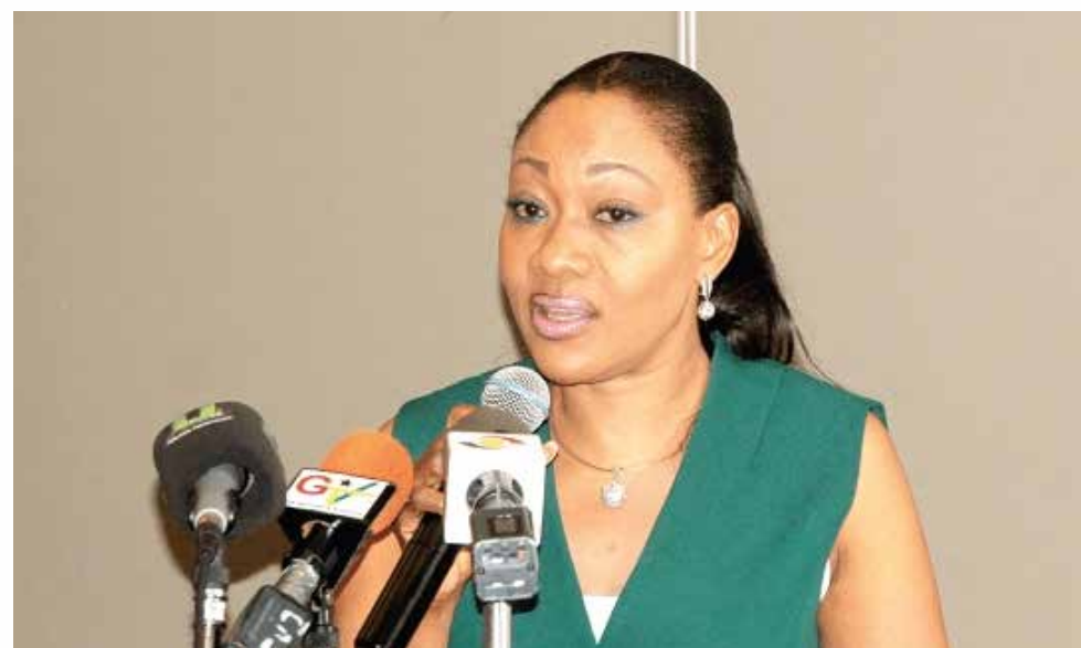
Jean Adukwei Mensa, Electoral Commissioner