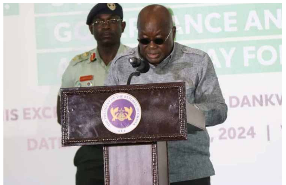
Nana Akufo-Addo, President of Ghana

He called for a review of how SOE executives are appointed and a stronger emphasis on financial accountability, saying, "We cannot celebrate mediocrity in management. These companies must rise up."