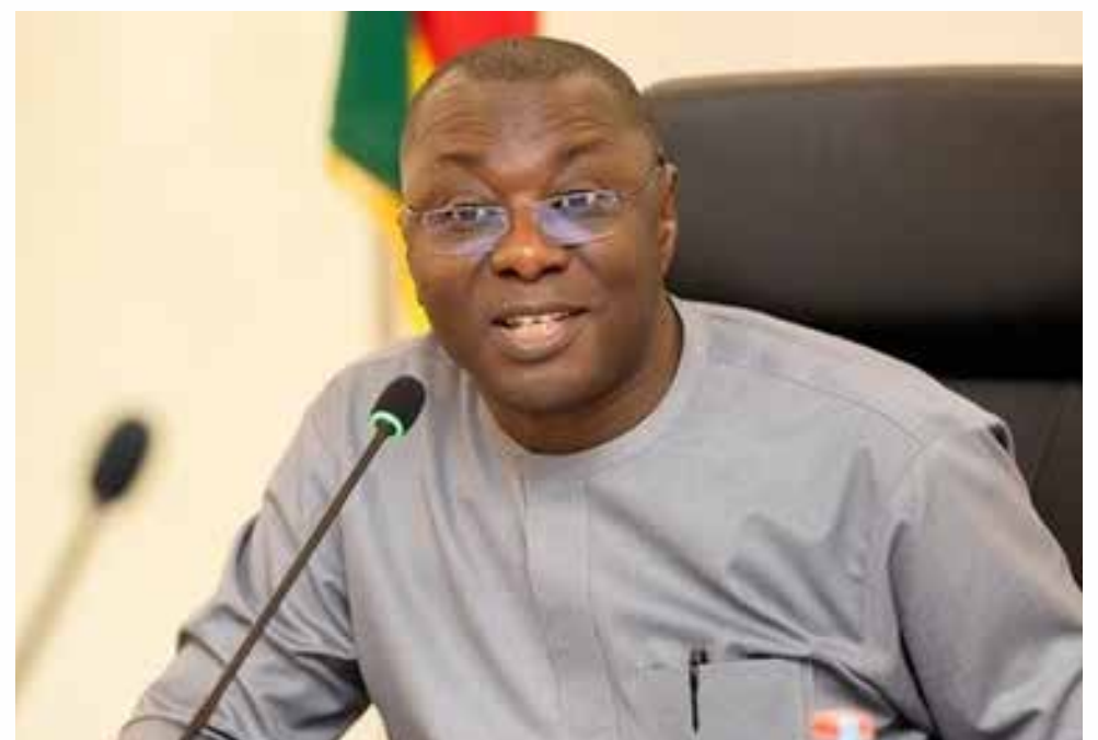
Mohammed Amin Adam, Finance Minister

A meeting will soon be held by AM Fund managers to guide investors on how to access their funds and explore prospects for leaving their claims in the AM Fund for future management.