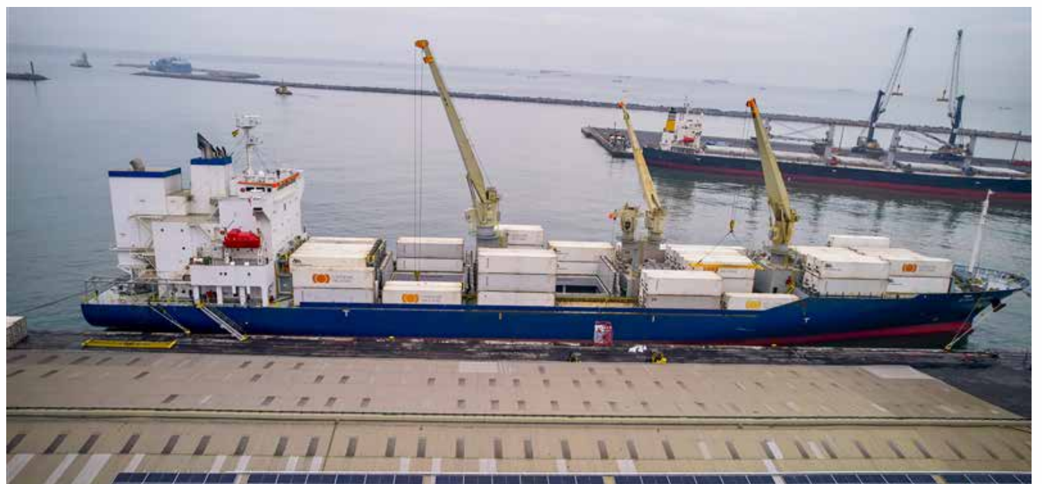
J.A Kufuor floating oil vessel

The maintenance is part of efforts to sustain the country's energy supply.