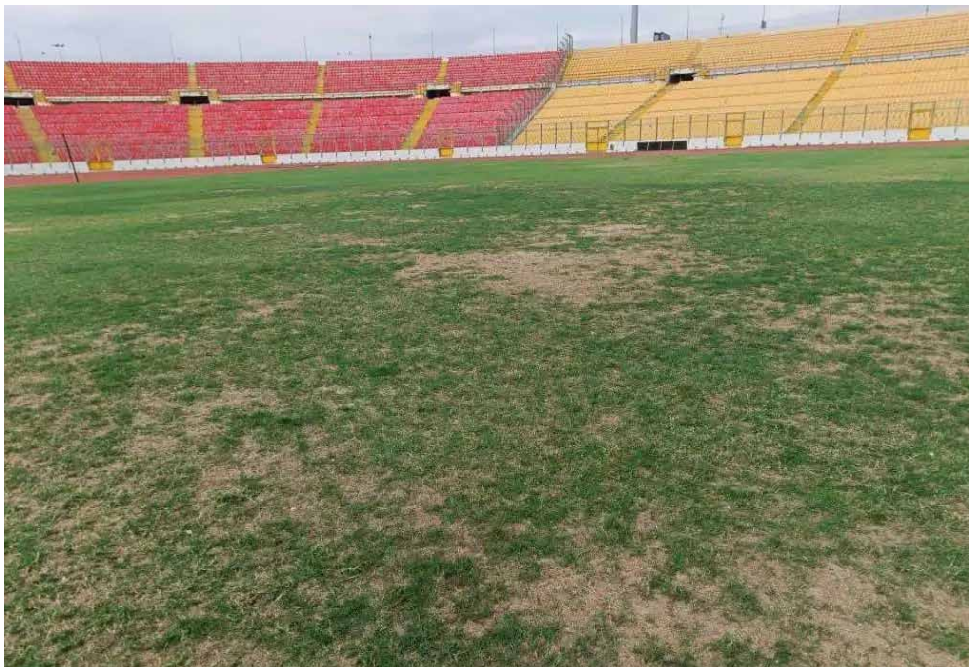
Baba Yara Stadium

As the clock ticks down to the October 11 match, securing a local venue is essential for the Black Stars to play in front of their home crowd. Ghana will face Sudan, managed by former Black Stars coach and current GFA Executive Council member Kwesi Appiah.