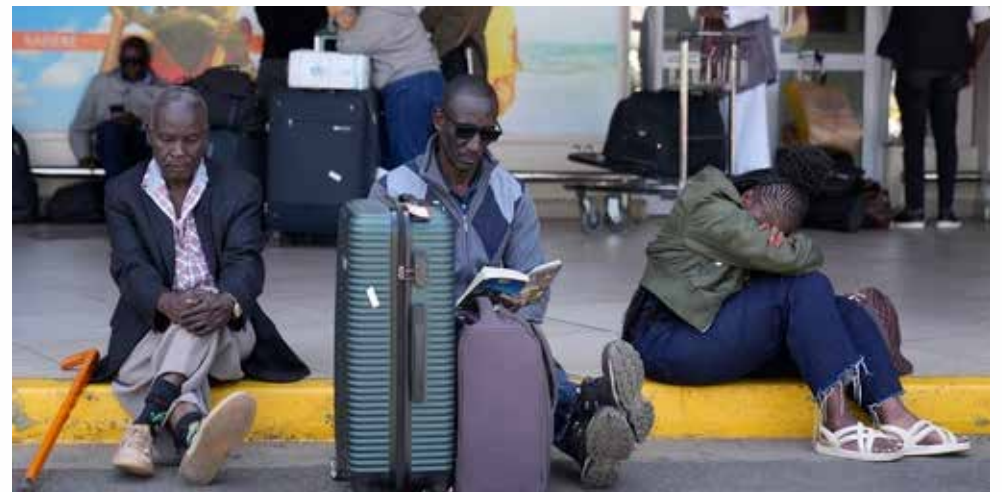
Stranded passengers wait for their delayed flights out of JKIA airport

Last year, a US-based investment firm accused the Adani Group of decades of "brazen" stock manipulation and accounting fraud. The Adani Group rejected this allegation, but India's market regulator has launched an investigation.