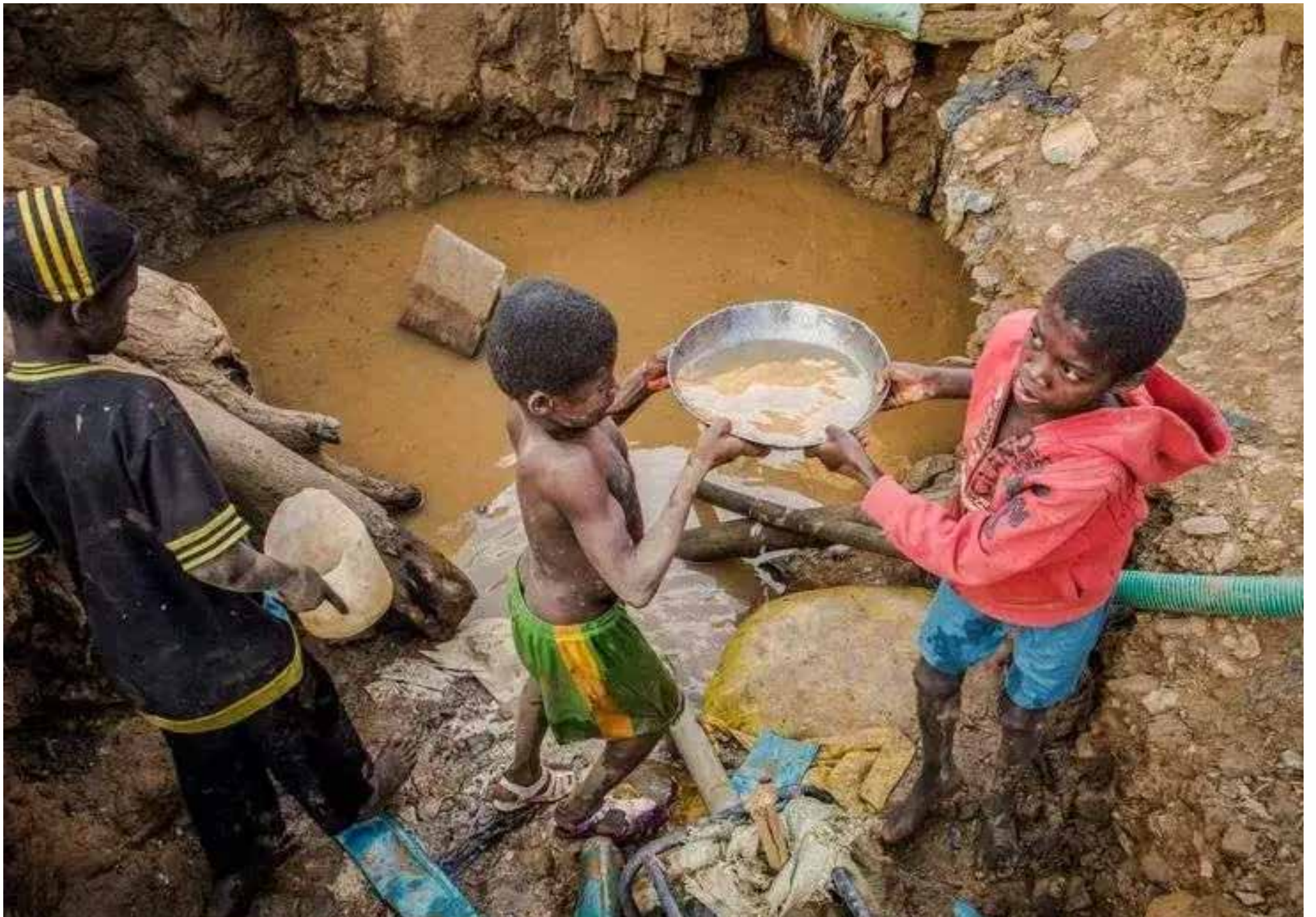
School children involving in illegal mining (Galamsey)