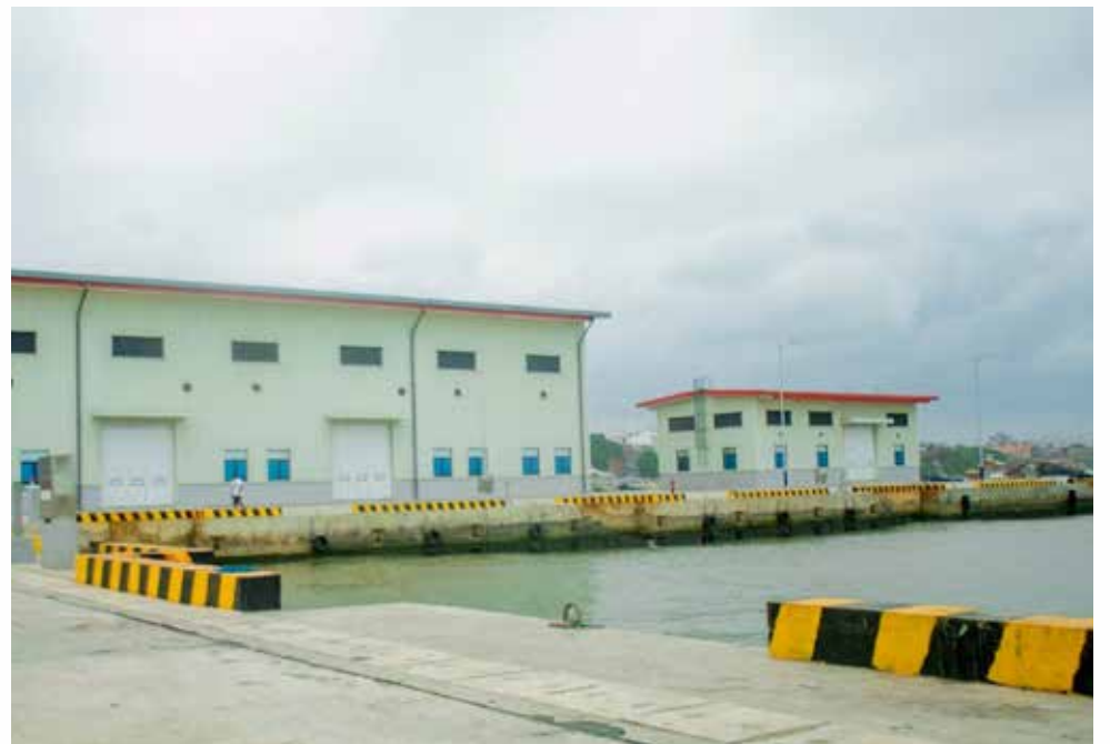
Jamestown Fishing Harbour in Accra