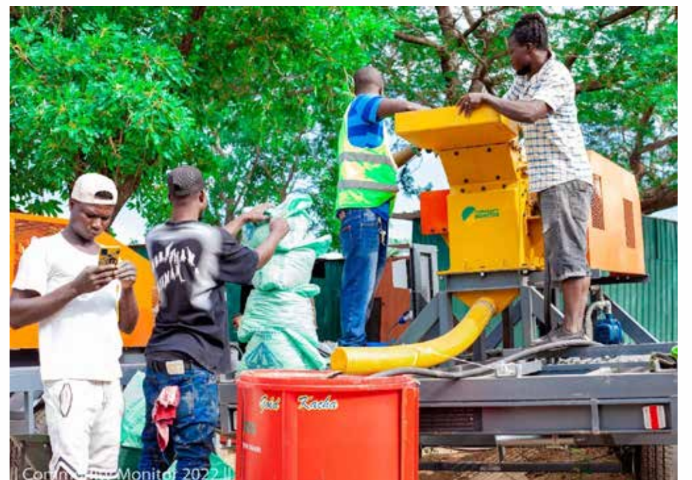
Mercury-free mining machine