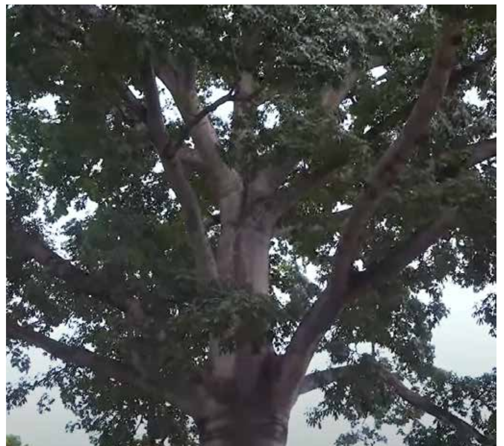
Kapok tree at UG, Legon

"With deliberate investment, the cotton industry, which has now virtually collapsed, will be revitalized to boost the economy," Mahama assured.