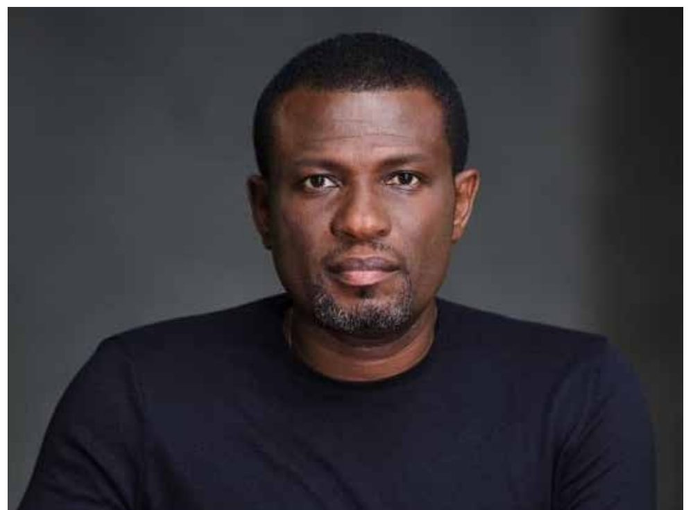
Mark Okraku Mantey, Deputy Minister of Tourism