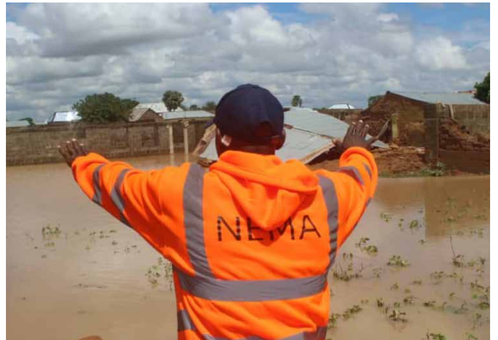
Nigeria's National Emergency Management Agency (Nema) has been conducting relief efforts