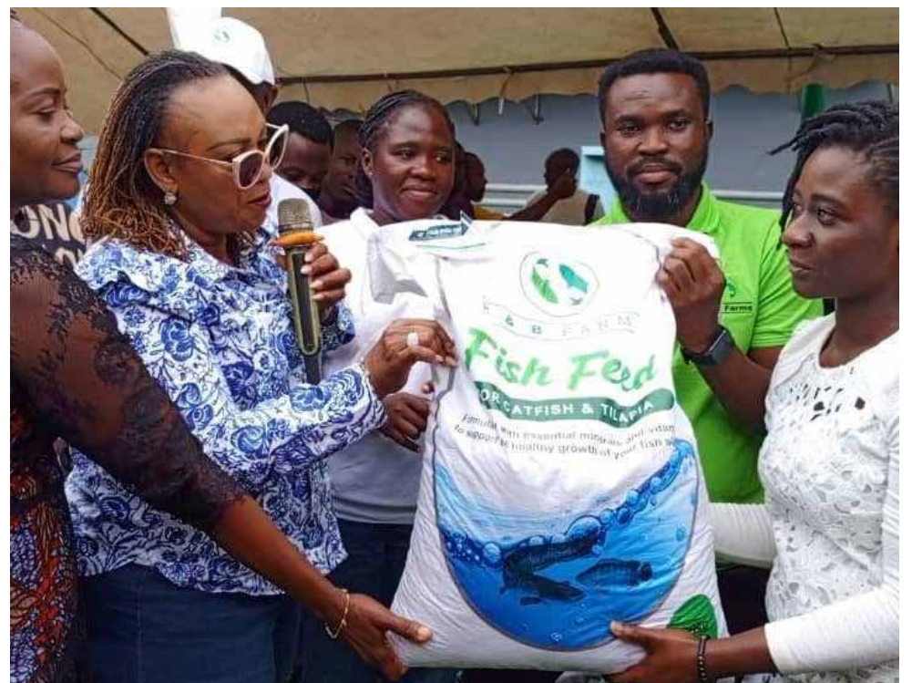
Mavis Hawa Koomson, Minister for Fisheries and Aquaculture Development

which is designed to enhance their future prospects through sustainable fish farming practices. She emphasized that encouraging fish farming is crucial for meeting the country's seafood demand.