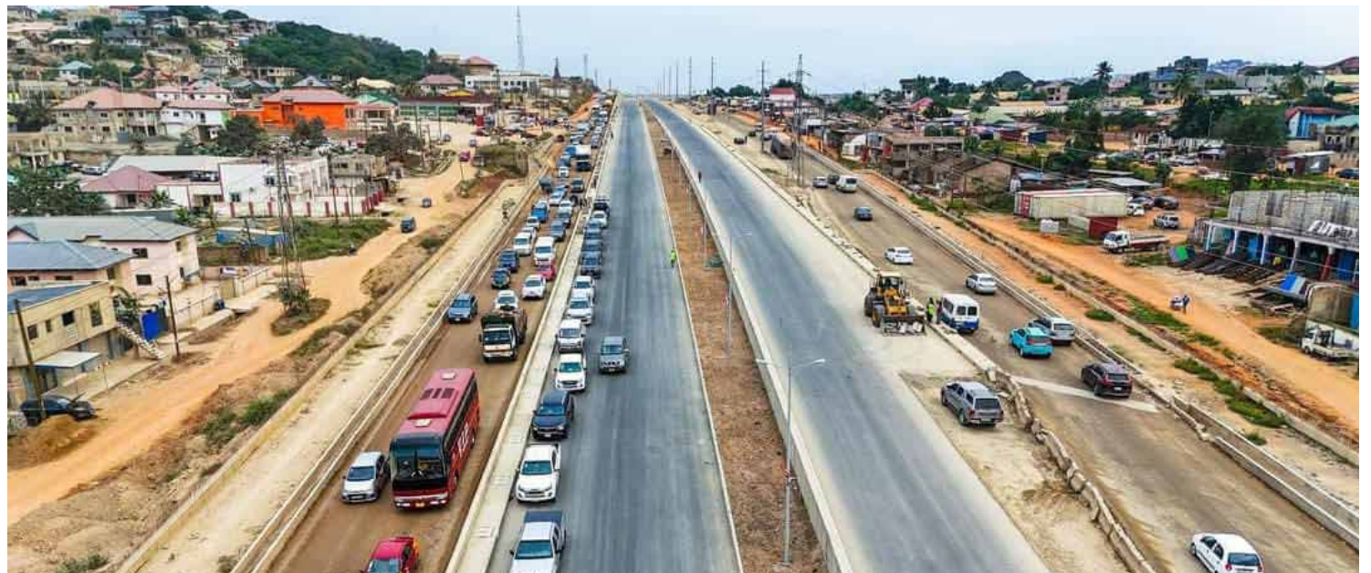
Ofankor-China Mall stretch

These infrastructural developments are set to significantly enhance the travel experience and connectivity for residents and commuters in the affected areas.