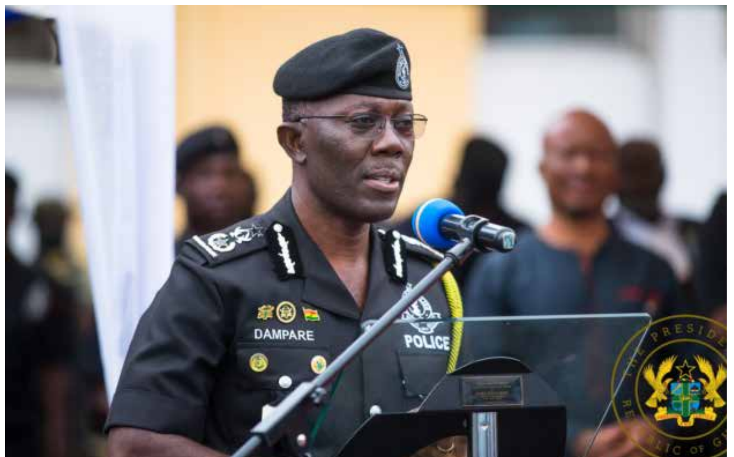
Dr. George Akuffo Dampare, IGP

The decision to centralize communication was therefore taken after extensive consultations with regional commanders and Public Relations officers across the service.