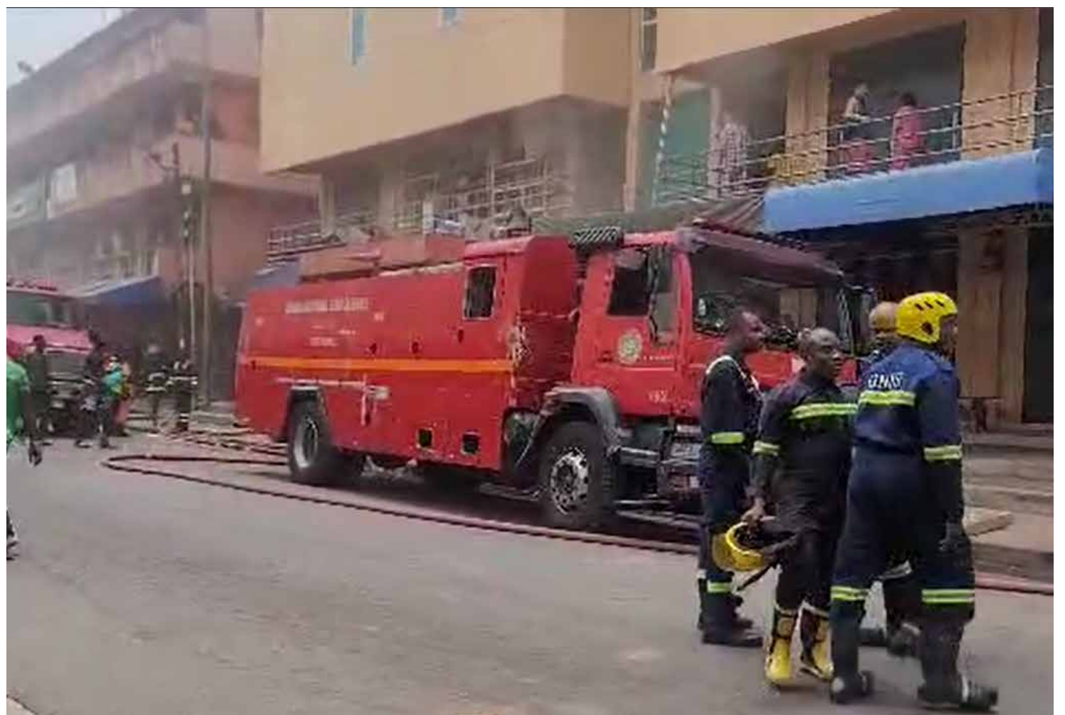
Ghana National Fire Service at the scene

It took personnel from the Ghana National Fire Service (GNFS) close to four hours to extinguish the inferno with the assistance of reinforcements.