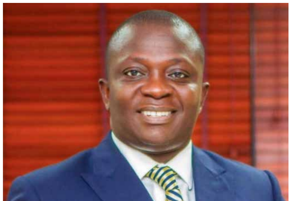
Bryan Acheampong, Minister for Food and Agriculture