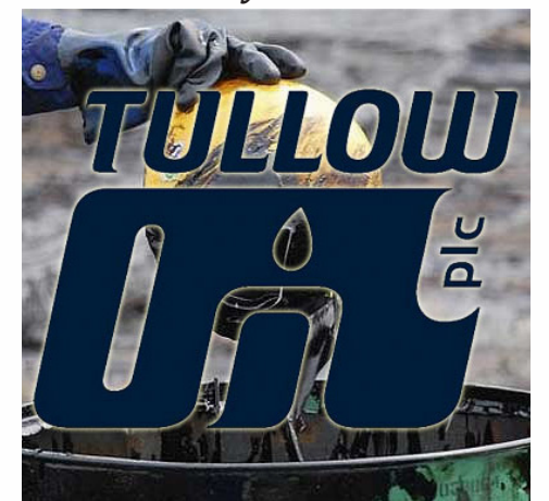
Tullow Oil Logo