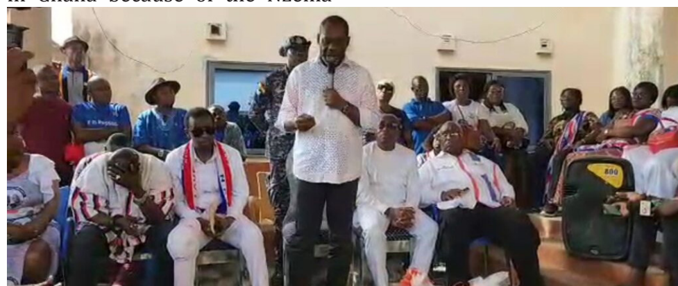
Dr. Matthew Opoku Prempeh, Energy Minister