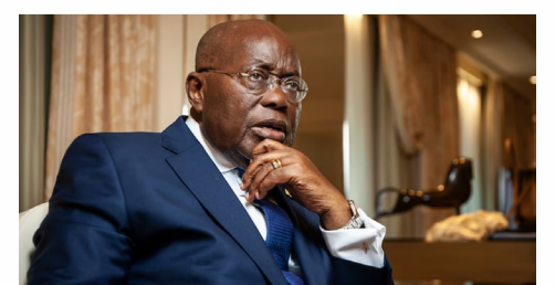
Nana Akufo-Addo, Ghana's President