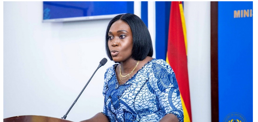
Dakoa Newman, Minister for Gender & Social Protection