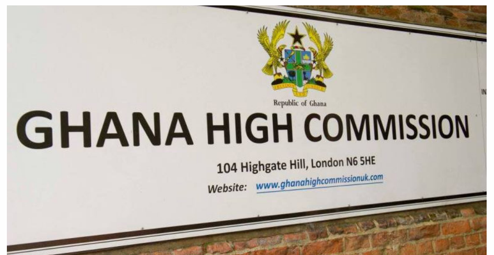
Ghana High Commission Signage