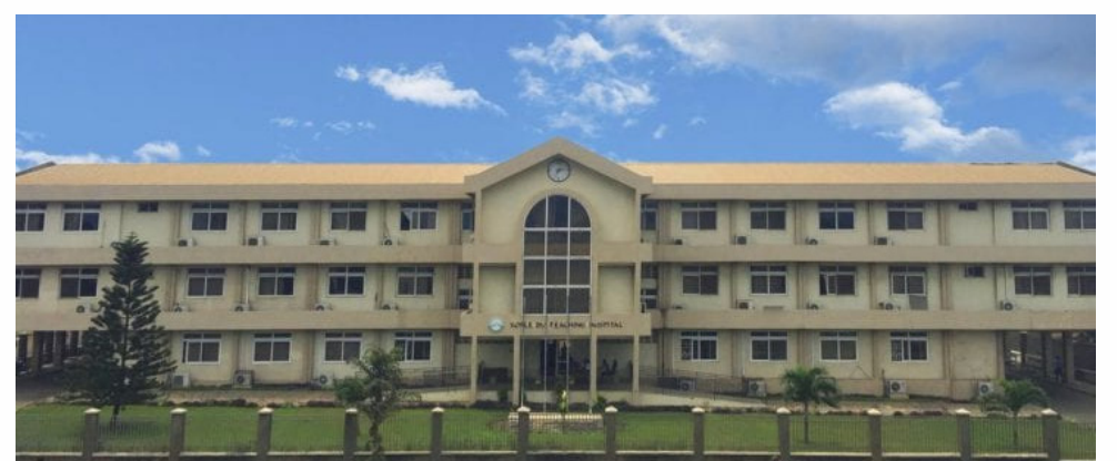
Korle-Bu dialysis centre