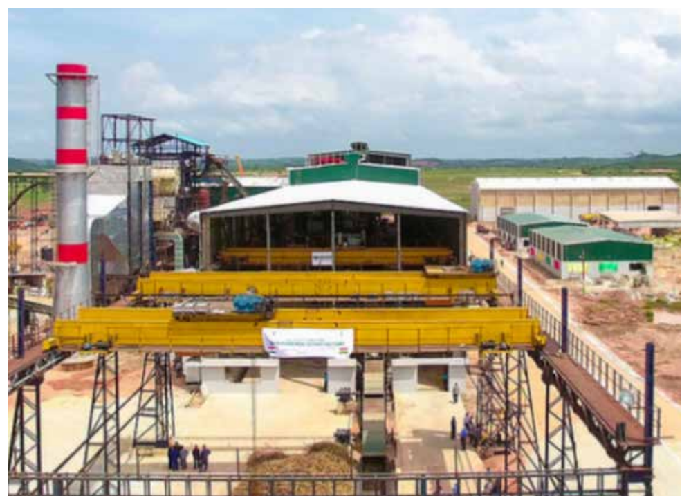
Komenda Sugar Factory