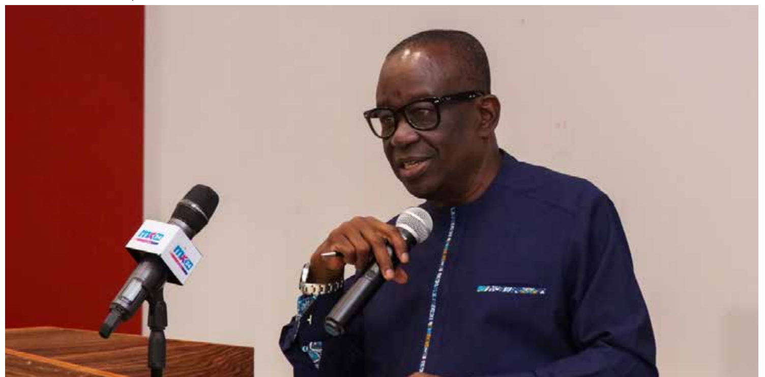
Albert Kan Dapaah, National Security Minister