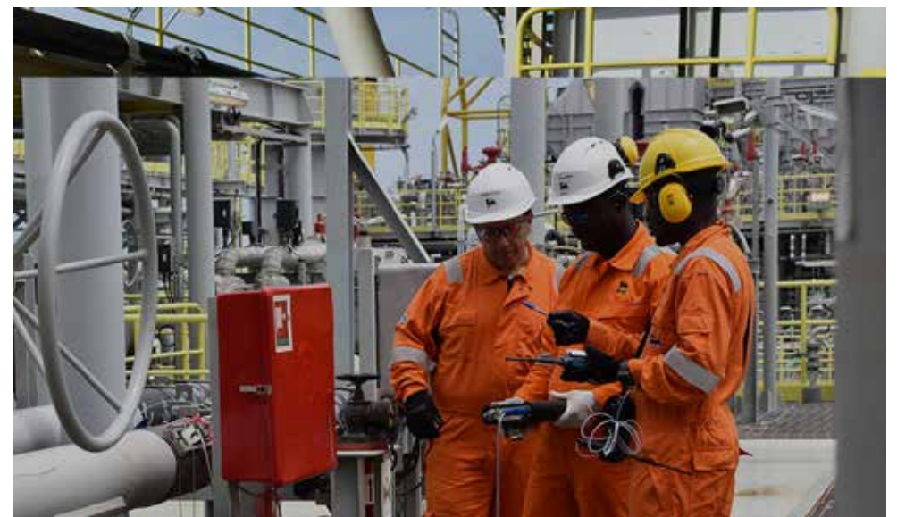
Ghana Gas Facility