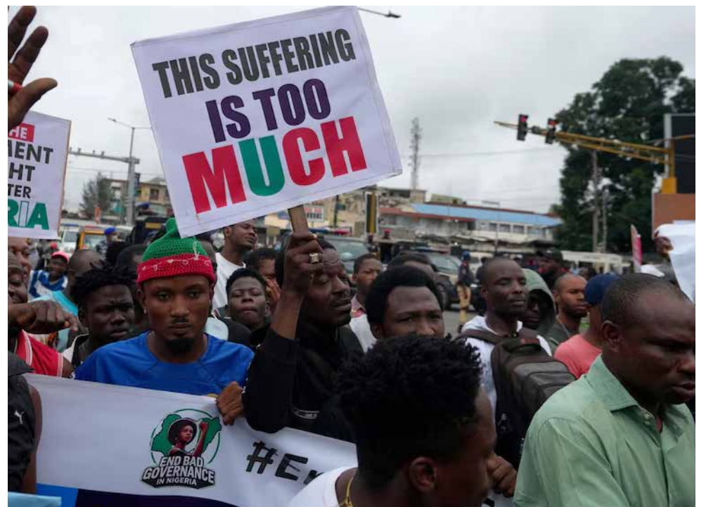
People protest against hardship on the street of Lagos, Nigeria