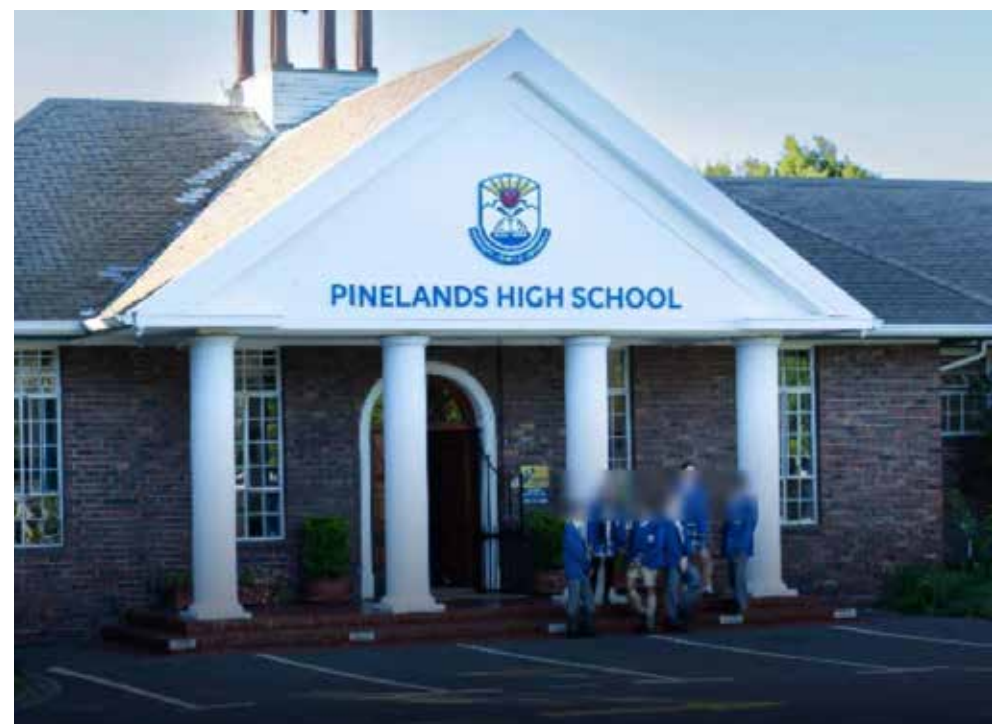
Pinelands High School