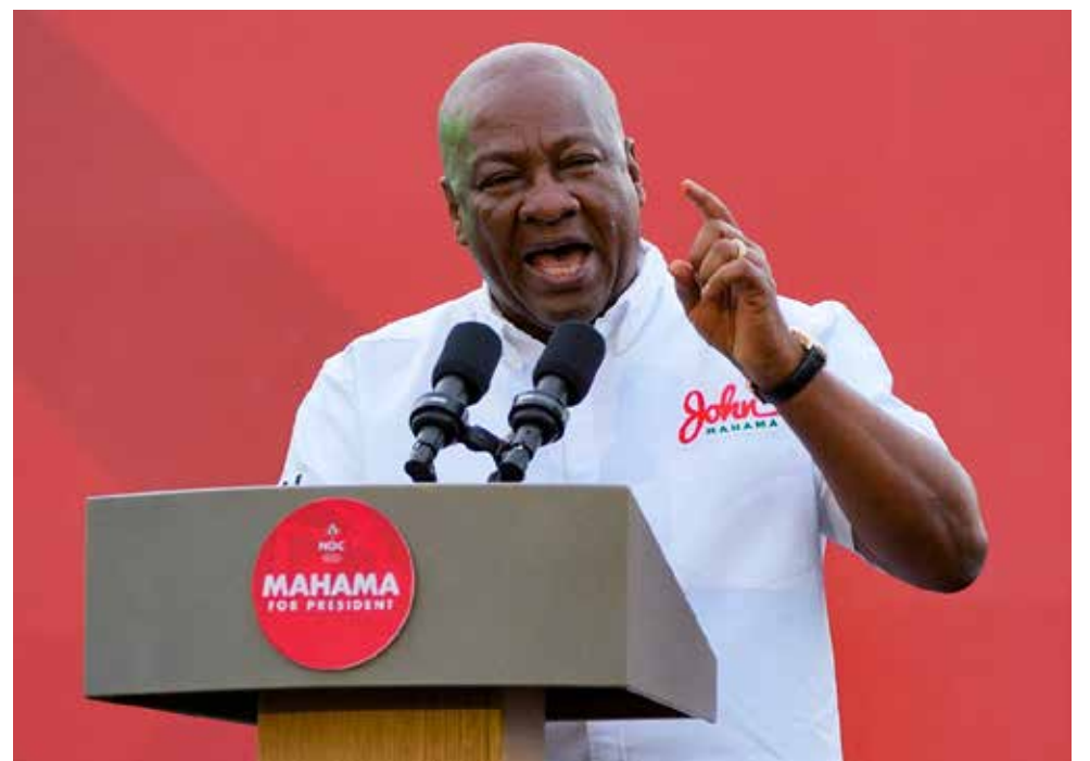
John Dramani Mahama, Flag bearer of the NDC