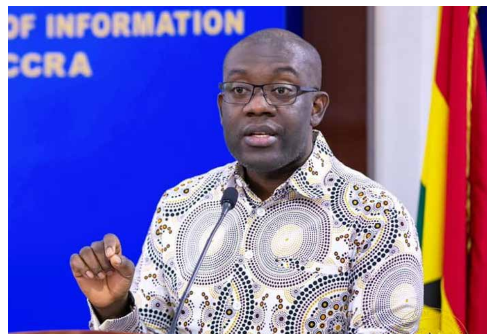
Kojo Oppong-Nkrumah, Minister for Works and Housing