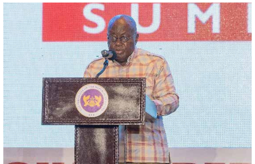
Nana Addo Dankwa Akufo-Addo, President of Ghana