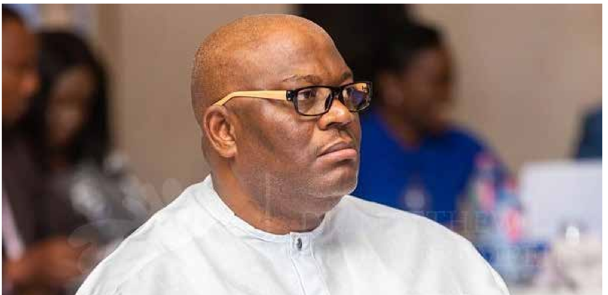
Henry Quartey, Minister of the Interior