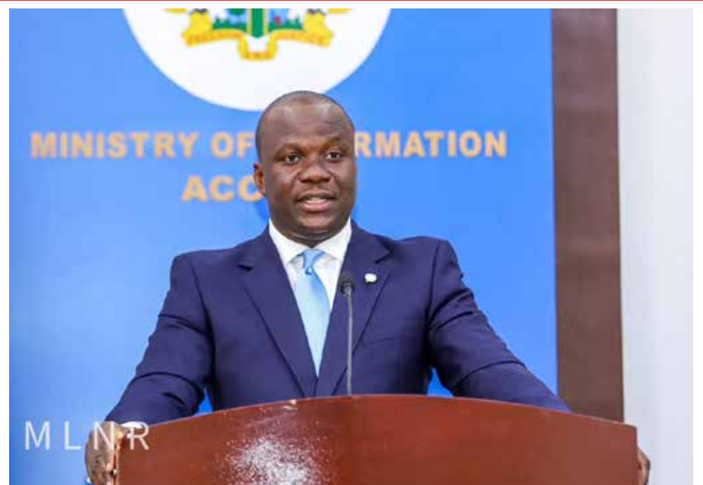
Samuel Abu Jinapor, Minister of Lands and Natural Resources

In 2022, an Executive Instrument - continued on page 3