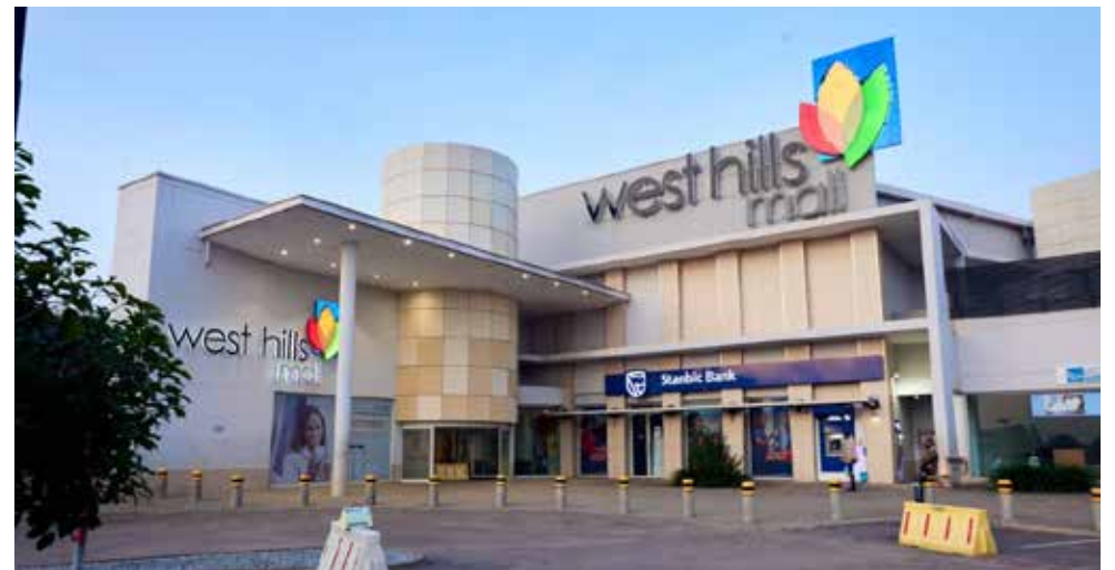
West Hills Mall

The firm's latest acquisitions are expected to enhance synergies across its diverse portfolio, enabling sustained growth and resilience amid varying market conditions.