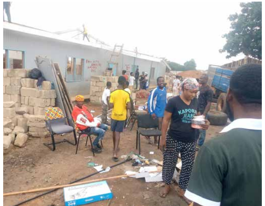
Illegal occupants of Sepe land evicted