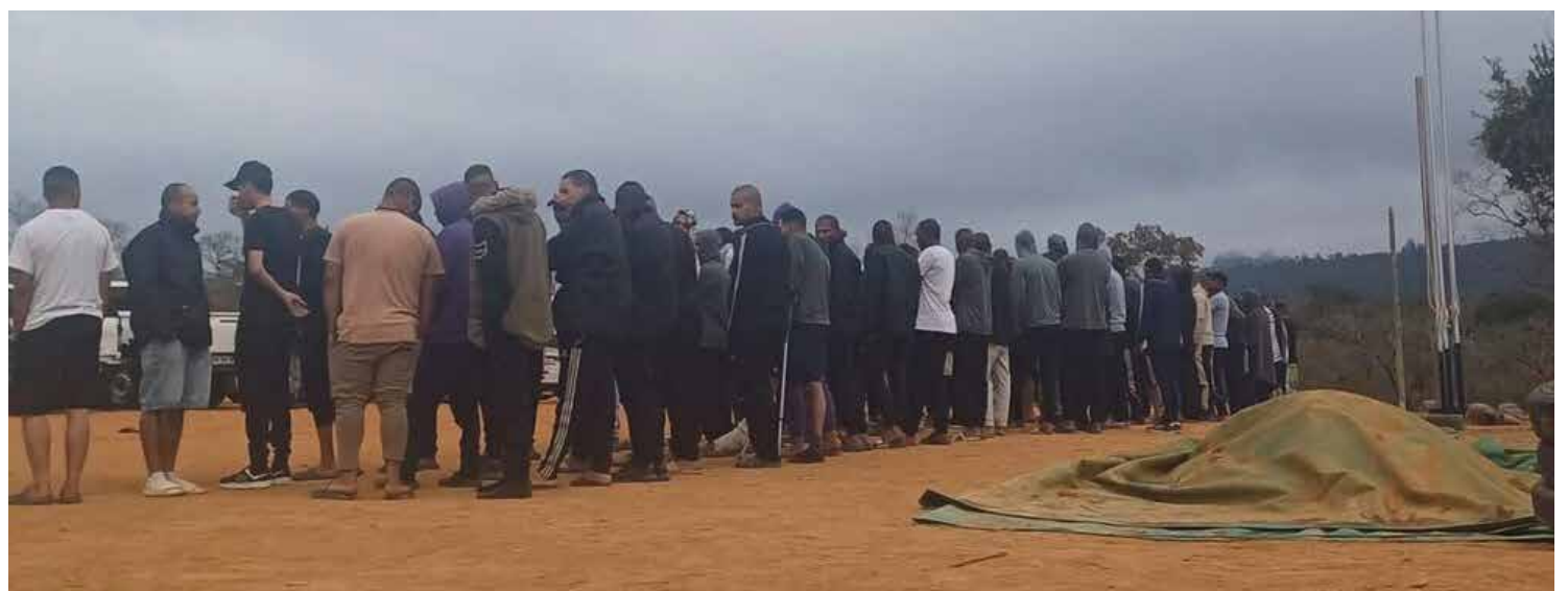
The men had allegedly said they would be training as security guards in South Africa