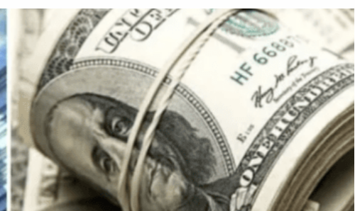
Ghana cedis & US Dollars