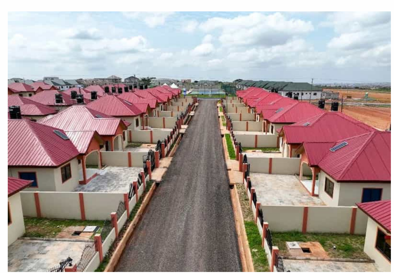
Real estate building