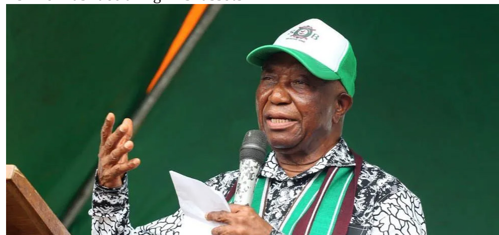
Joseph Boakai, Liberia's President