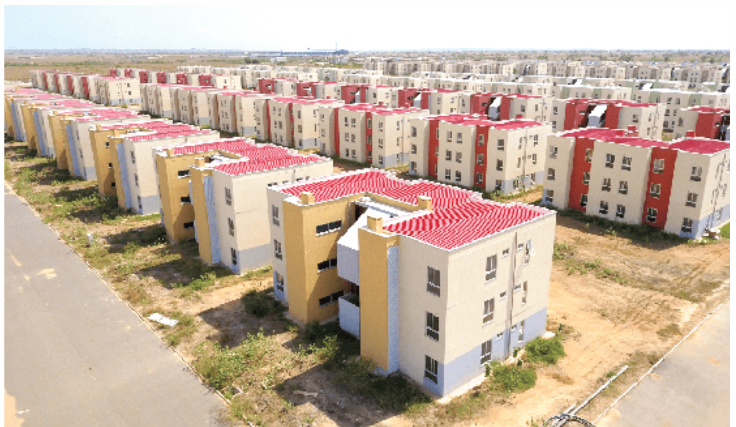
Saglemi Housing Project