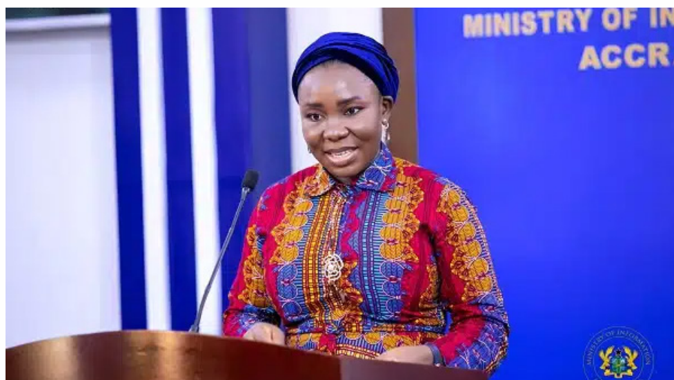
Fatimatu Abubakar, Information Minister