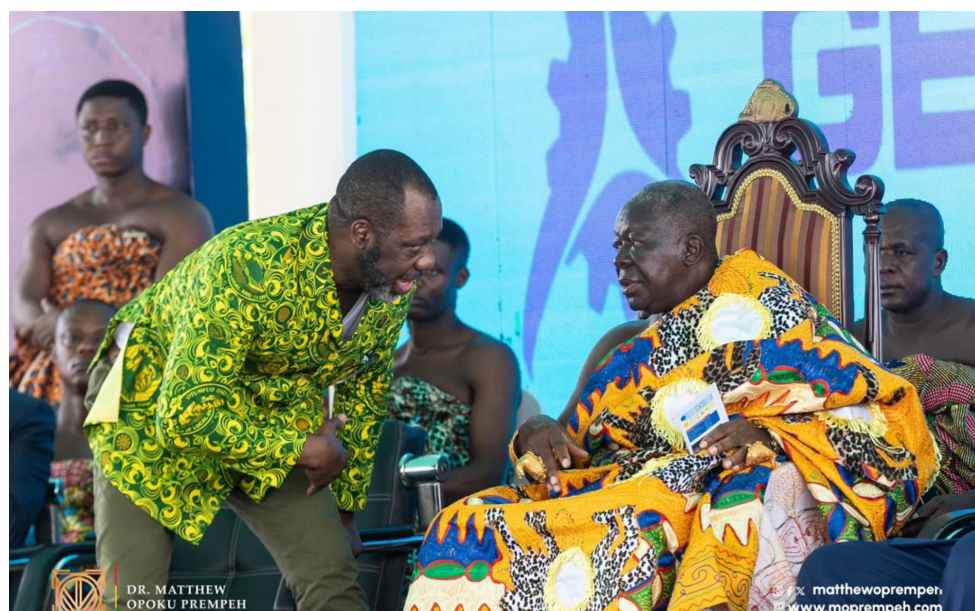
Dr. Matthew Opoku Prempeh, Energy Minister on the left, Otumfuo Osei Tutu II, Asantehene on the right