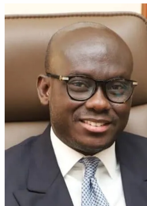
Hon. Godfred Yeboah Dame, Attorney General & Minister for Justice