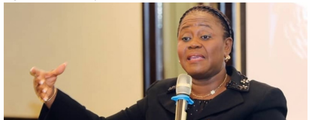
Chief Justice Gertrude Torkornoo