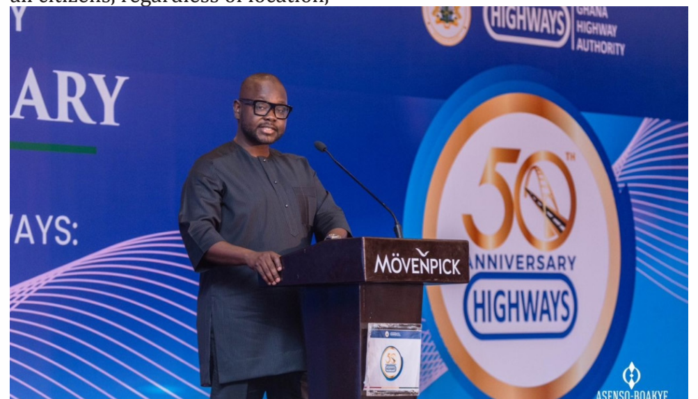
Francis Asenso-Boakye, Minister of Roads & Highways