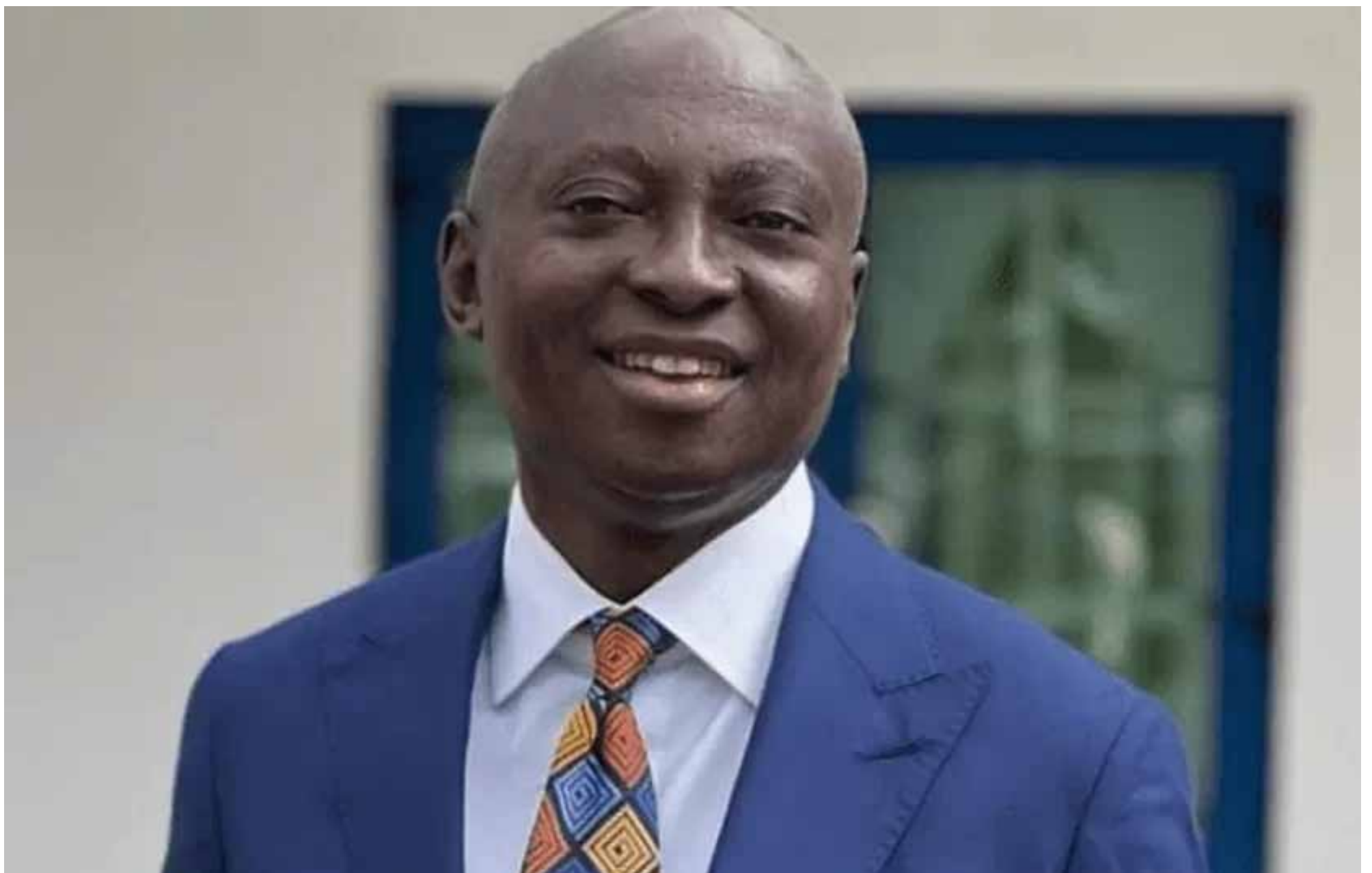
Kobina Tahir Hammond, Minister for Trade and Industry