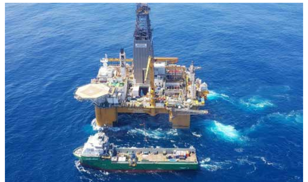
Police use tear gas to disperse protesters during a demonstration