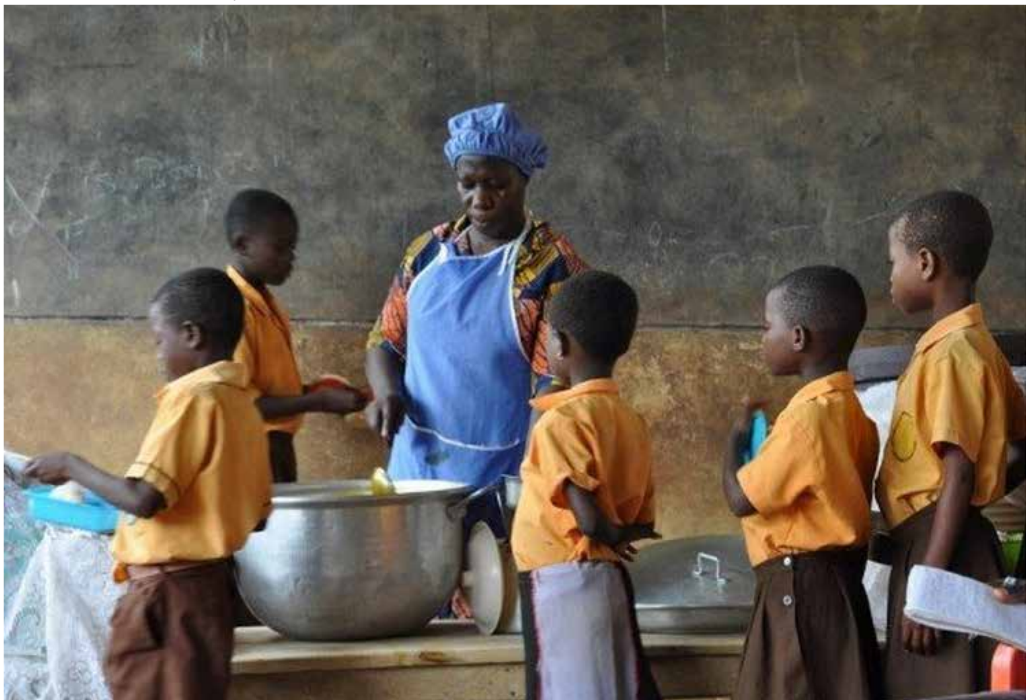
School feeding program