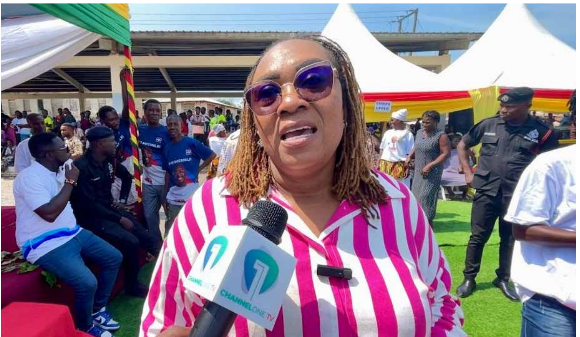
Hawa Koomson, Minister of Fisheries and Aquaculture Development