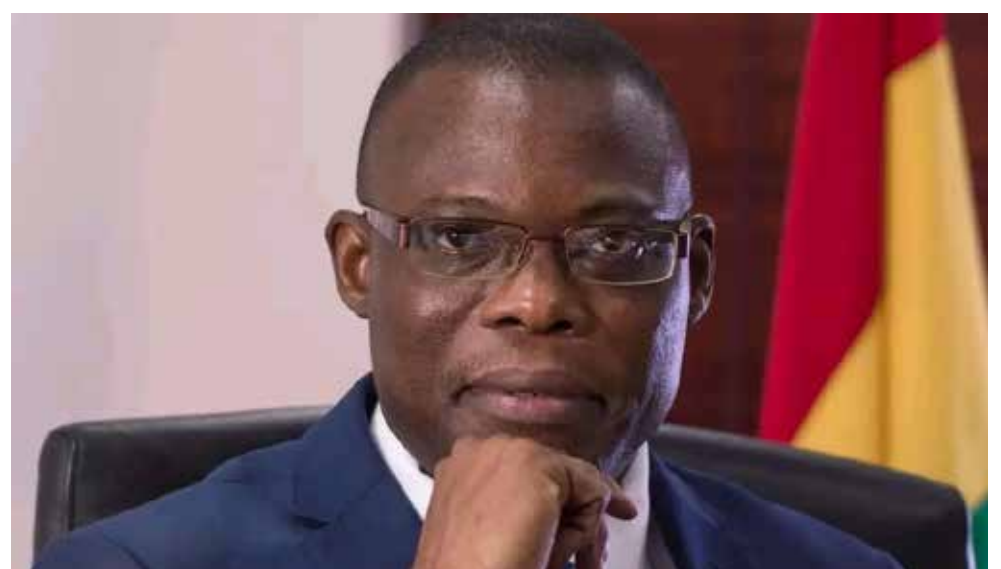
Fiiifi Fiavi Kwetey, General-Secretary of the NDC