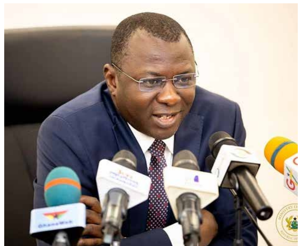
Dr Mohammed Amin Adam, Finance Minister