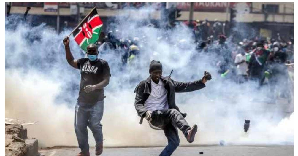
Police use tear gas to disperse protesters during a demonstration