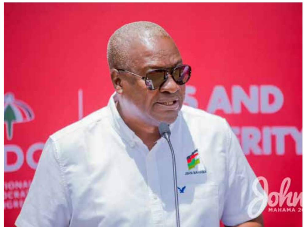
John Dramani Mahama, NDC Flagbearer