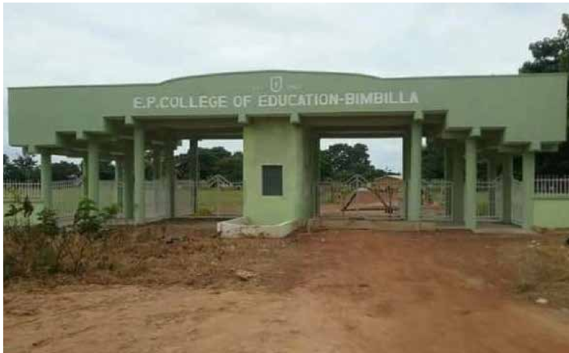
Bimbilla College of Education