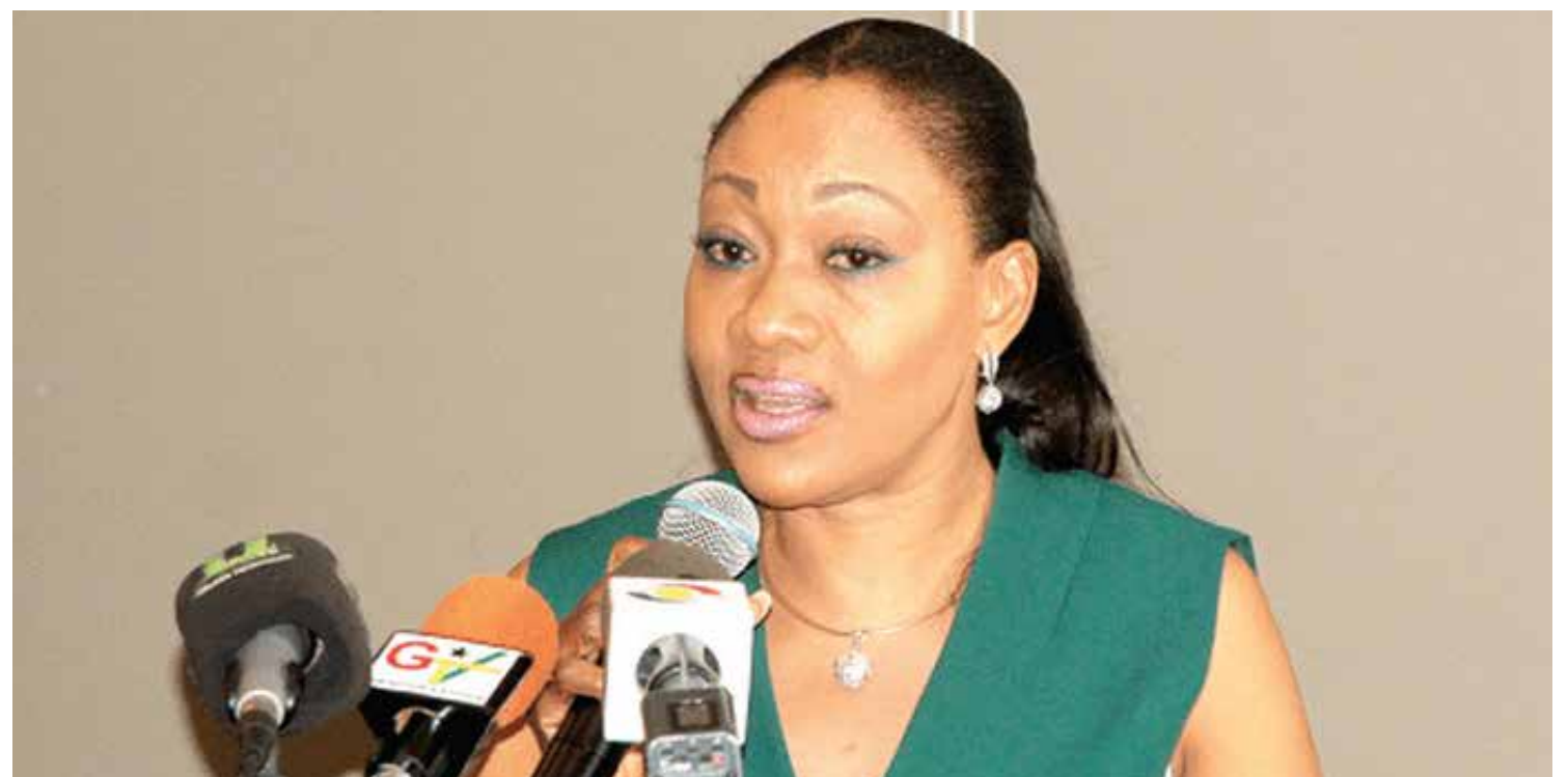
Jean Adukwei Mensa, Chairperson of the Electoral Commission (EC)