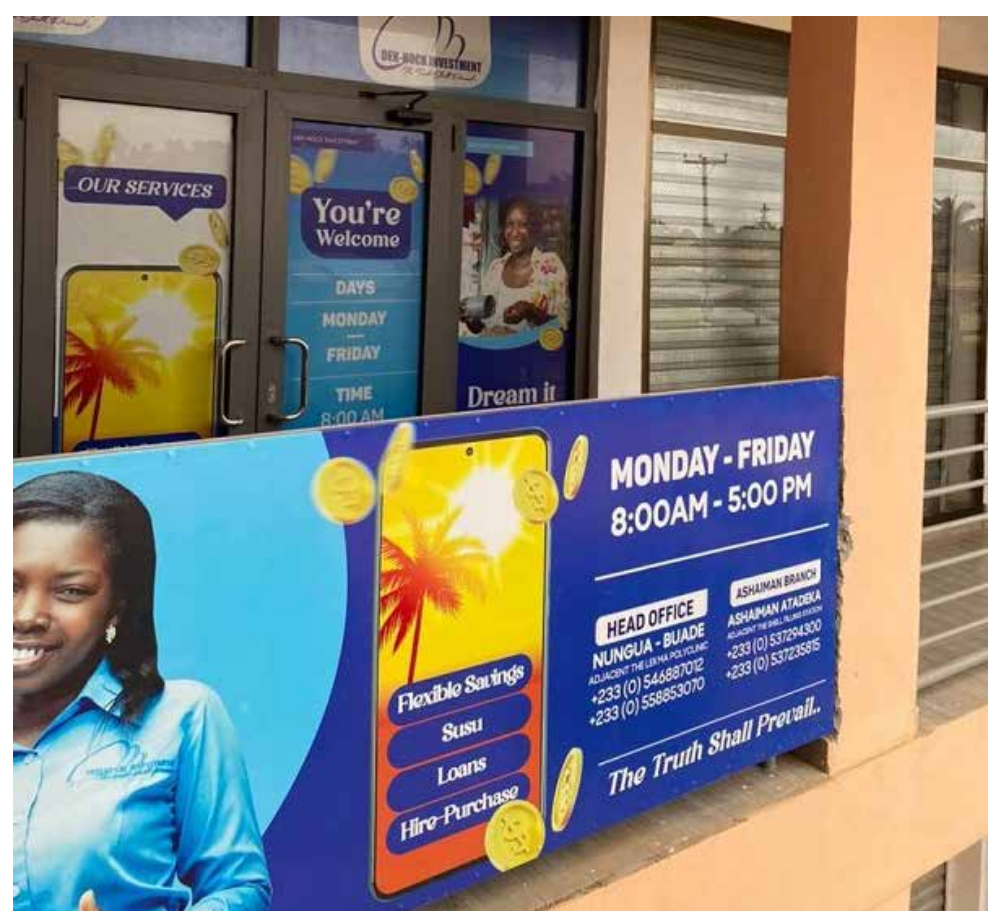
Dek-Nock Investments office