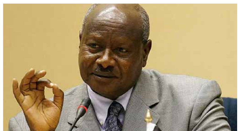
Yoweri Museveni, Uganda's President