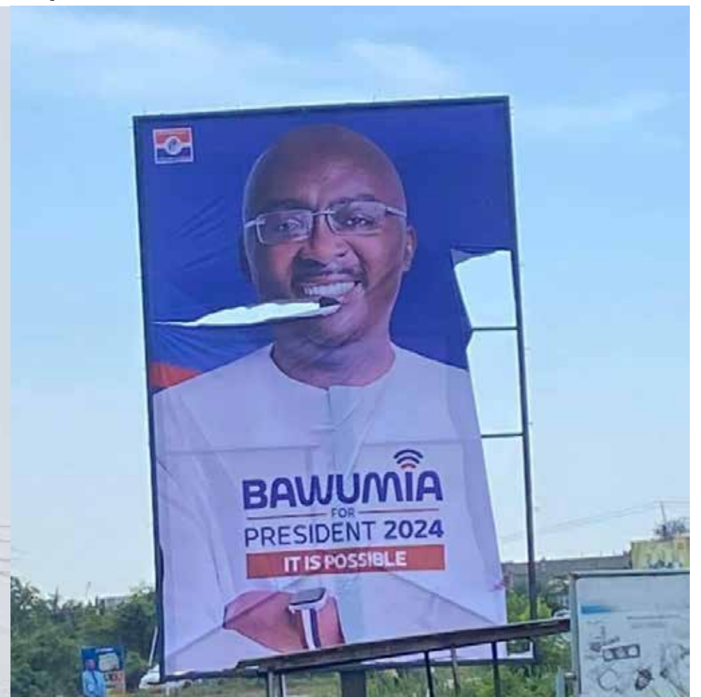
NDC and NPP billboards