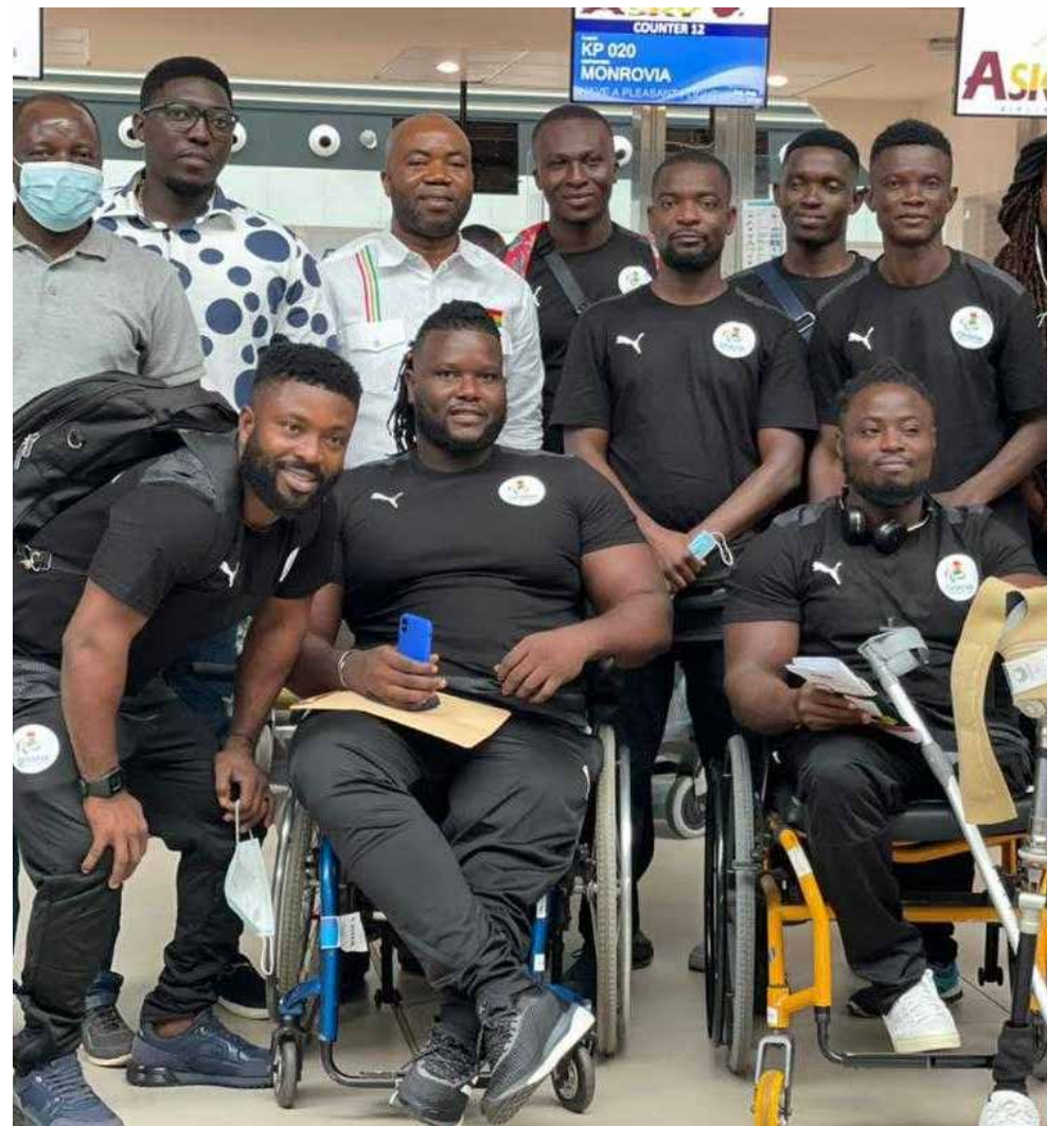
Ghana Paralympic Team