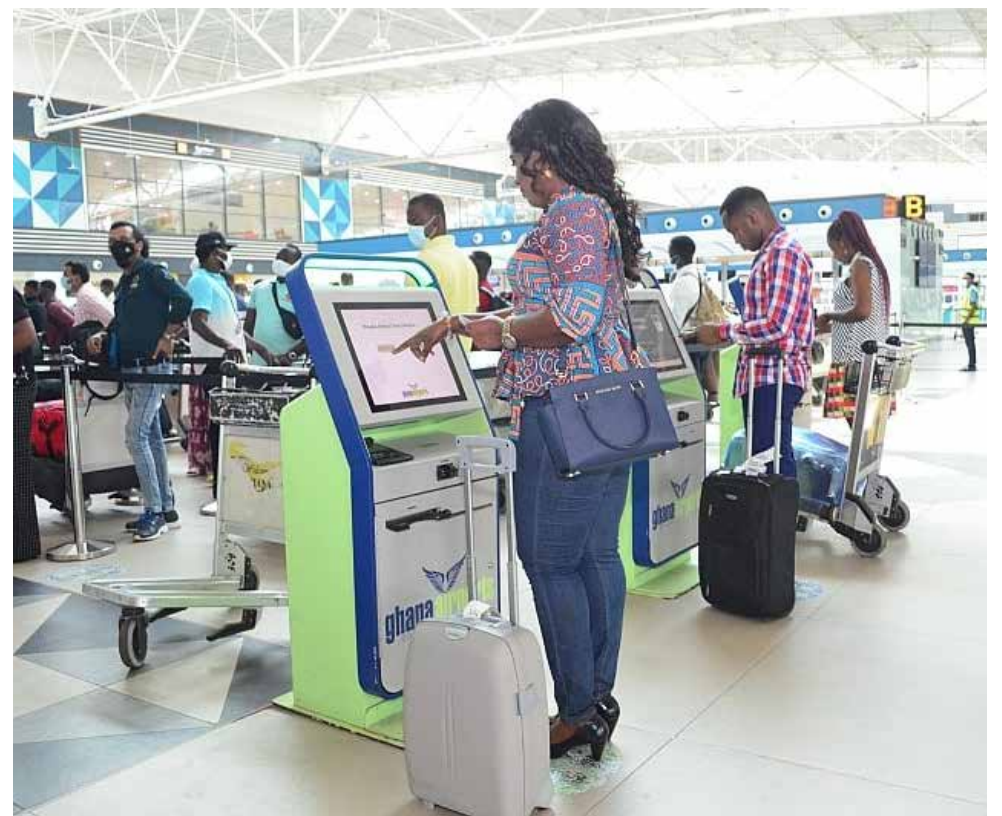
Kotoka International Airport (KIA)