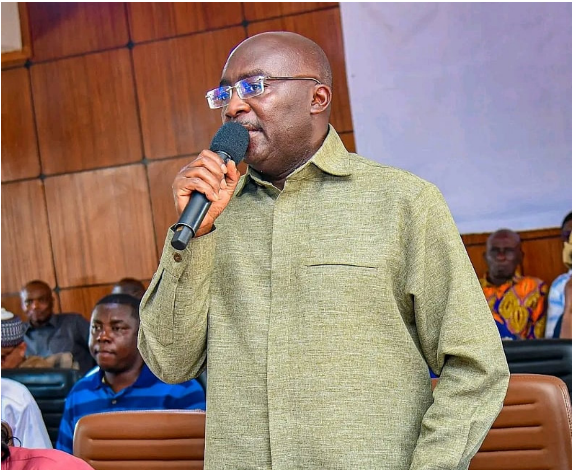
Dr Mahamudu Bawumia, NPP Flagbearer