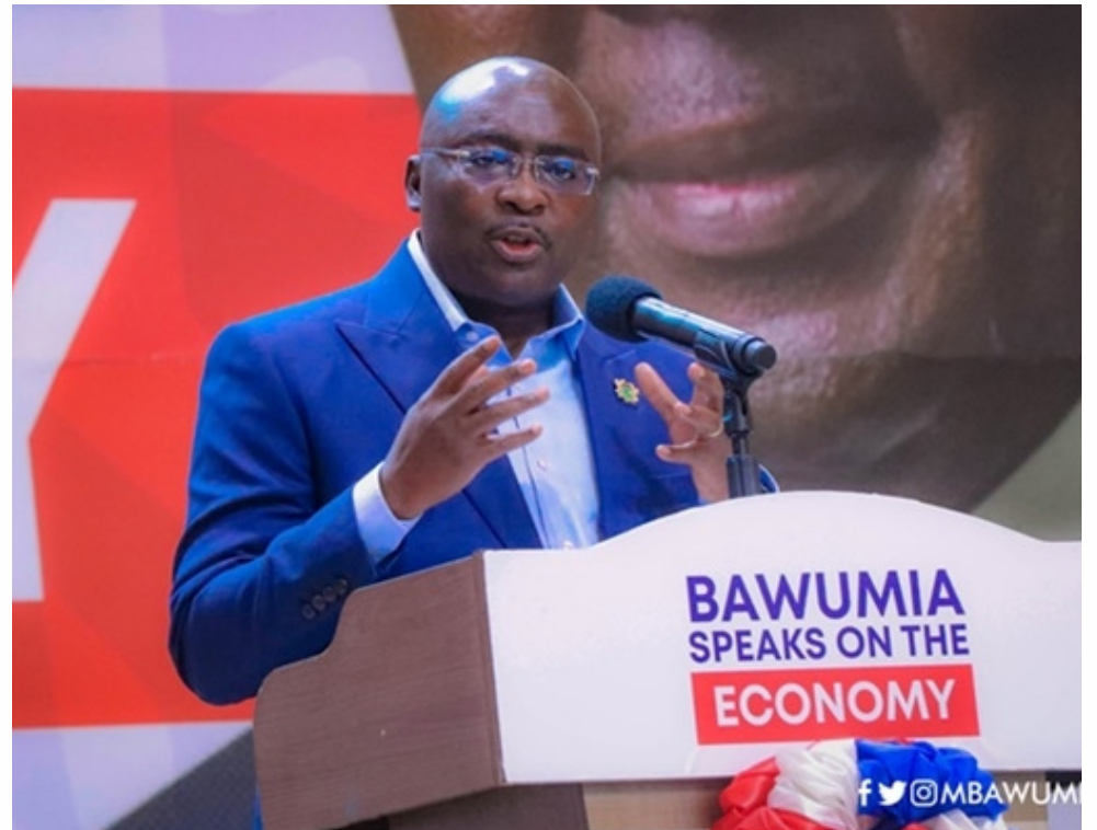
Dr. Mahamudu Bawumia, NPP Flagbearer