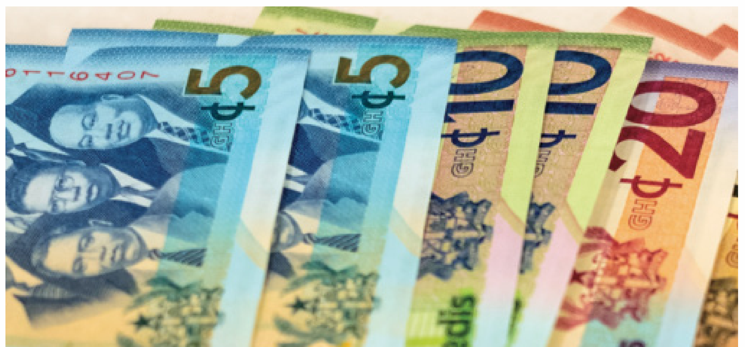
Ghana Cedi Notes