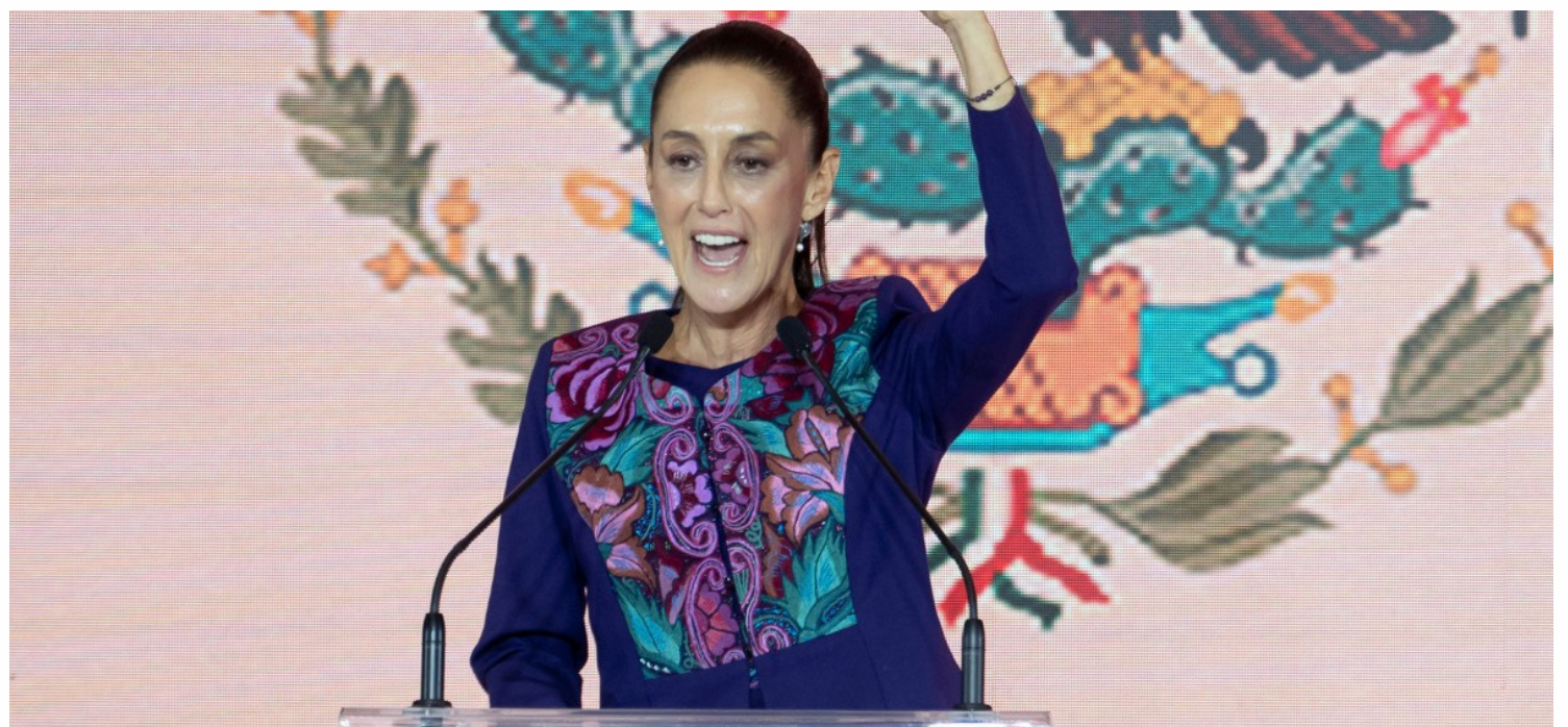
Claudia Sheinbaum, newly elected President, Mexico