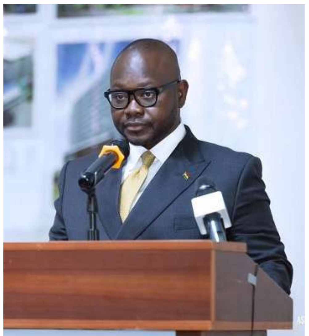
Francis Asenso-Boakye, Minister of Roads and Highways