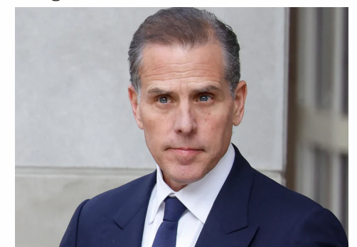
Hunter Biden, President Joe Biden's Son