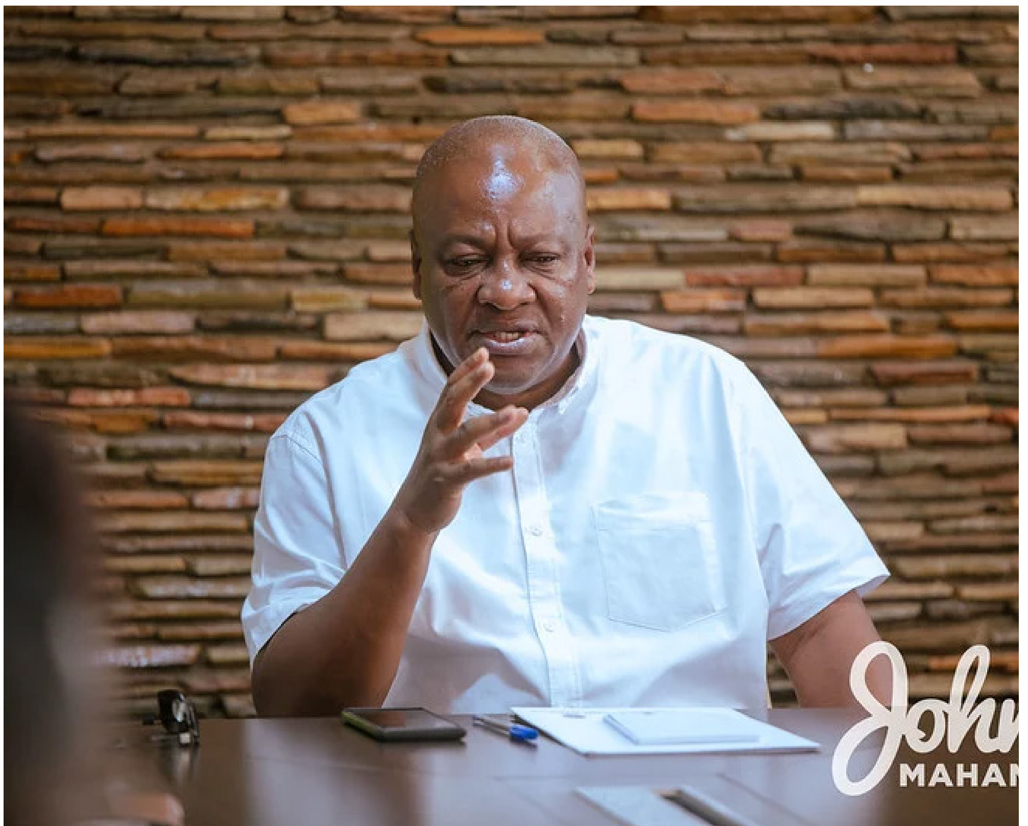
John Dramani Mahama, Flagbearer, NDC