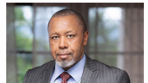
Saulos Chilima, Malawi Vice President