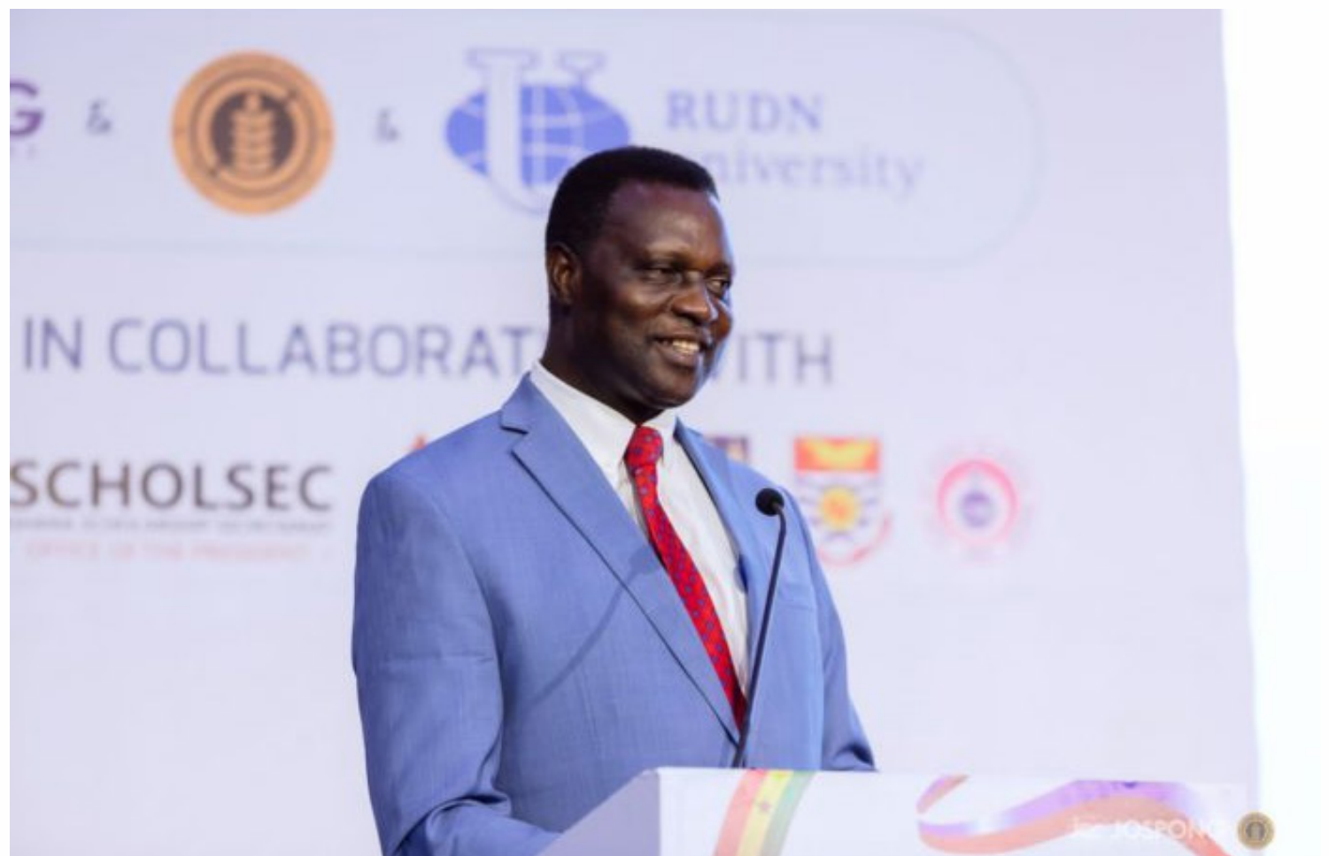
Yaw Osei Adutwum, Education Minister