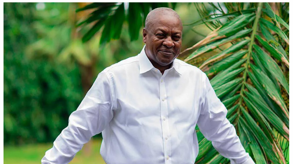
John Dramani Mahama, Flagbearer, NDC