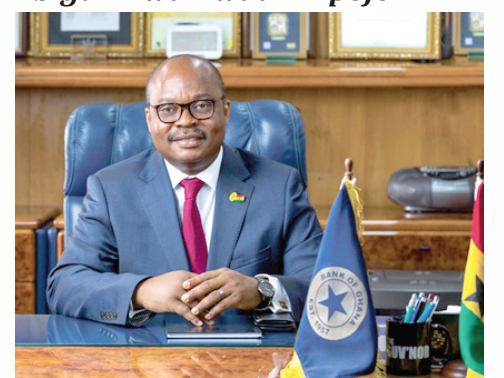
Prof. Ernest Addison, Bank Of Ghana Governor