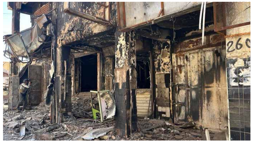
Sudan's most iconic street market destroyed