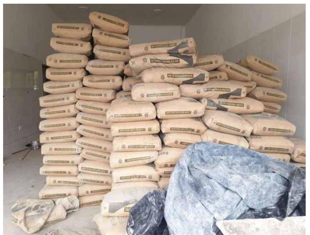
Bags of cement