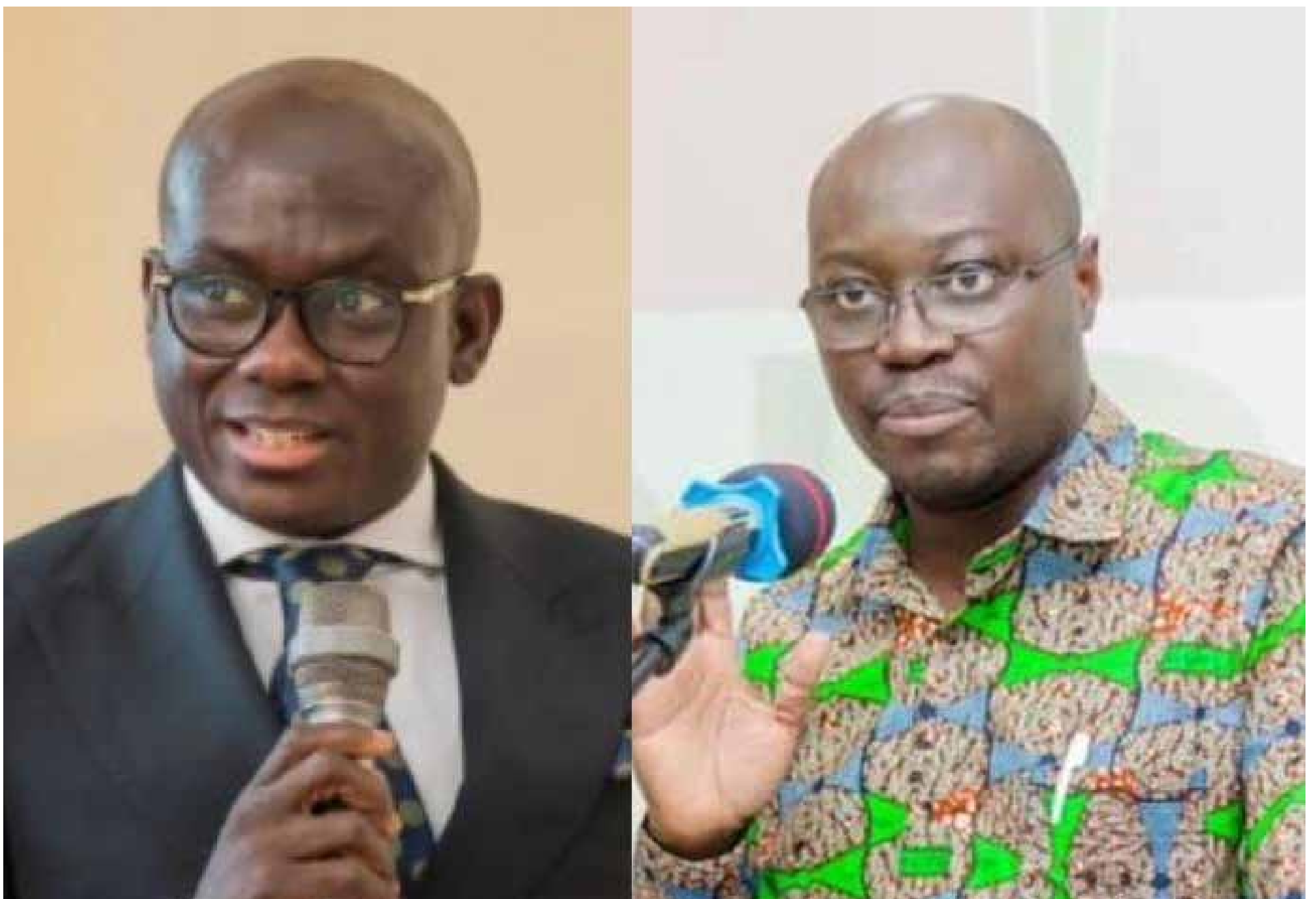
Godfred Yeboah Dame, Attorney-General (L) and Minority Leader Cassiel Ato Forson (R)