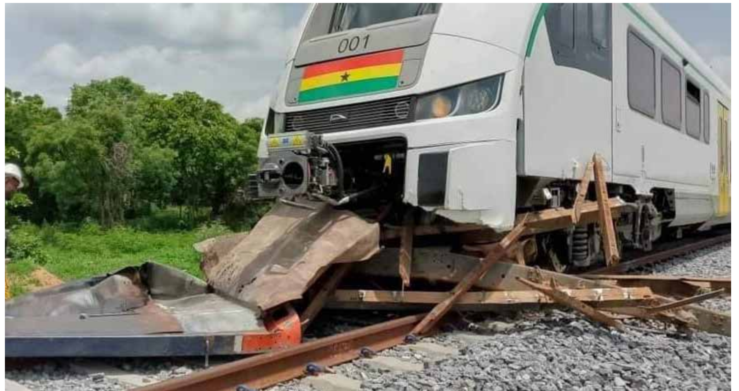
Tema-Mpakadan train accident