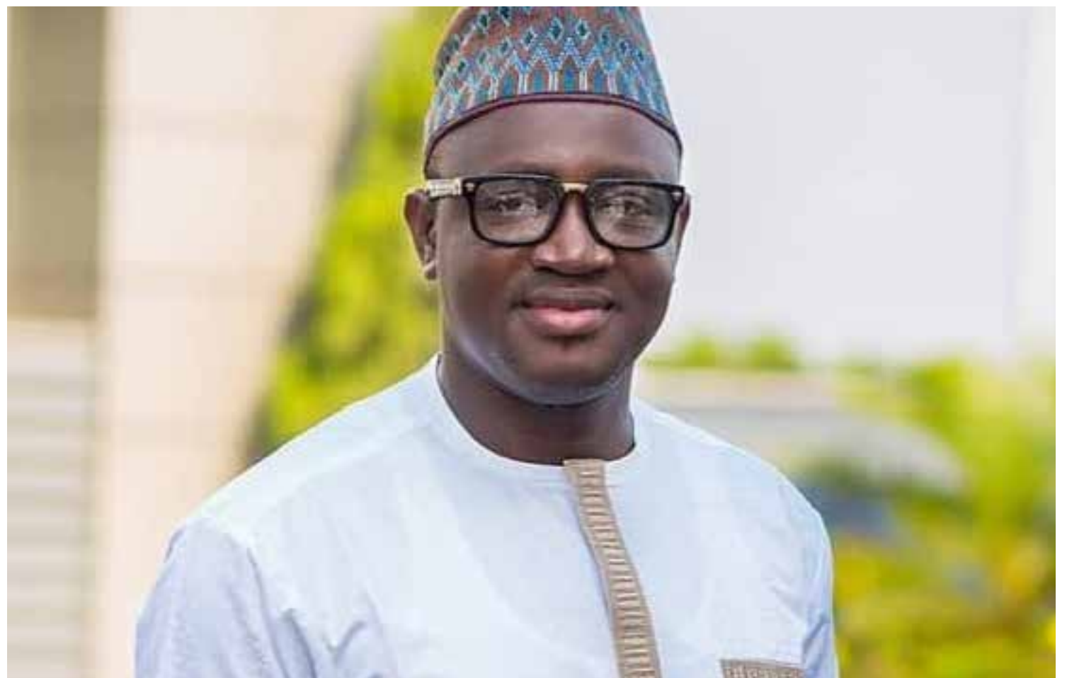
Alhassan Suhuyini, Deputy Ranking Member of Parliament's Lands and Forestry Committee