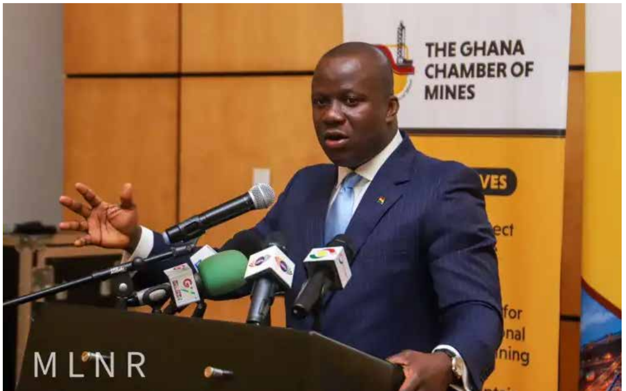
Samuel Abu Jinapor, Minister of Lands and Natural Resources