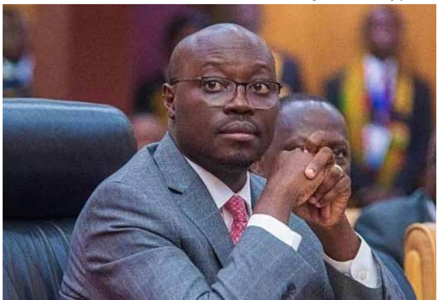
Dr Cassiel Ato Forson, Minority Leader in Parliament