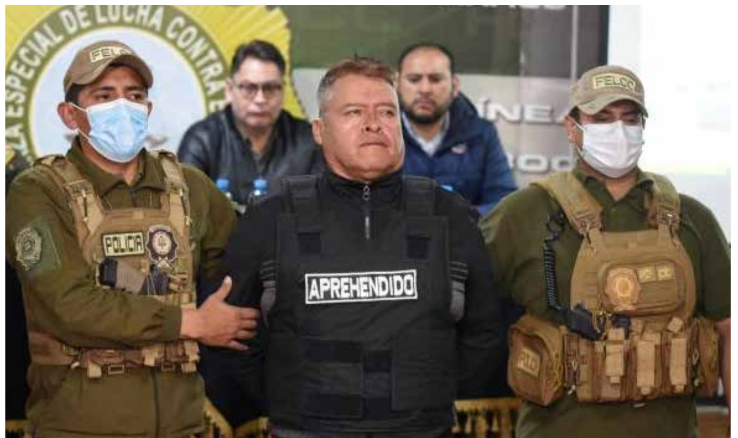
Gen Juan José Zúñiga after his arrest