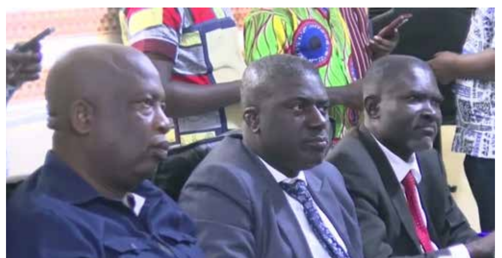
Peace council meets EC