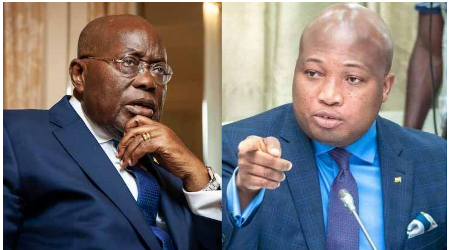
President Akufo-Addo (L) and Samuel Okudzeto Ablakwa (R)