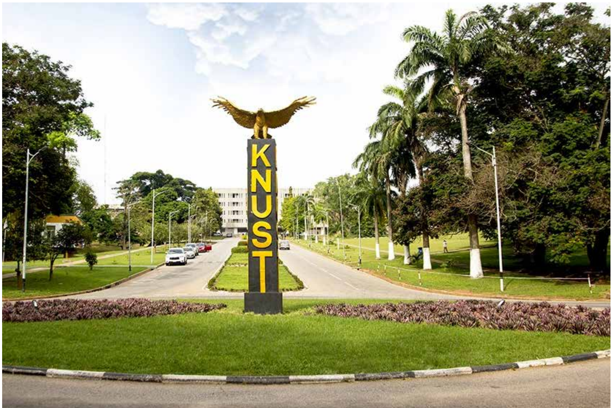
Kwame Nkrumah University of Science and Technology (KNUST)