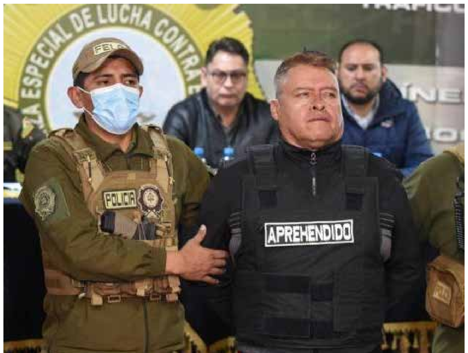
Gen Juan José Zúñiga after his arrest