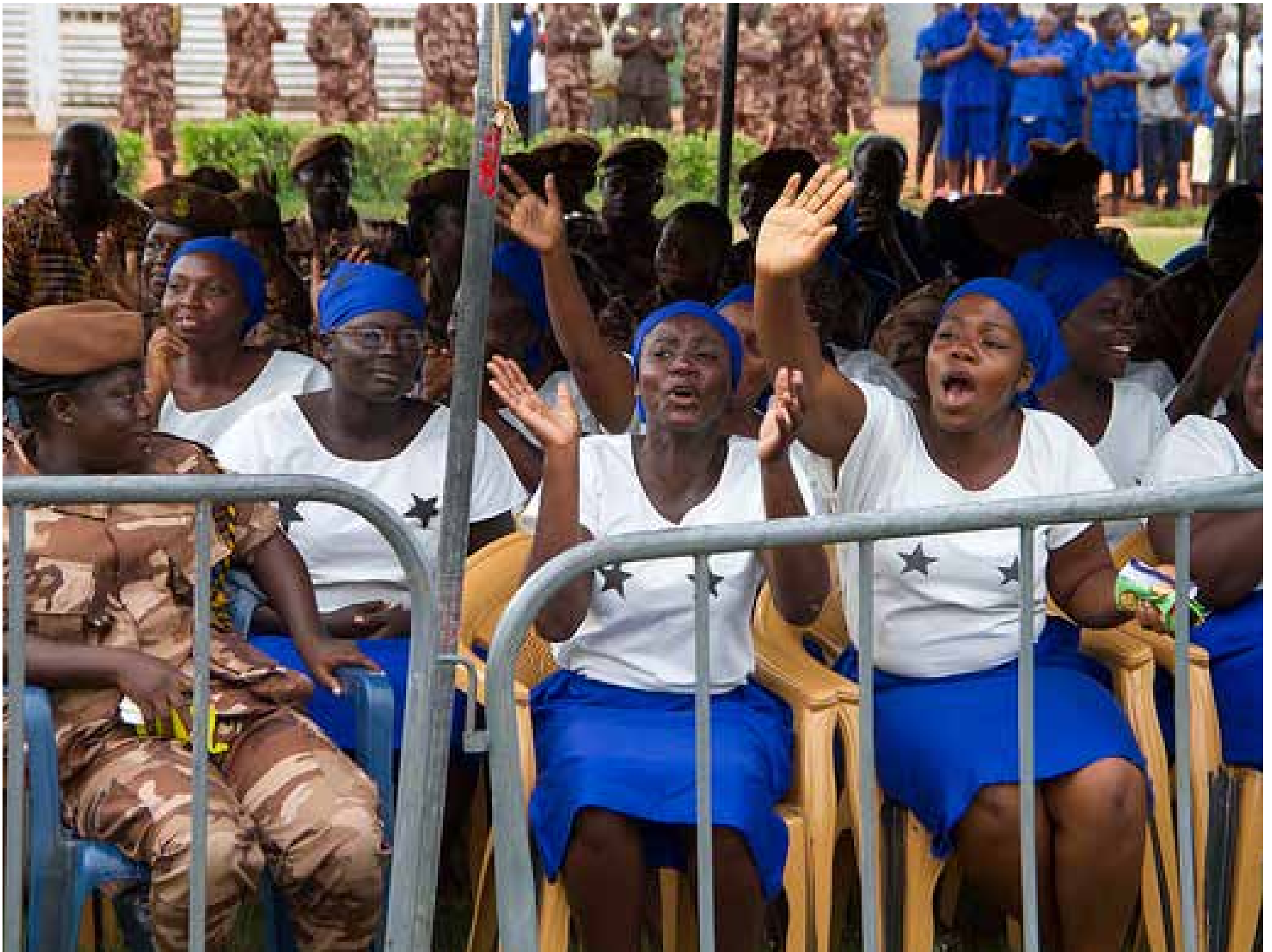
Ghana prison inmates