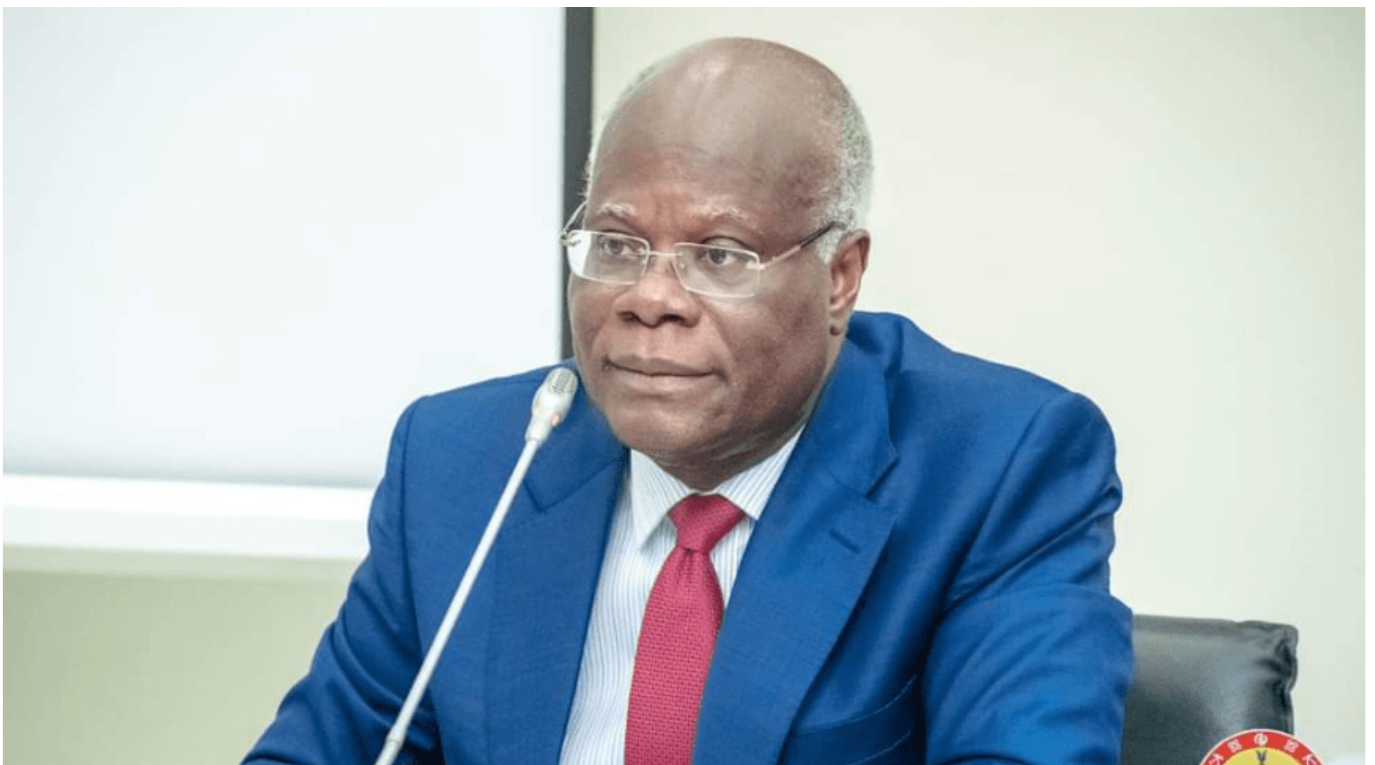
Kobina Tahir Hammond, Minister for Trade and Industry