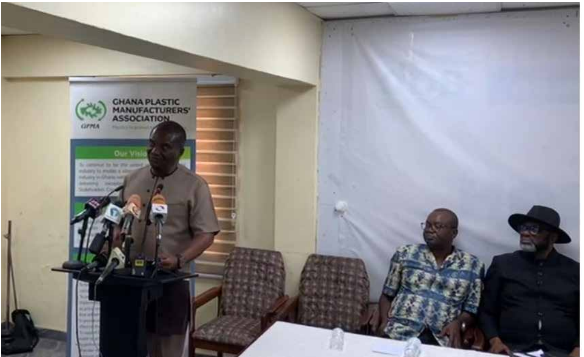
Ghana Plastic Manufacturers Association (GPMA)

Source: The Independent Ghana / Andy Ogbarmey-Tettey