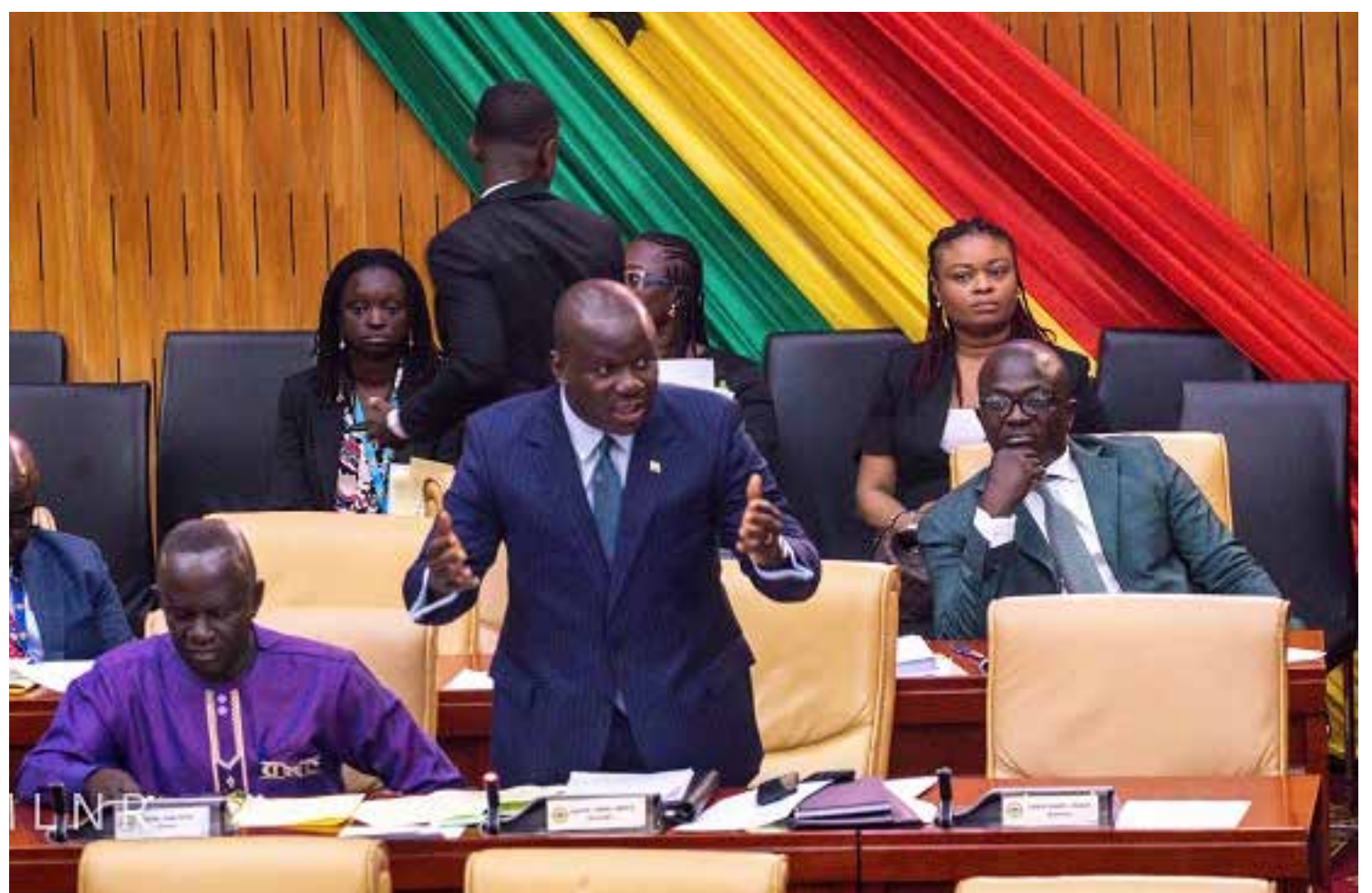
Dr. Mohammed Amin Adam, Minister for Finance