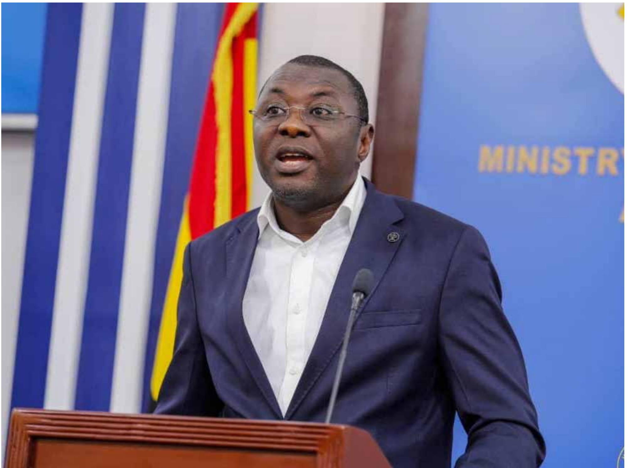
Dr. Mohammed Amin Adam, Finance Minister