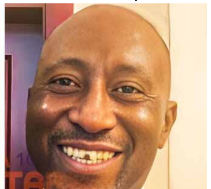
Godfred Yeboah Dame (L) and Richard Kakpa (R)