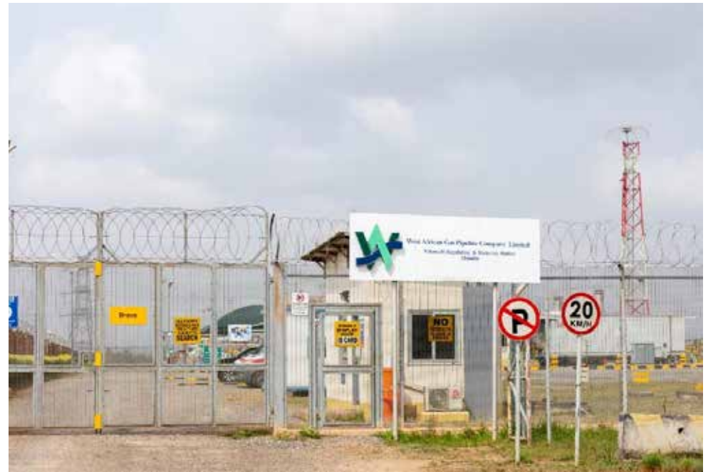
WAPCo gas station