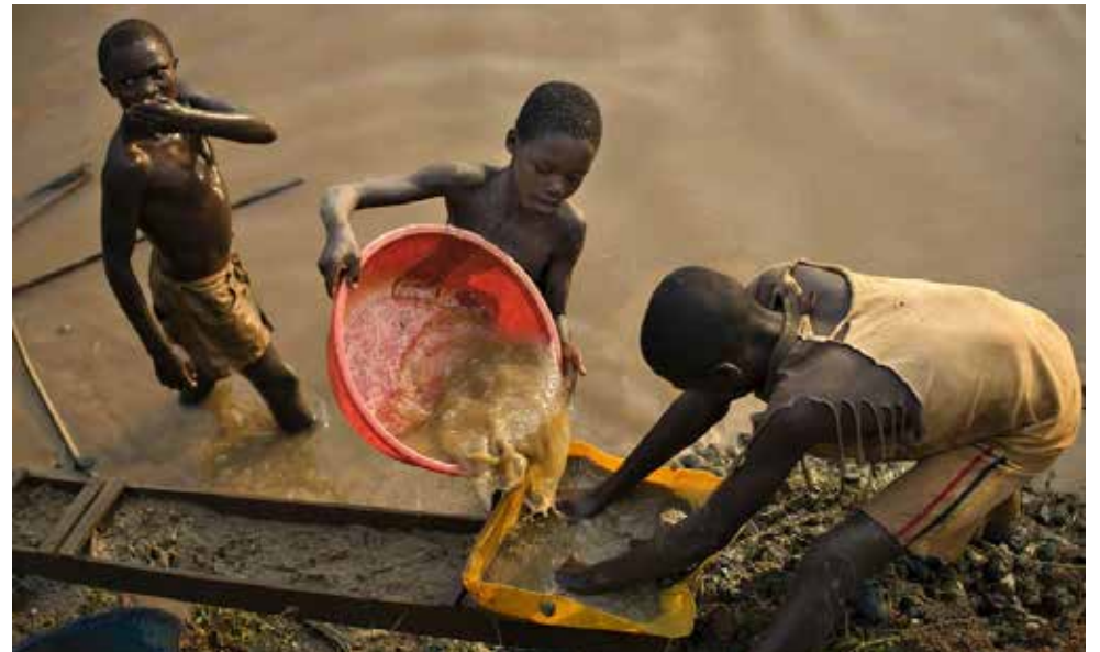
Children working at a galamsey site