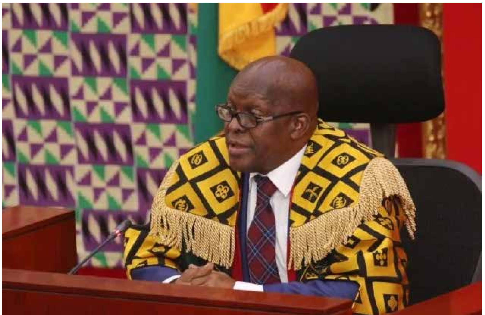
Alban Bagbin, Speaker of Parliament