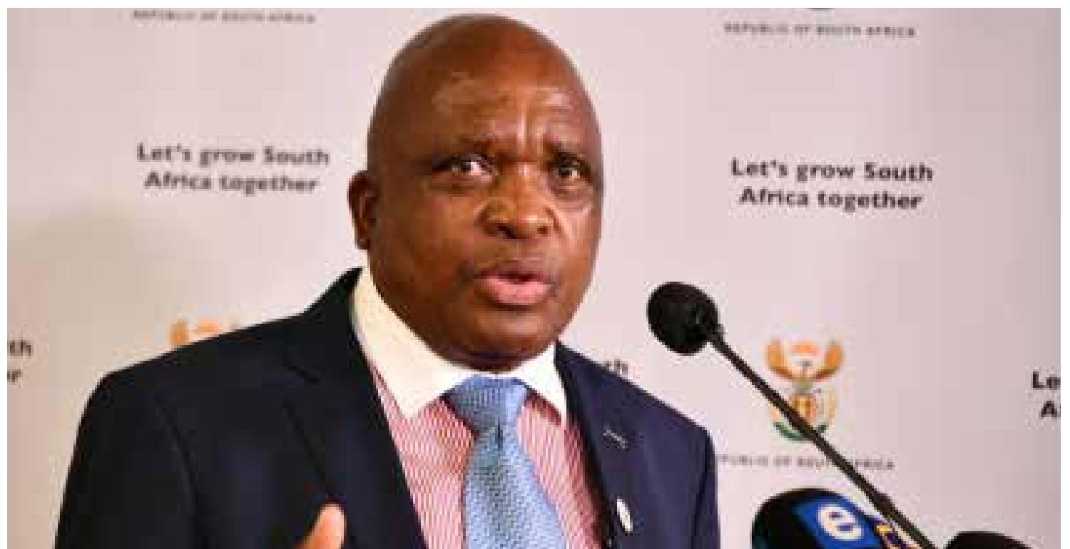
Joe Phaahla, Health Minister