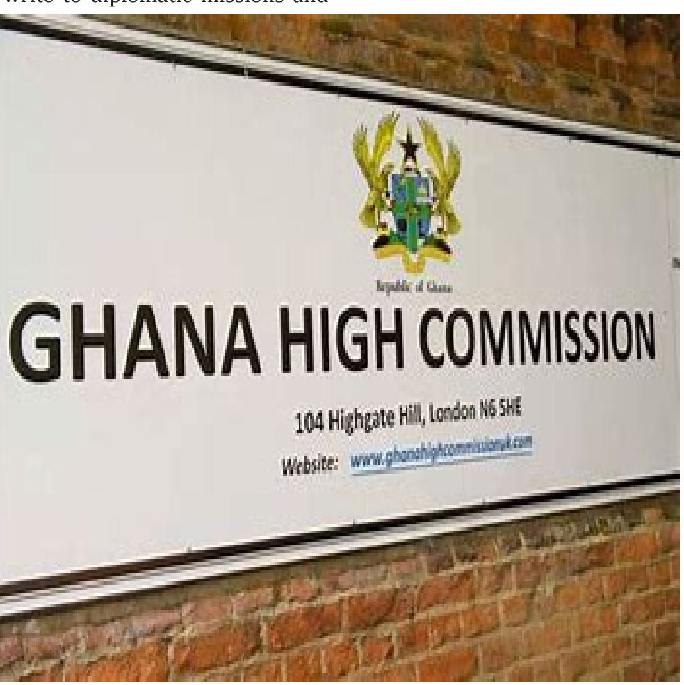
Ghana High Commission Signage