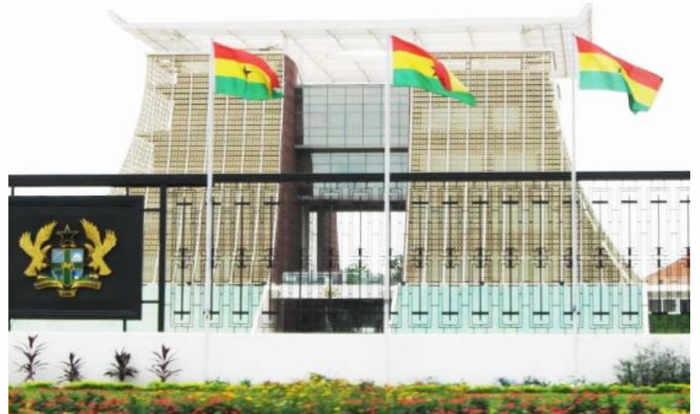
The Jubilee House