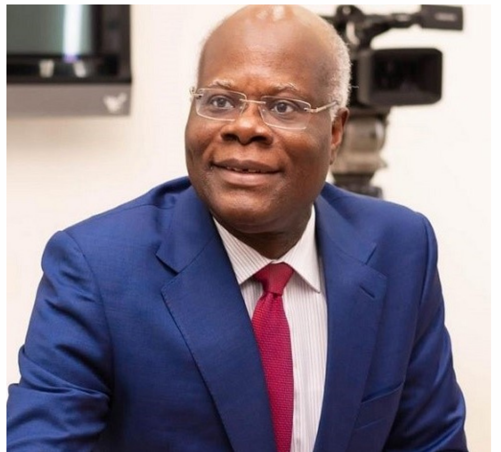
K.T. Hammond, Minister for Trade and Industry