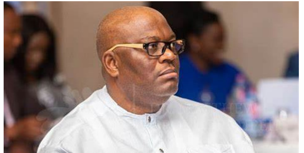
Henry Quartey, Minister for Interior