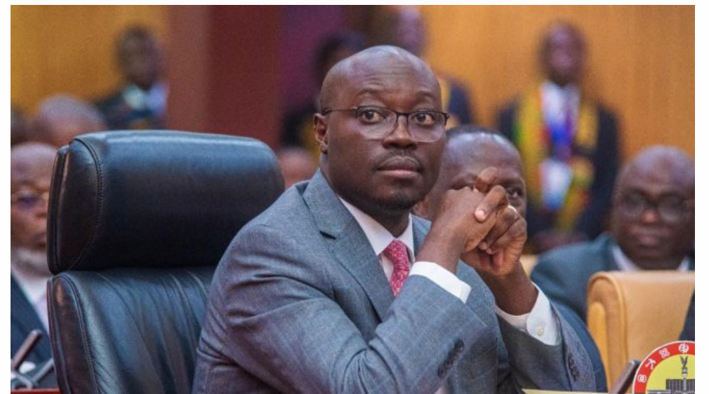
Dr. Cassiel Ato Forson, Minority Leader