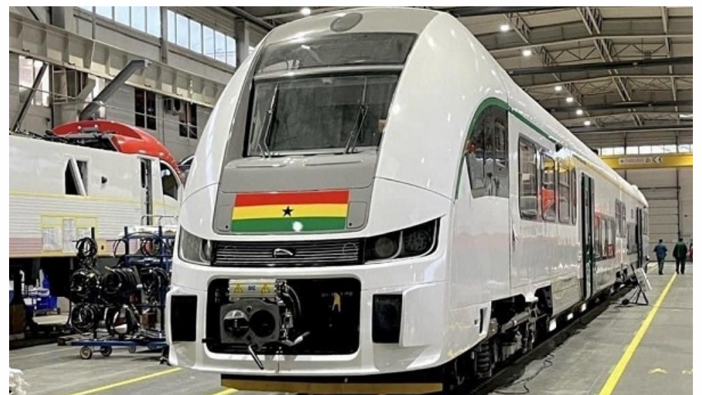
New imported train