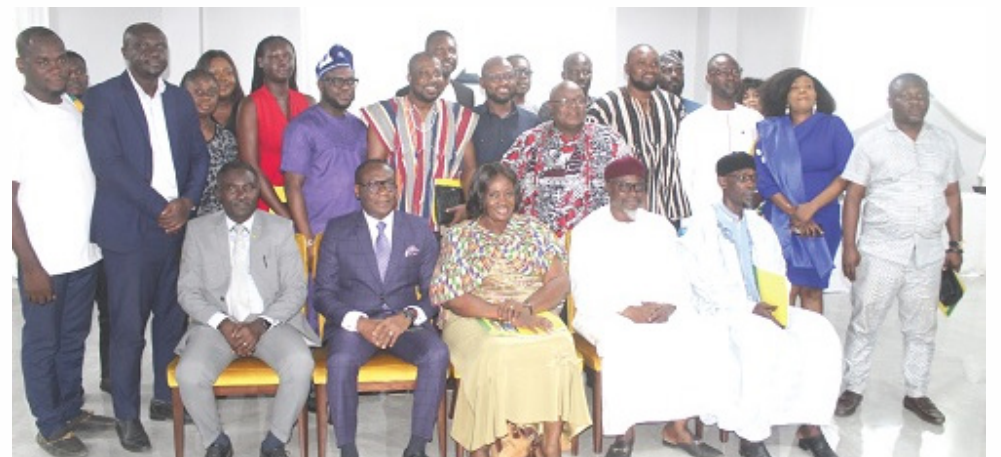
Peace Council Members