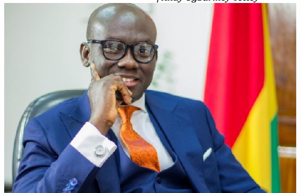
Godfred Yeboah Dame, Attorney-General and Minister for Justice