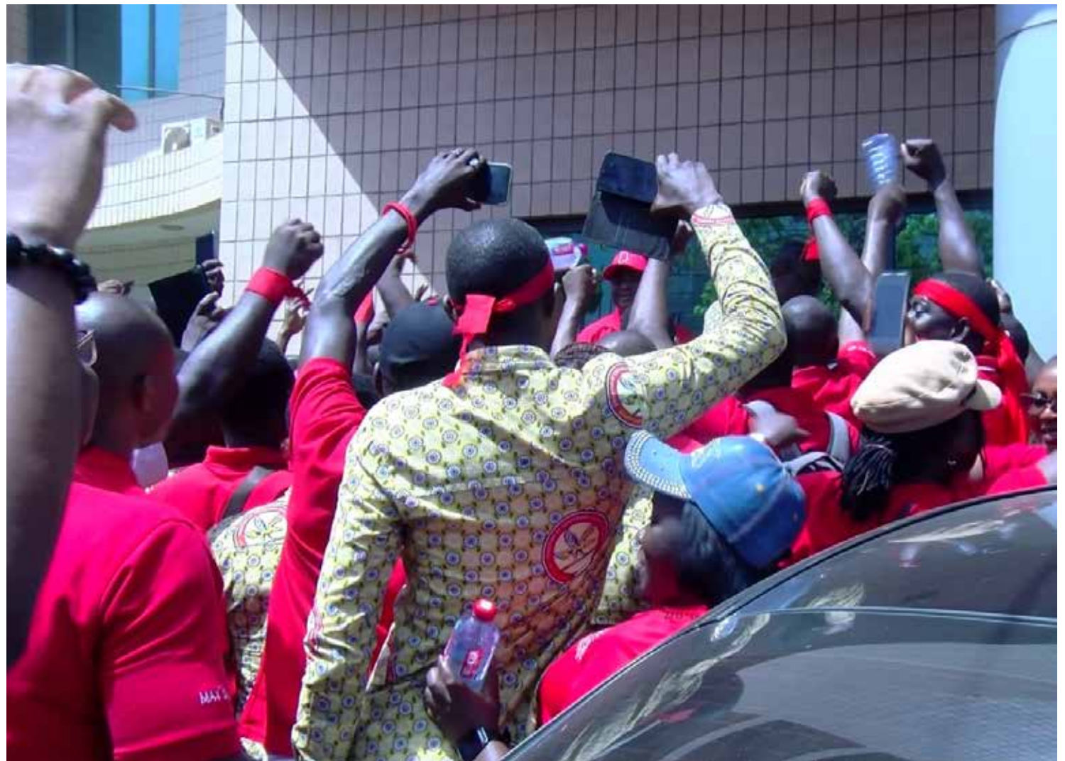
GNAT members holding a demonstration