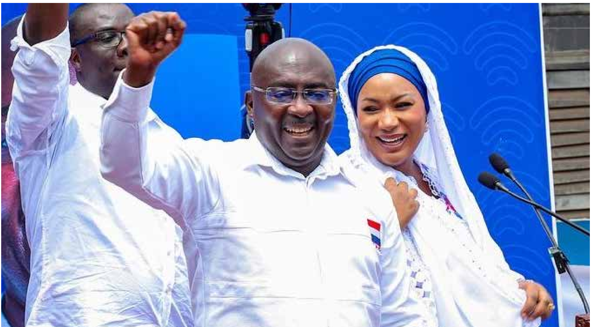
Dr. Mahamudu Bawumia, flagbearer of the New Patriotic Party (NPP)