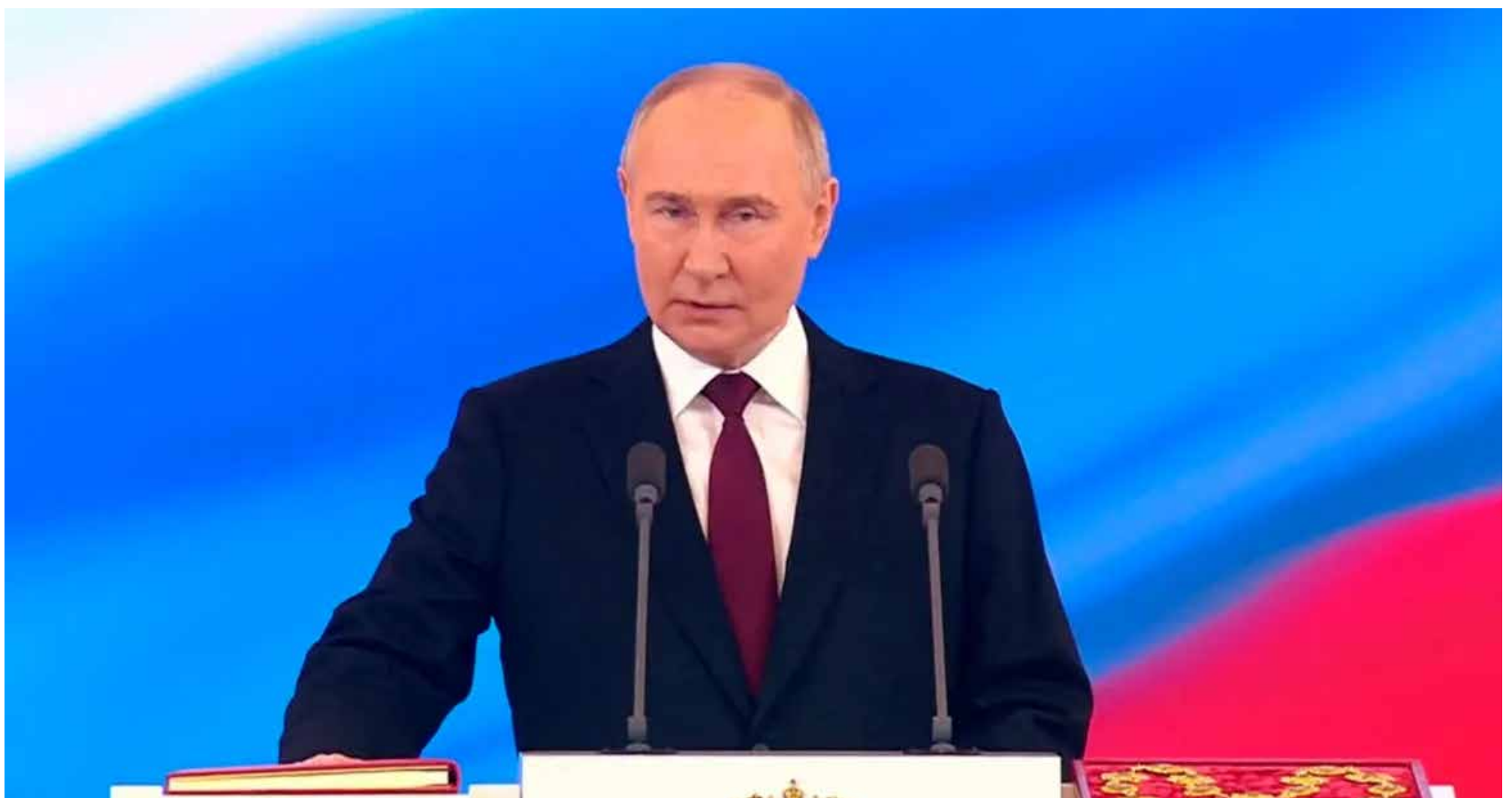
Vladimir Putin, President of Russia