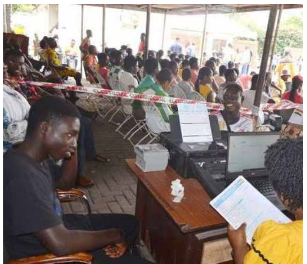
Senior High School students aged 18 and above to participate in the forthcoming limited voter registration exercise