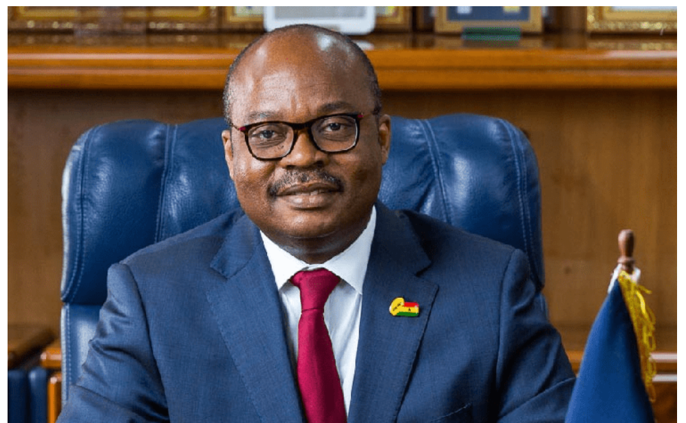
Dr. Ernest Addison, the Governor of the Bank of Ghana