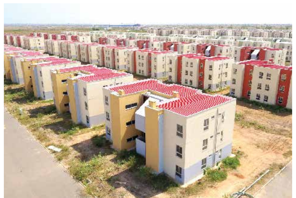
Saglemi Housing Project