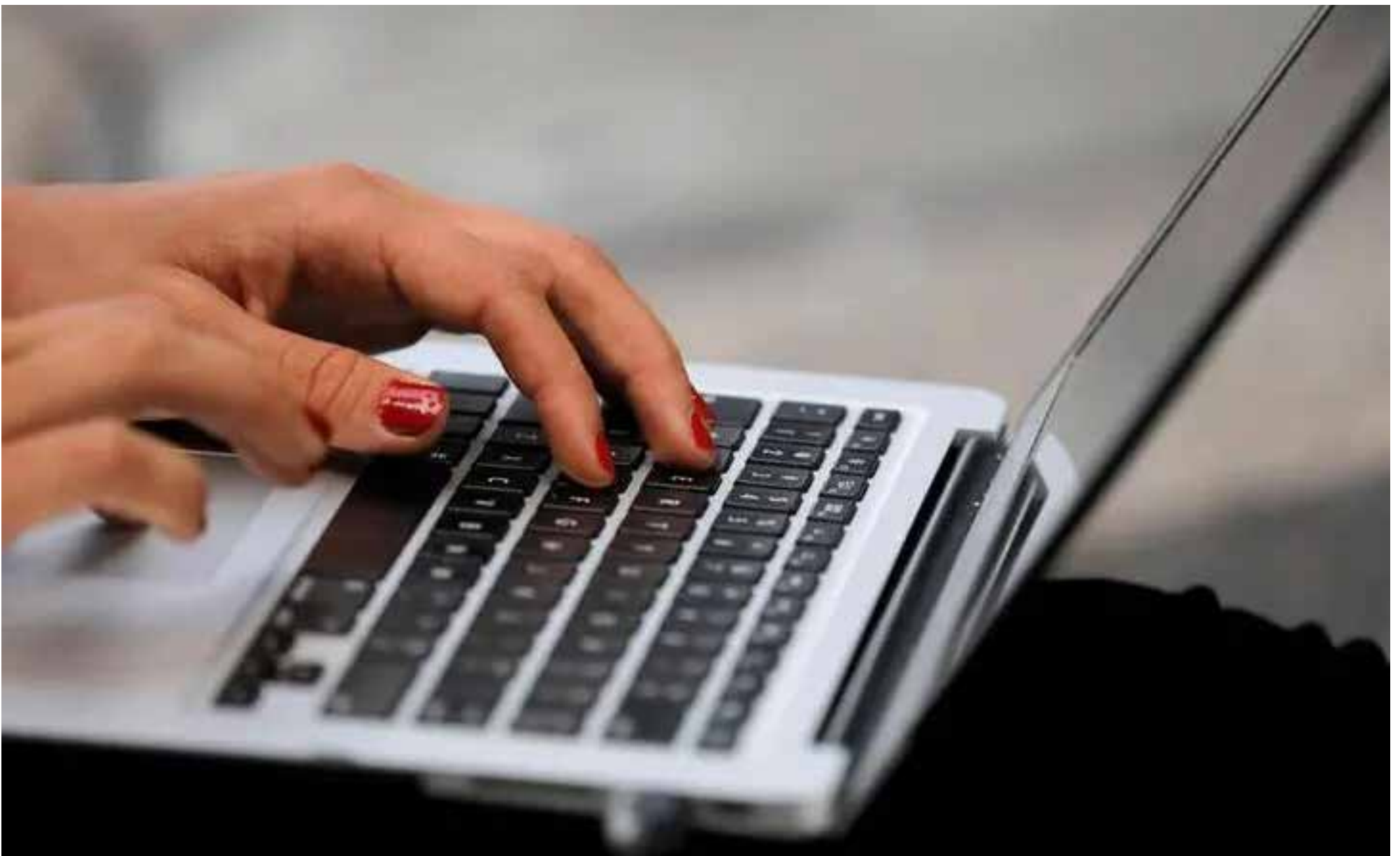
Former U.S. president Donald Trump awaits the start of proceedings at Manhattan criminal court