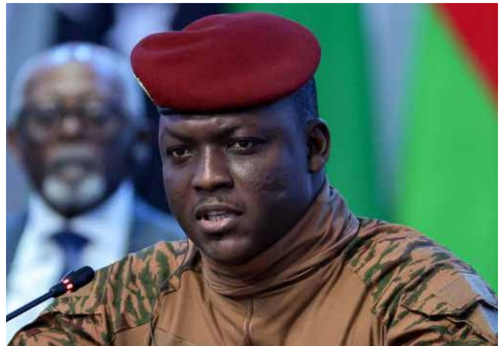
Capt Ibrahim Traoré, Military Ruler of Burkina Faso