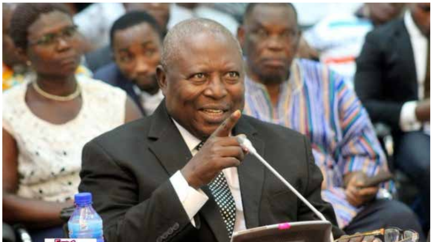
Martin Amidu, Former Special Prosecutor