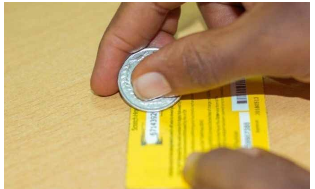
MTN scratch card