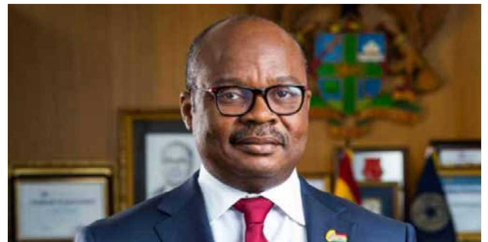
Dr Ernest Addison, Governor of Bank of Ghana