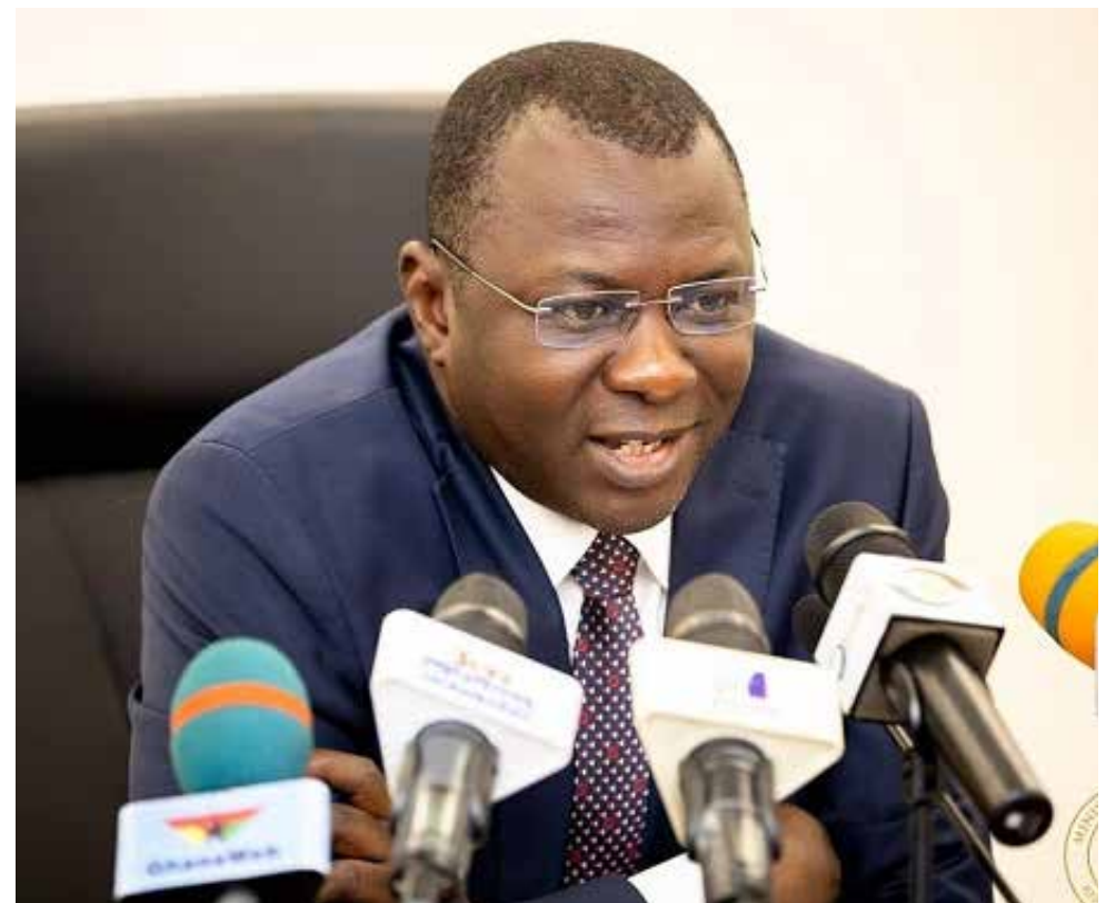
Dr. Mohammed Amin Adam, Minister for Finance