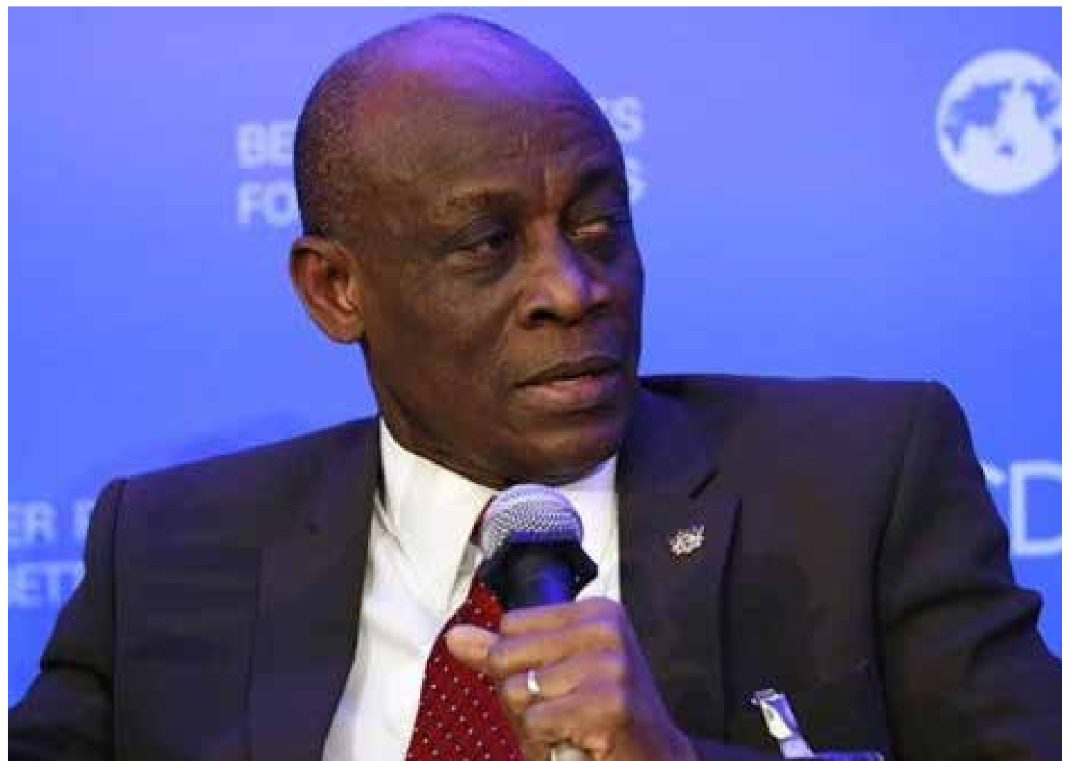
Seth Terkper, Former Minister of Finance