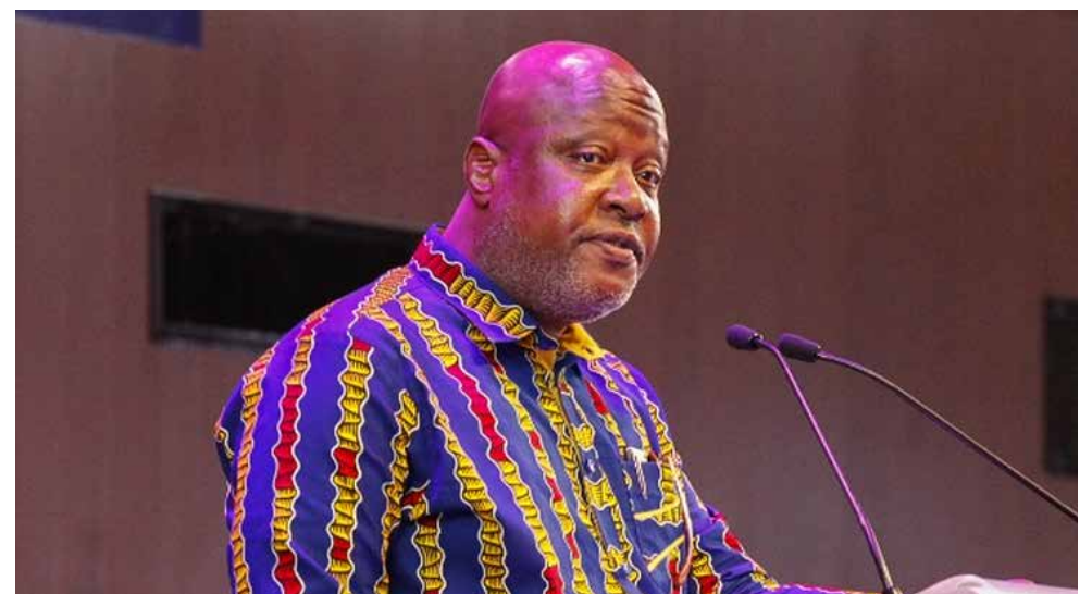
Kwame Sefa Kayi, Host of the Kokrokoo morning show