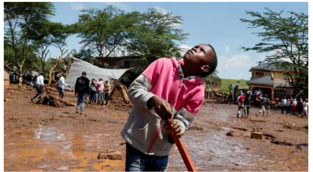
A boy looks at a helicopter hovering near the search and rescue location after heavy flash floods wiped out several homes when a dam burst