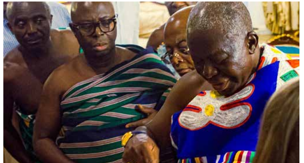
Otumfuo Osei Tutu II, Asantehene (Asante King) (R)