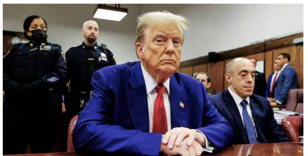
Former U.S. president Donald Trump awaits the start of proceedings at Manhattan criminal court