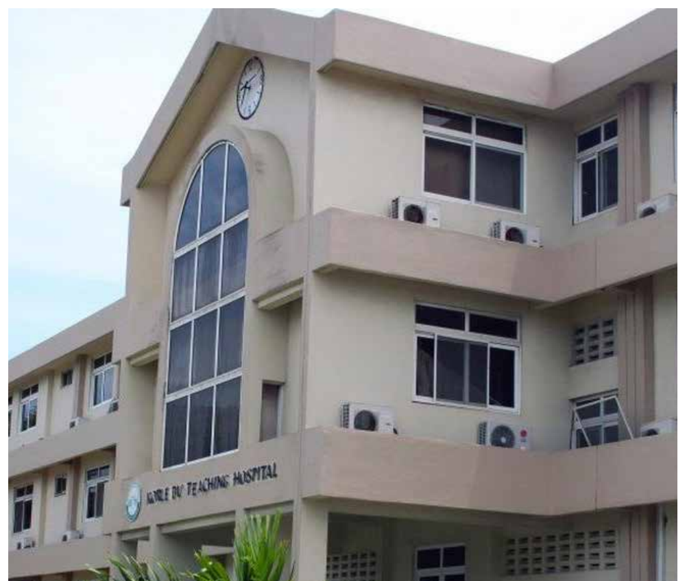
Korle Bu Teaching Hospital