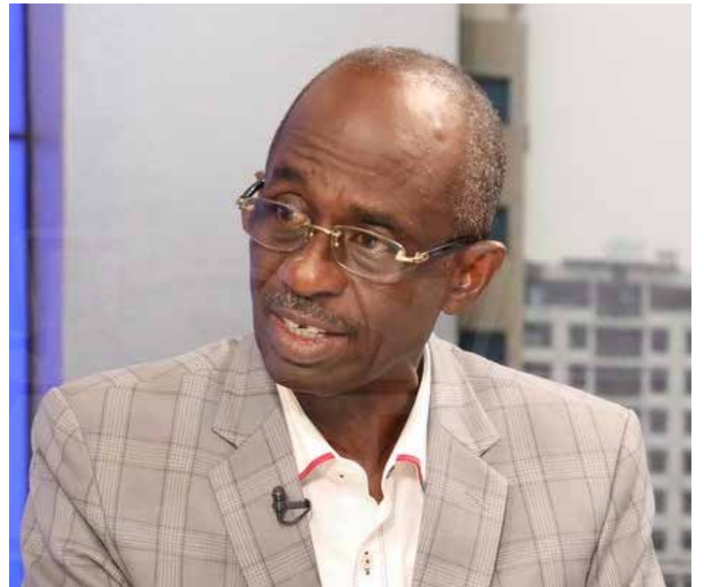
Johnson Asiedu Nketia, NDC's National Chairman