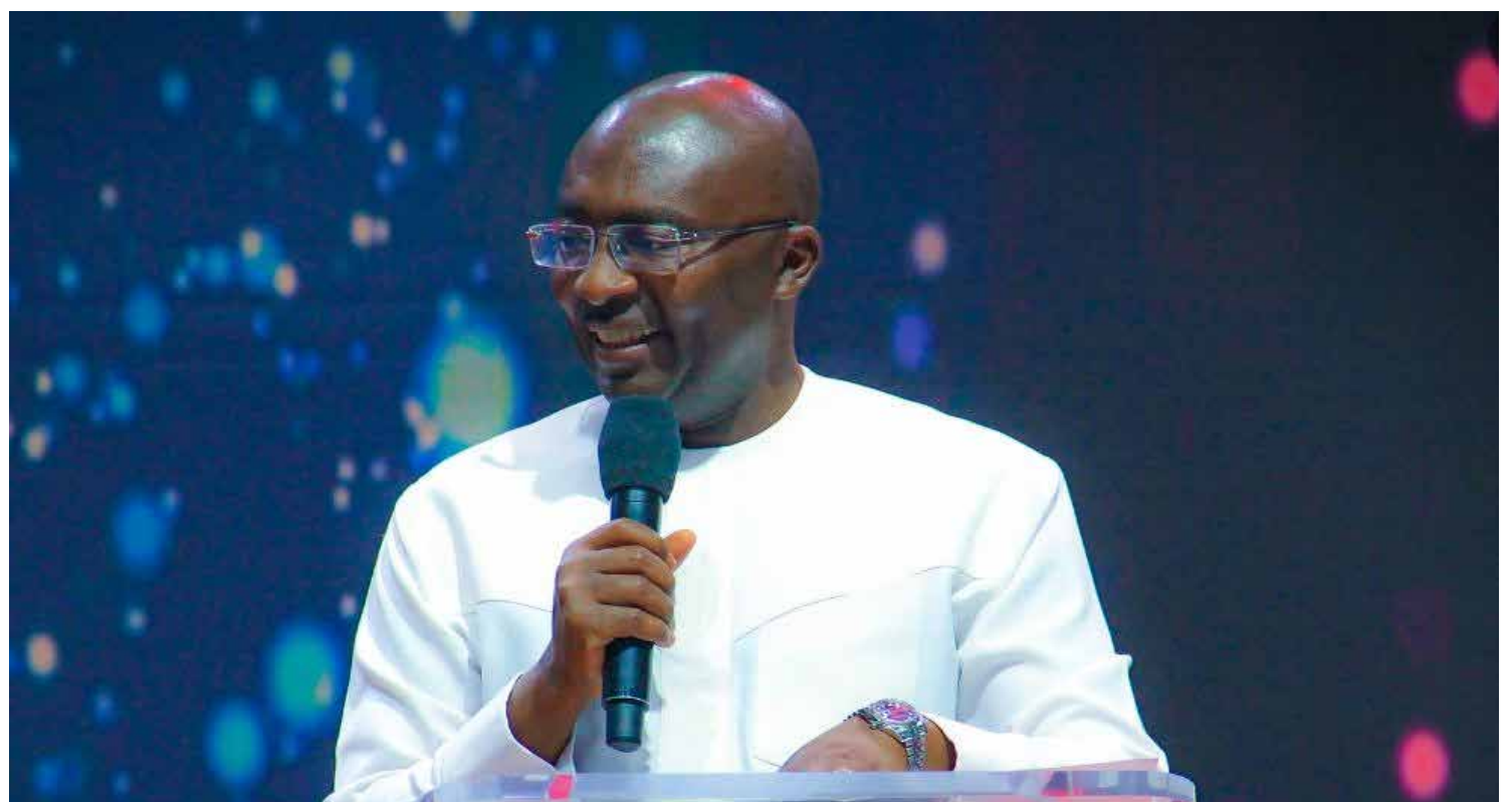
Dr. Mahamudu Bawumia, Vice President of Ghana and Flagbearer of the NPP