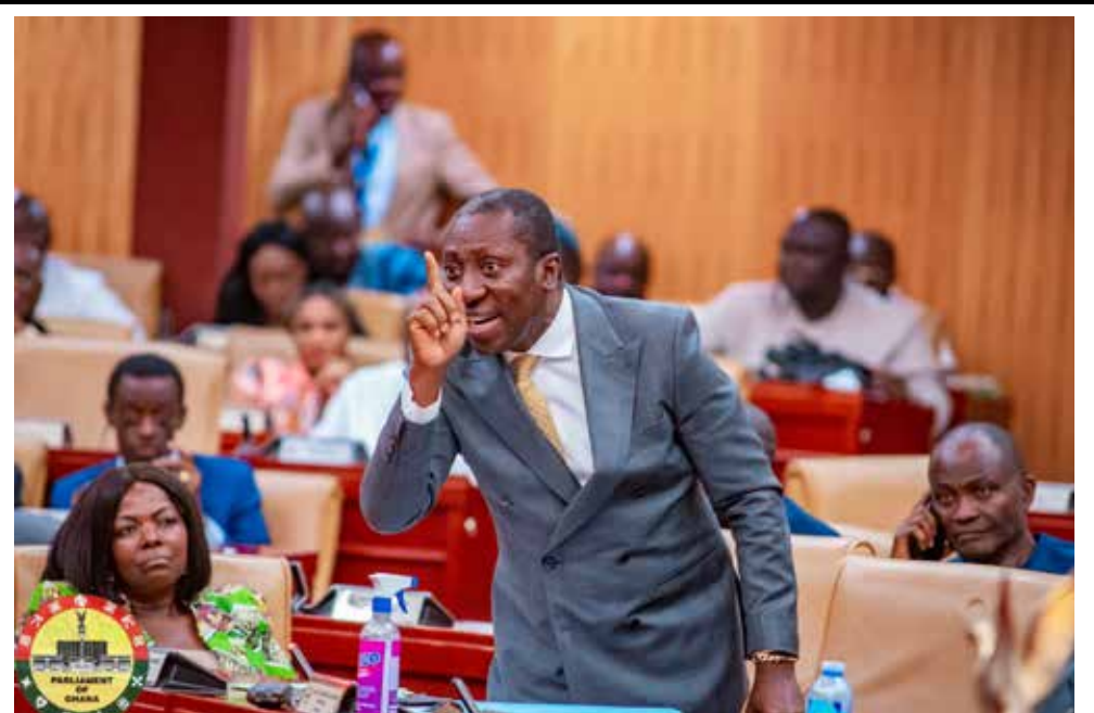
Alexander Afenyo-Markin, Majority Leader in Parliament