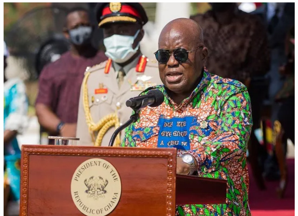
Nana Akufo-Addo, President of Ghana