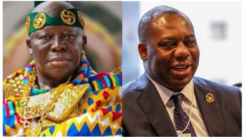
Otumfuo Osei Tutu II, Asantehene on the left, Matthew Opoku Prempeh, Energy Minister on the right