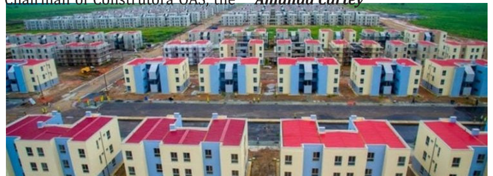
Saglemi Housing Project