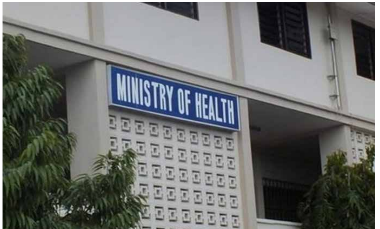
Ministry of Health