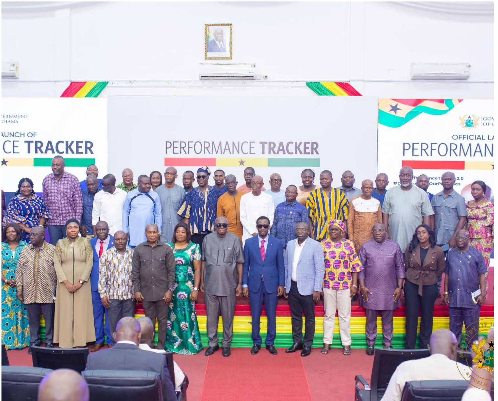
The Performance Tracker was launched on April 10, 2024