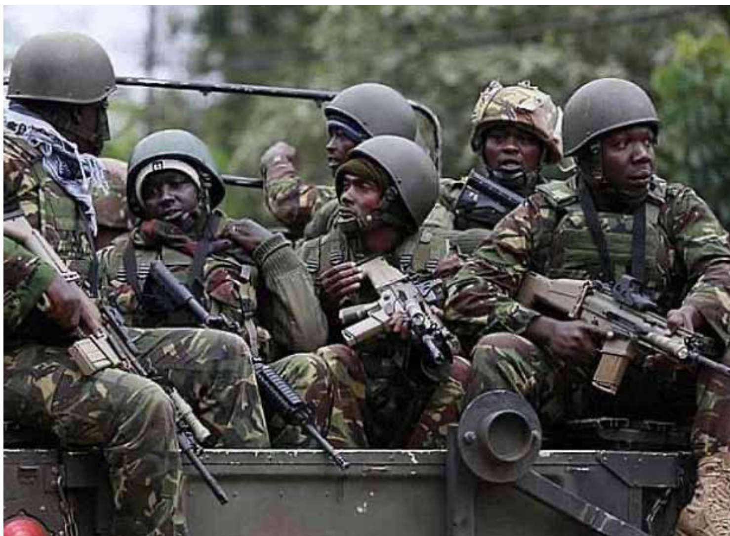
Ghana Armed Forces (GAF)