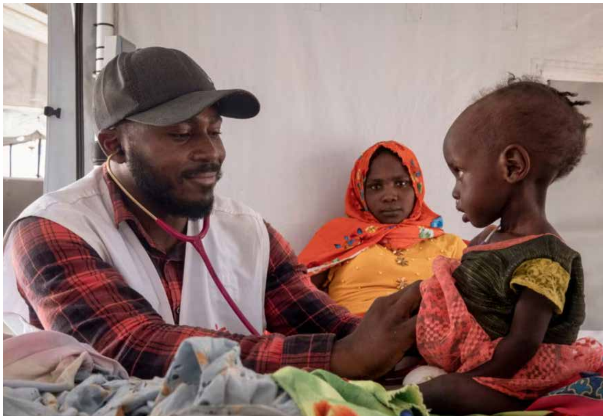
Sudanese children suffering from malnutrition are treated at a clinic in Metche Camp, Chad, near the Sudanese border