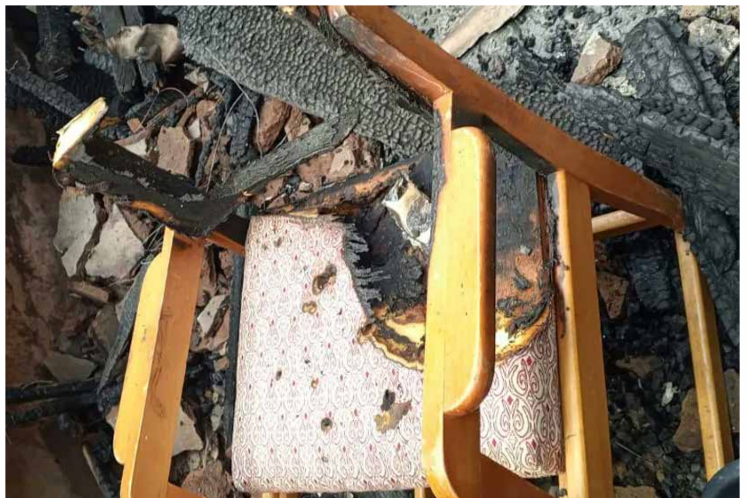
Fire destroys late Krachi East MCE's office