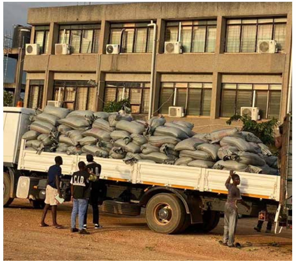
Trucks of cocoa beans suspected to be smuggled to Togo