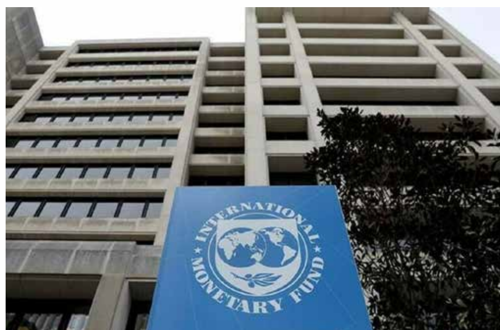
International Monetary Fund (IMF) head office