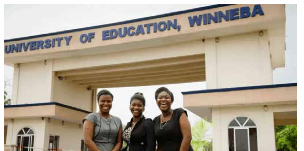
University of Education, Winneba (UEW)