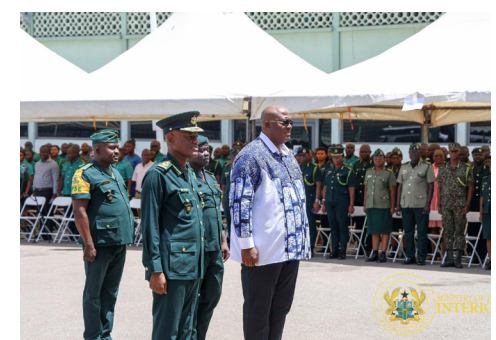
Henry Quartey, Interior Minister