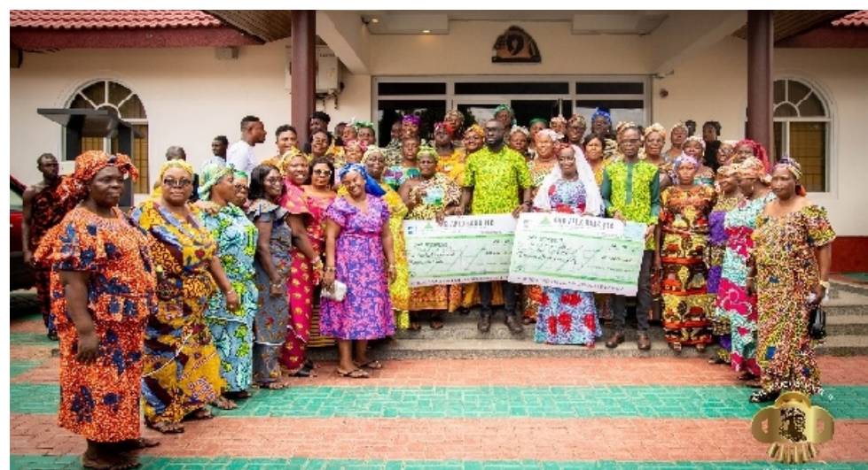
Kumasi Market Women Representatives