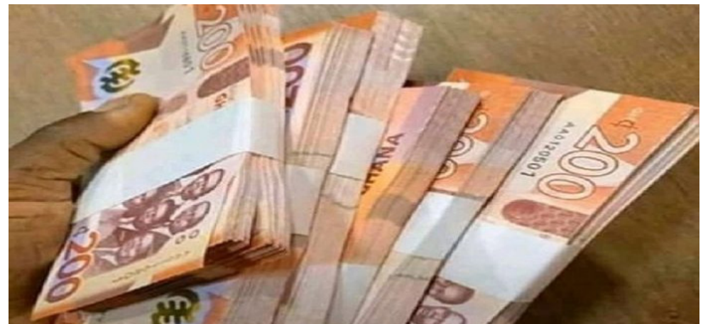
Ghana Cedis Notes