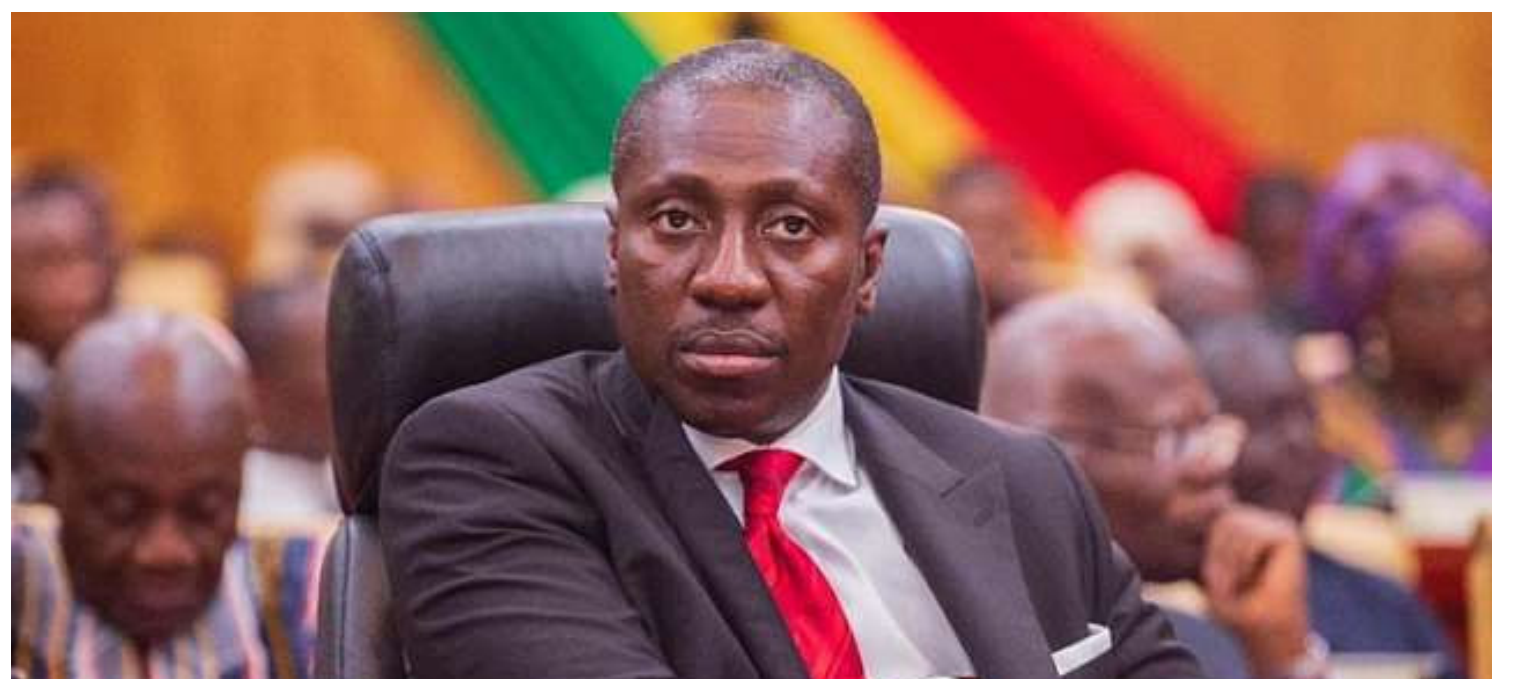
Alexander Kwamena Afenyo-Markin, Majority Leader