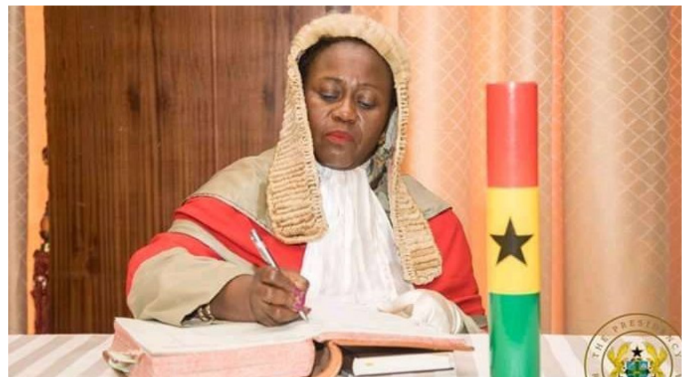
Justice Gertrude Sackey, Chief Justice, Ghana