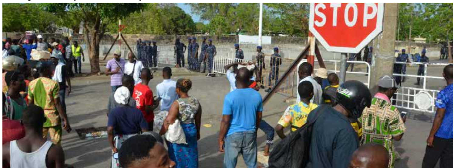
Security forces cordon off a street as members of Benin's Trade unions demonstrate to demand higher wages and better working conditions in Cotonou, Benin