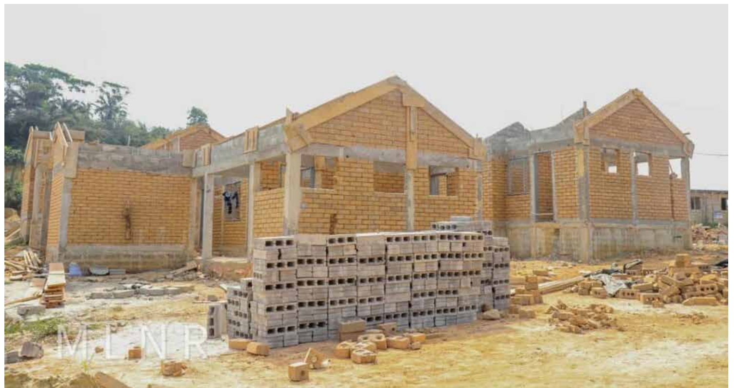
Appiatse Reconstruction Project