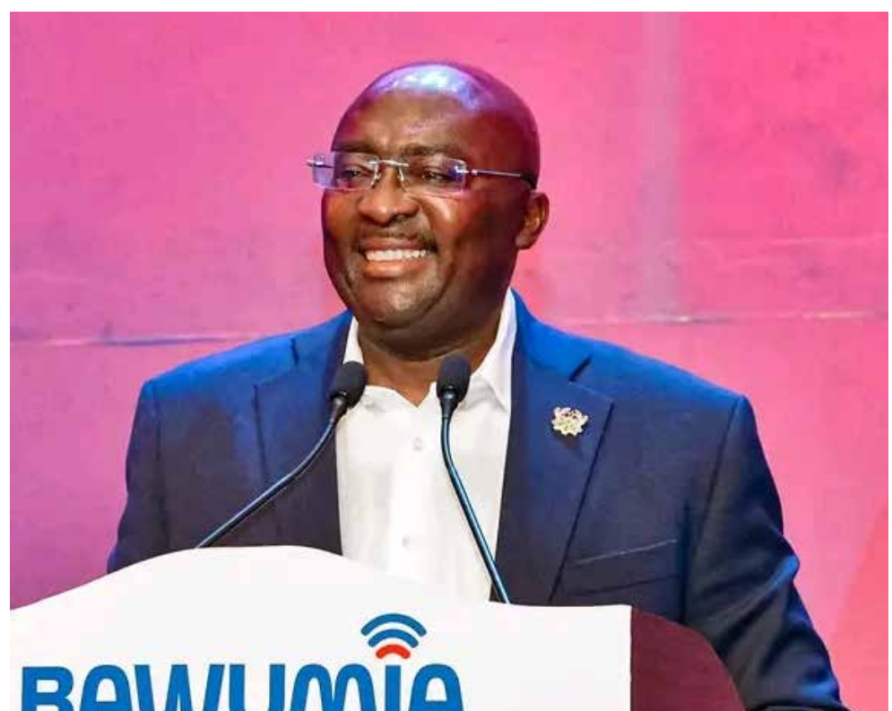
Dr. Mahamudu Bawumia, Vice President of Ghana