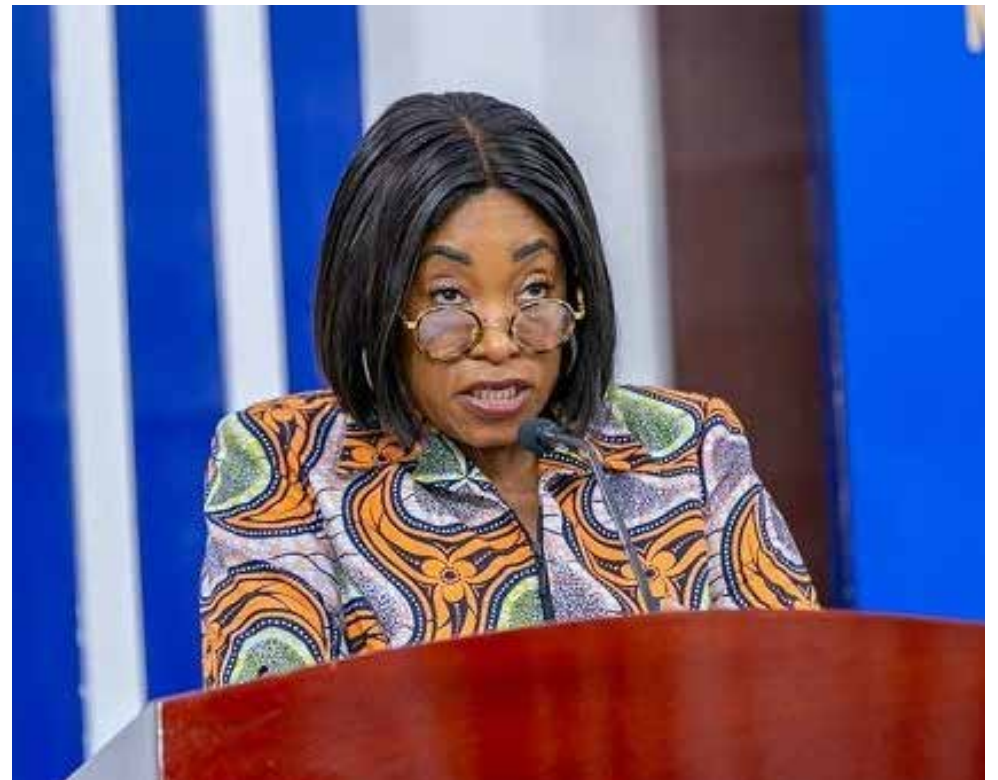
Shirley Ayorkor Botchwey, Minister for Foreign Affairs and Regional Integration