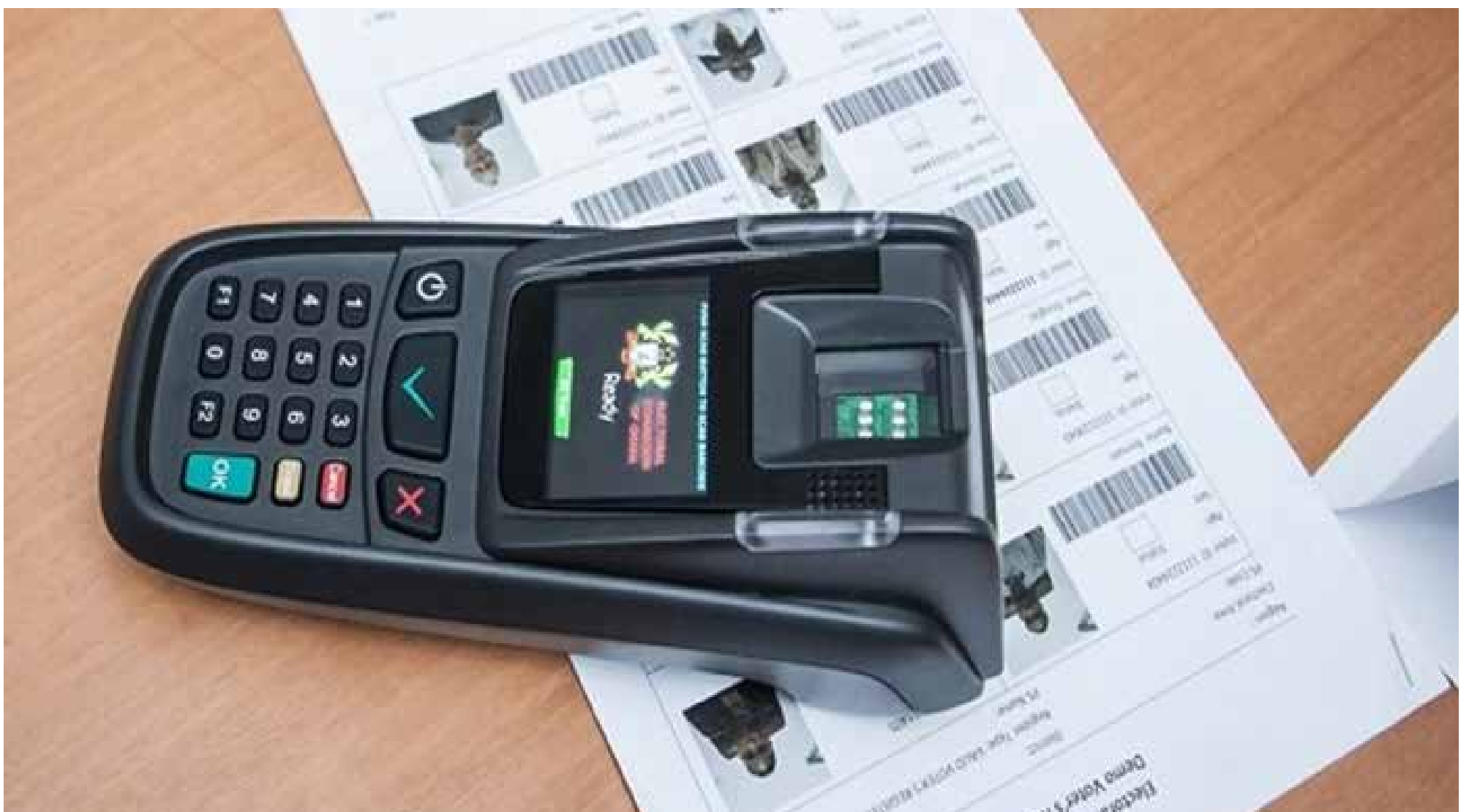
Biometric Verification Devices (BVDs)