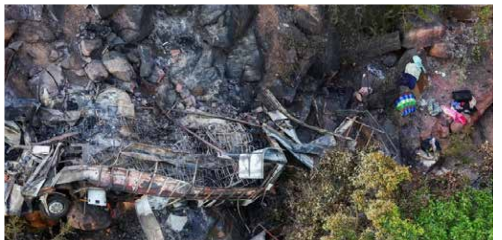
Scene of South Africa bus crash