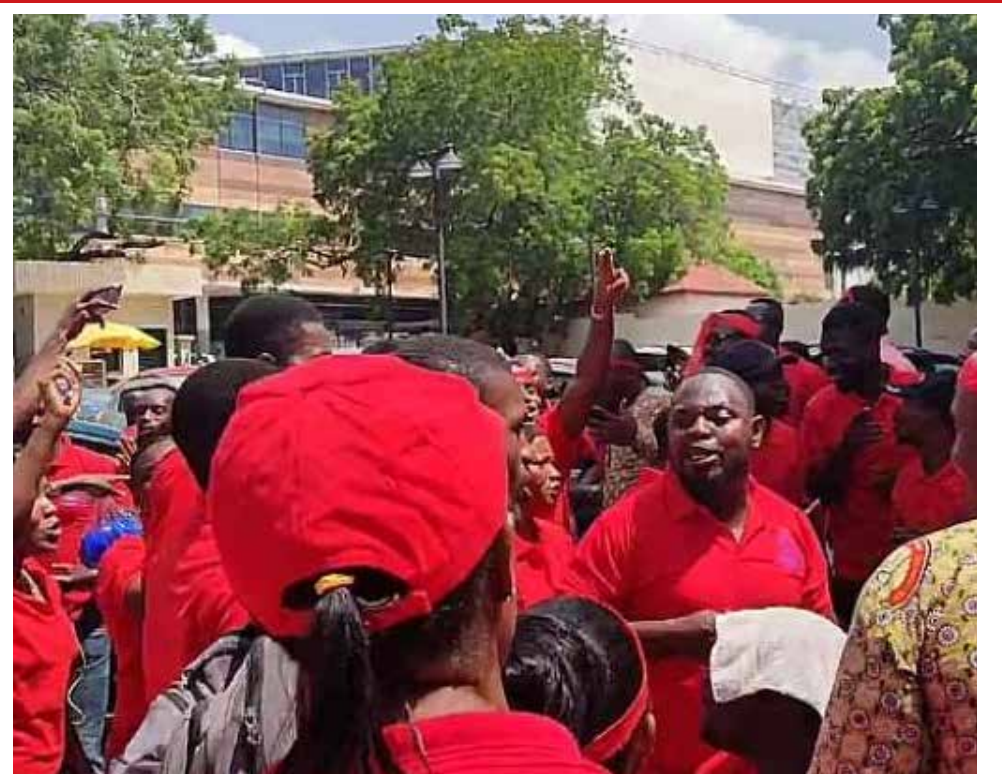
Teachers Union strike