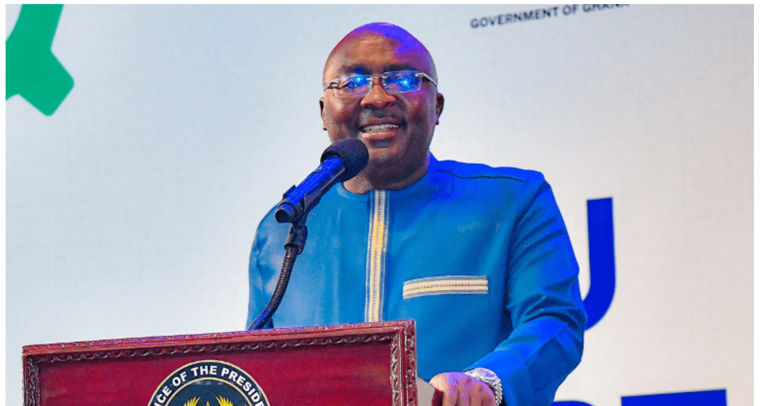
Dr. Mahamudu Bawumia, Presidential candidate for the New Patriotic Party (NPP)