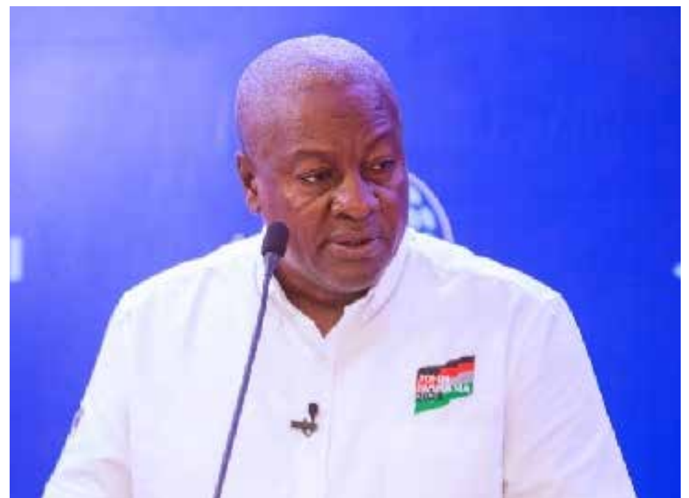
John Dramani Mahama, Flagbearer of the National Democratic Congress