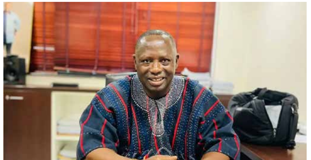
Emmanuel Armah Kofi Buah, Former Energy Minister