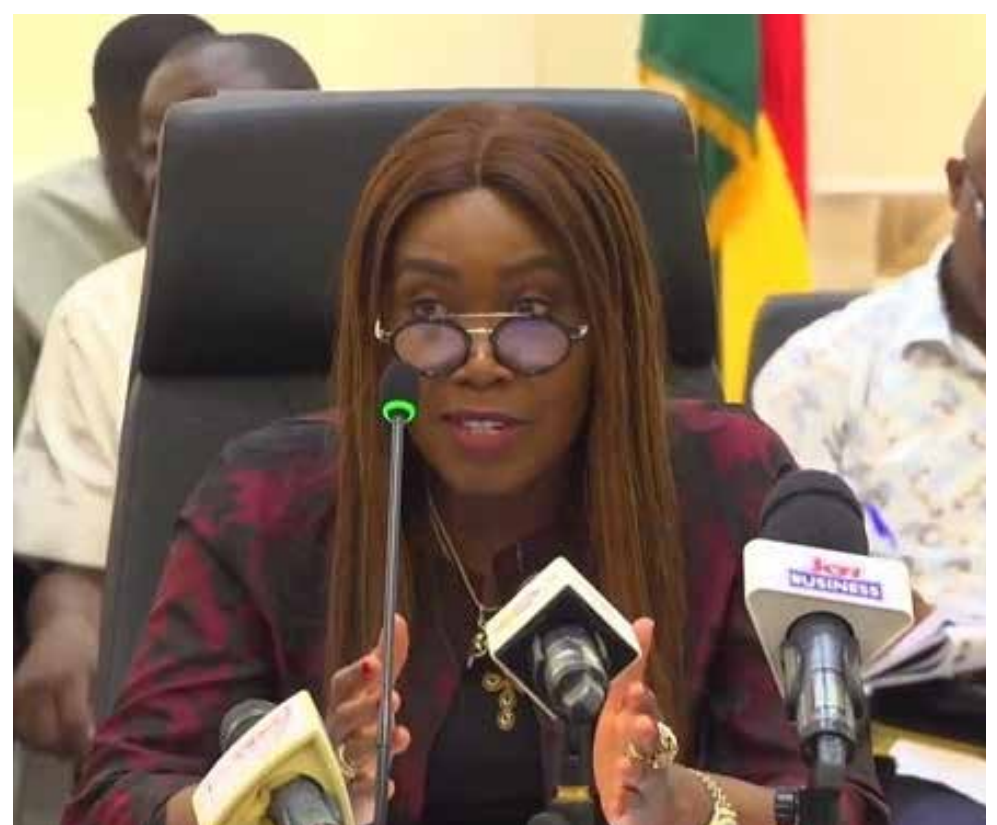
Julie Essiam, Commissioner-General of the GRA