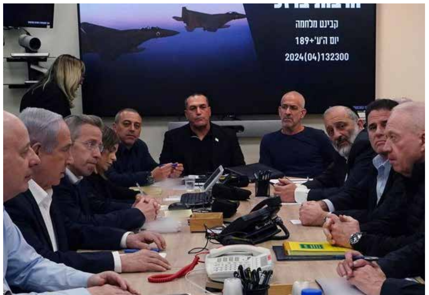
Israel's war cabinet and others meeting Sunday