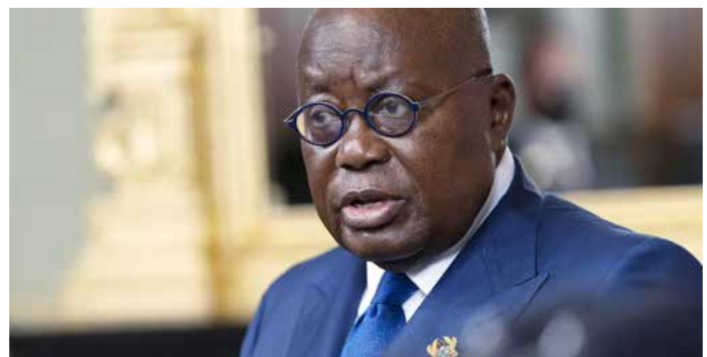
Nana Addo Dankwa Akufo-Addo, President of Ghana