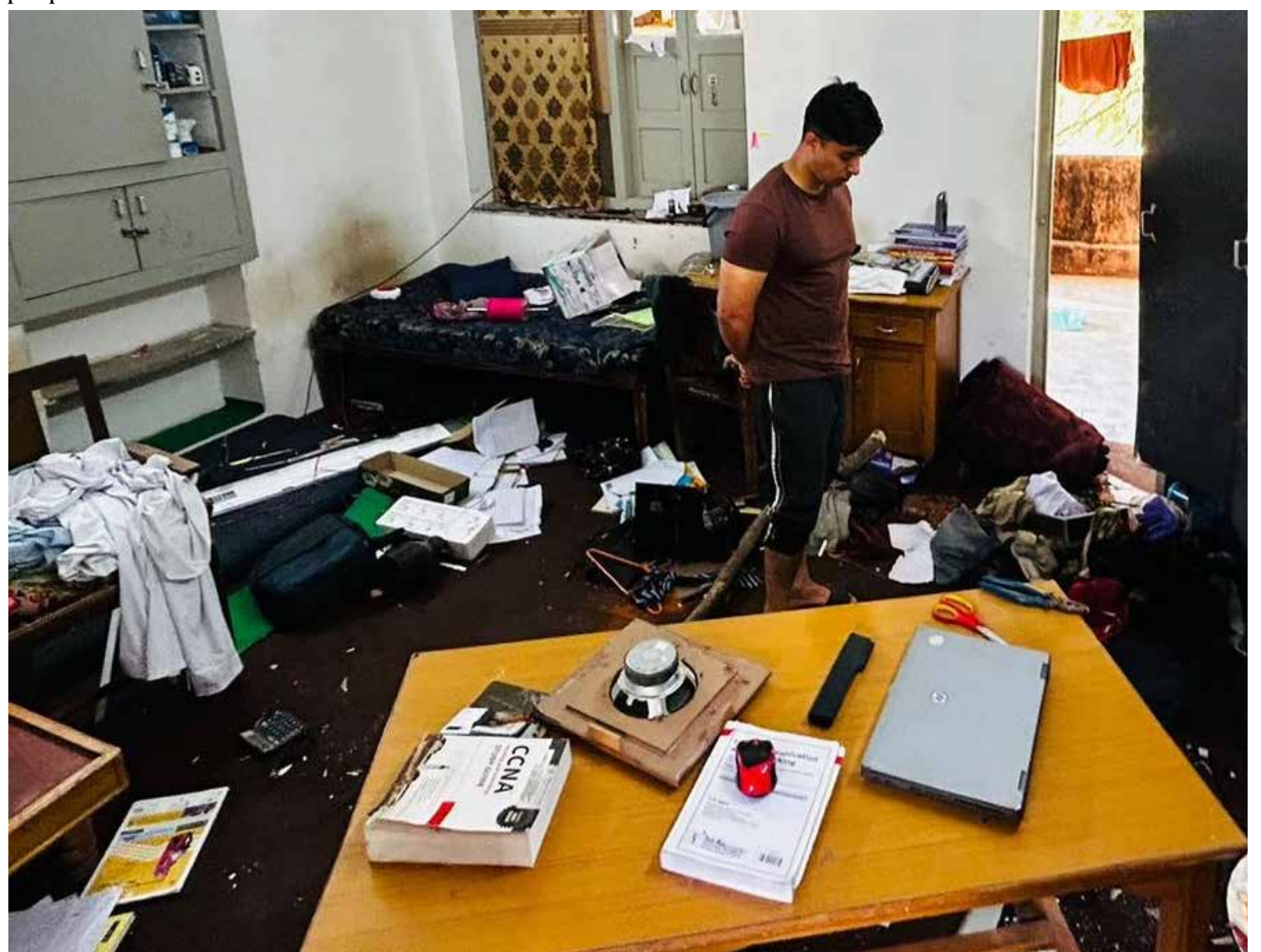
The attackers also vandalised the hostel room in the university's premises