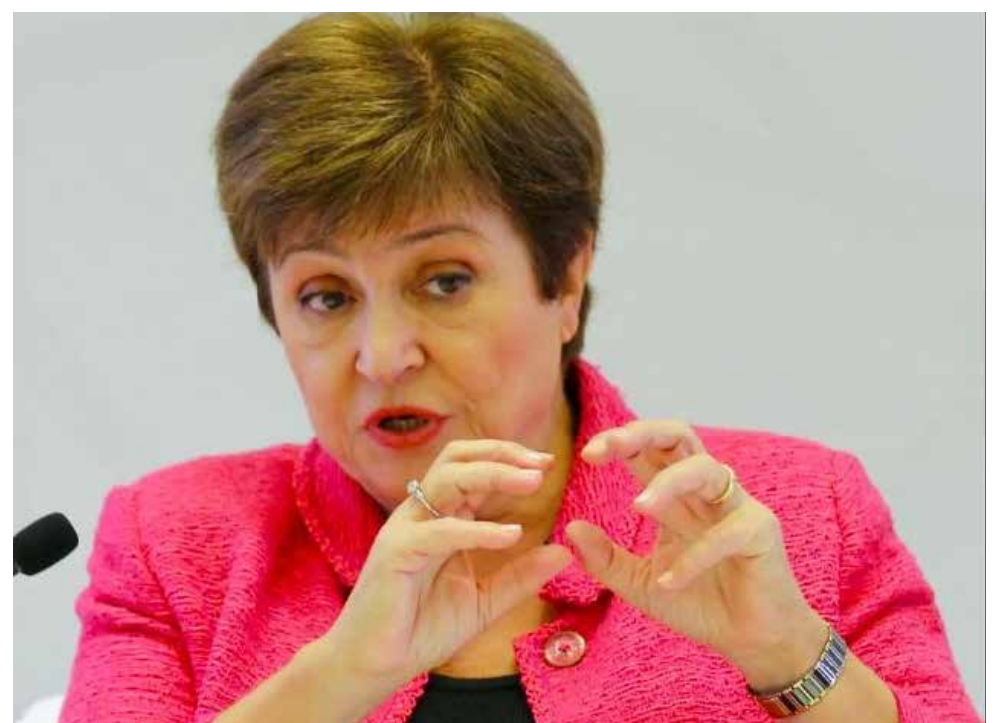
Kristalina Georgieva, Managing Director of the International Monetary Fund (IMF)