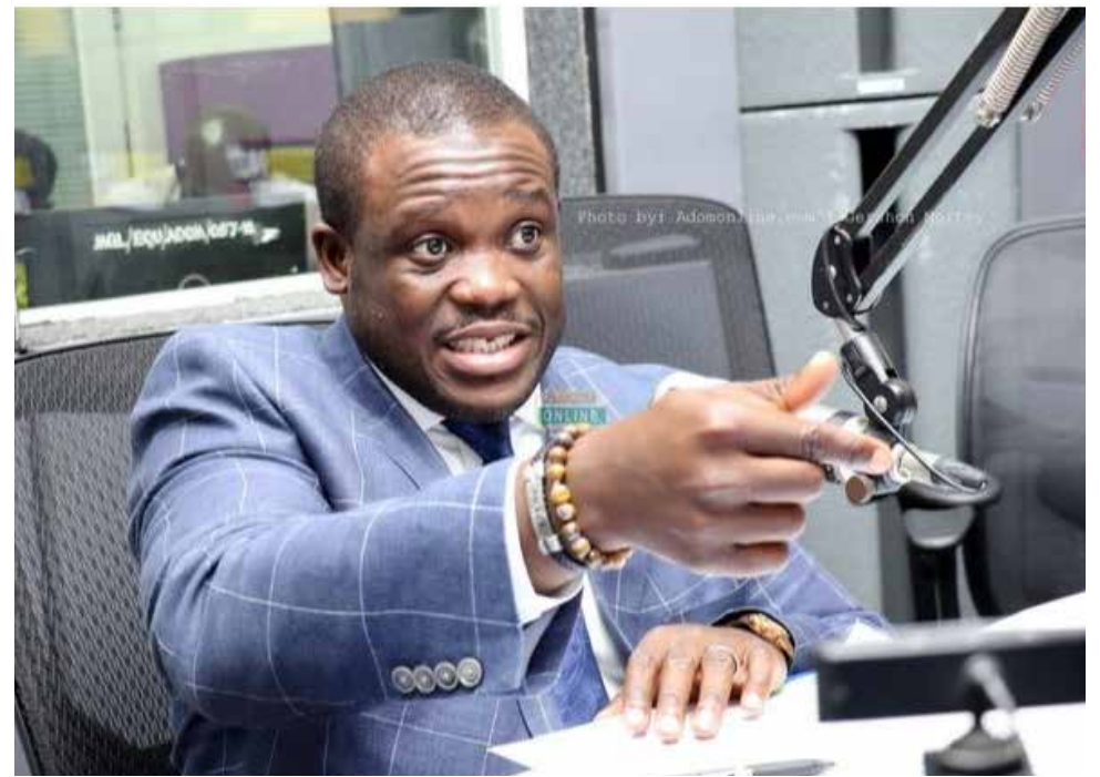
Samuel Nartey George, MP for Ningo-Prampram