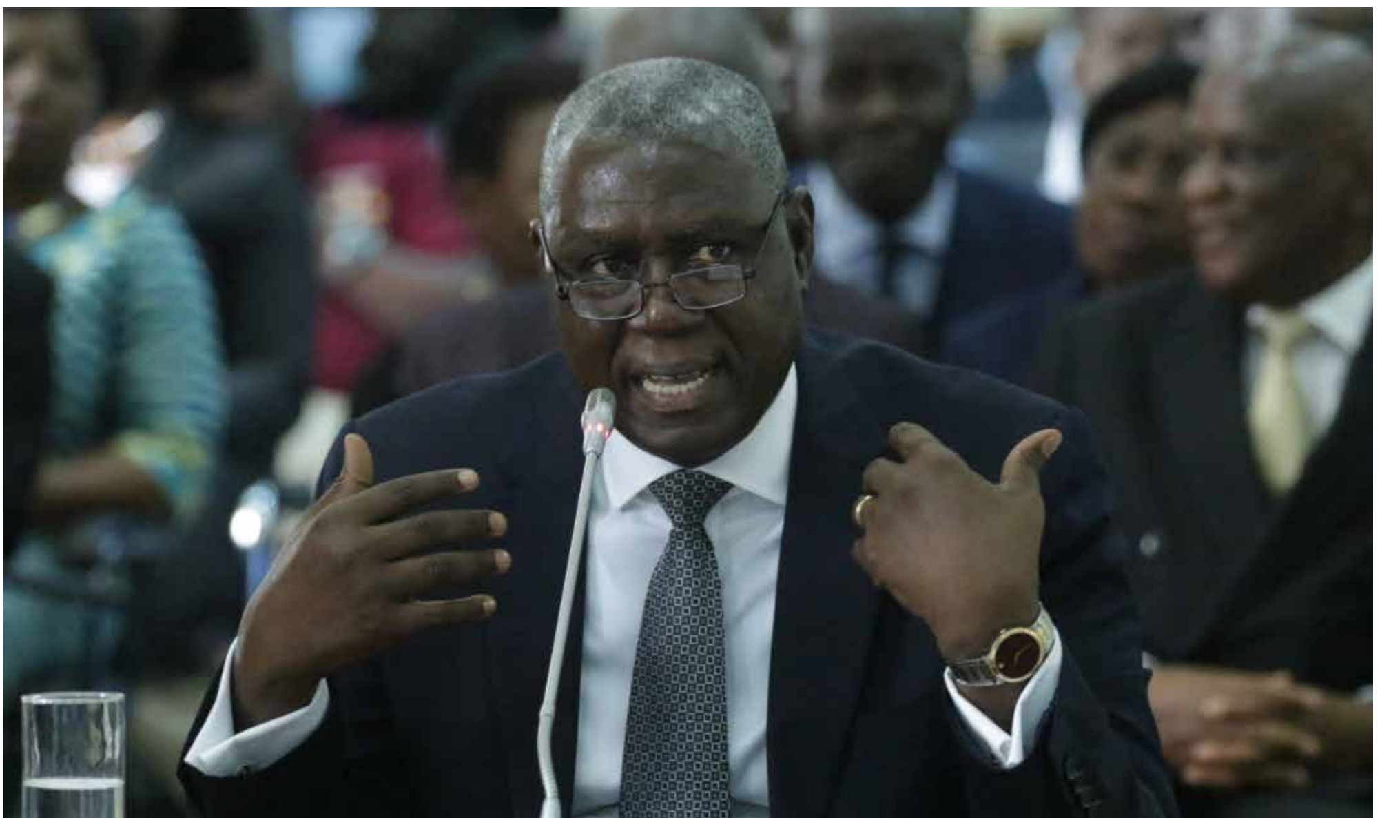
Kwasi Anin-Yeboah, Ghana's former Chief Justice