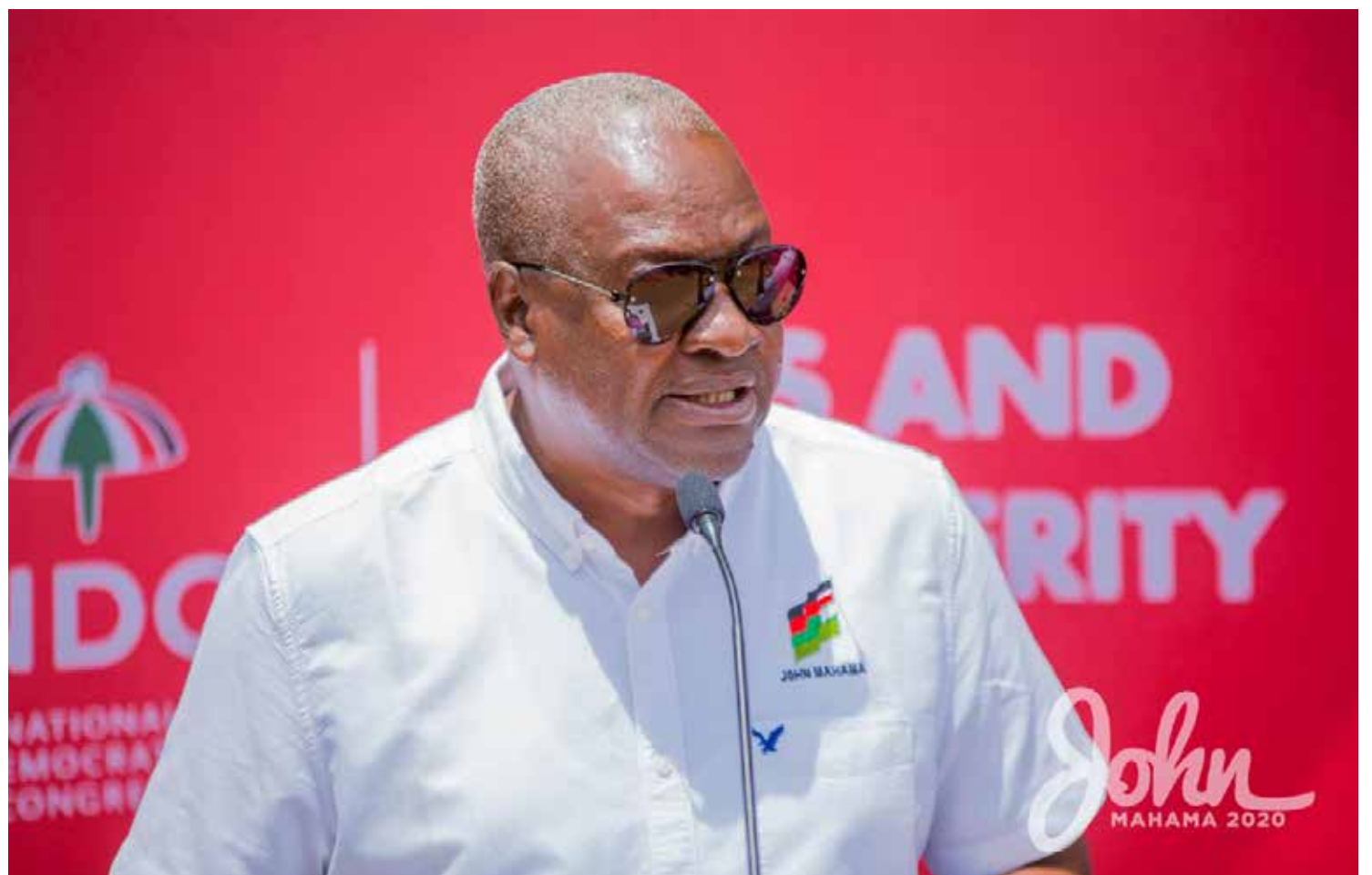
John Dramani Mahama, NDC flagbearer