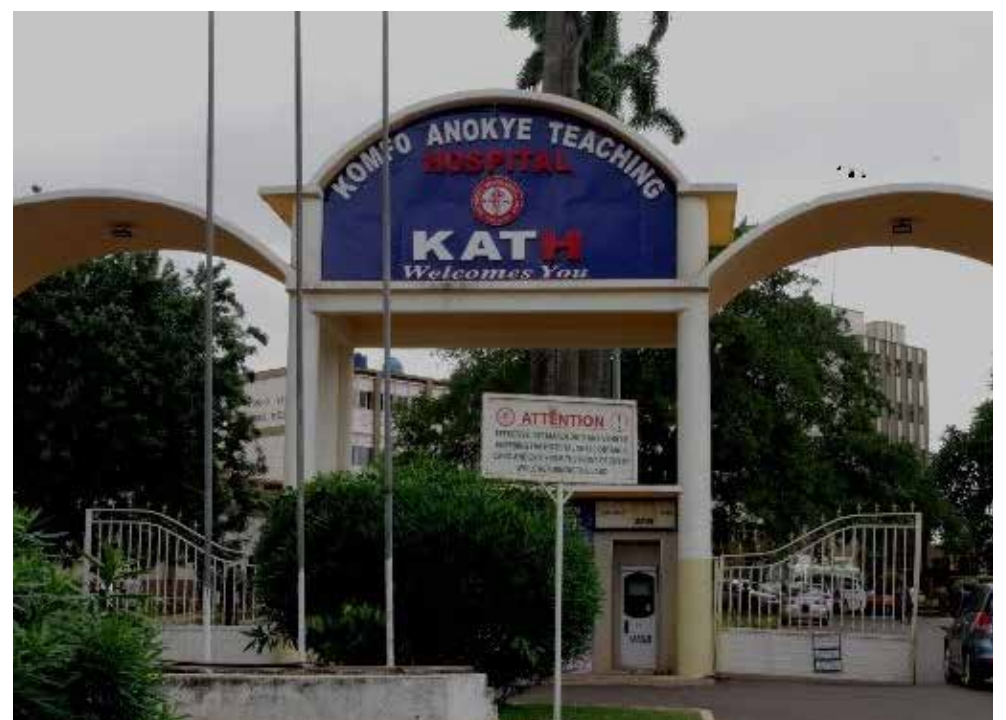
Komfo Anokye Teaching Hospital (KATH)