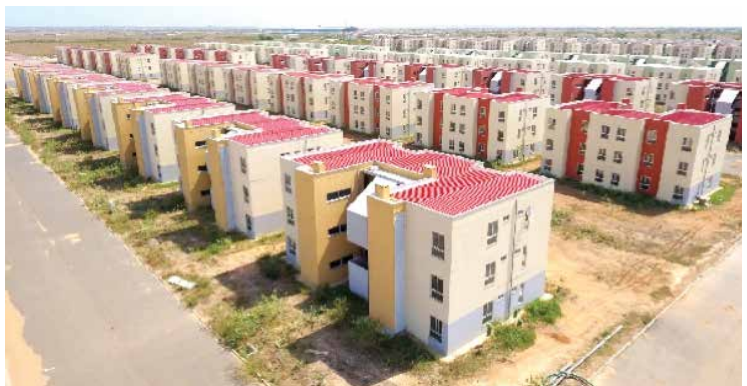
Saglemi Housing project