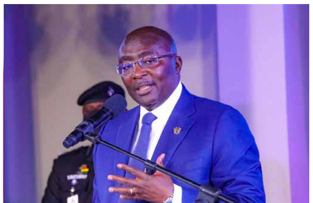
Dr. Mahmud Bawumia, Vice President of Ghana