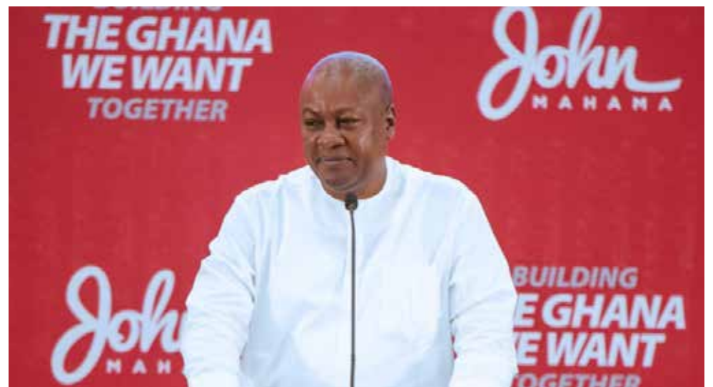
John Dramani Mahama, Presidential Candidate for the NDC