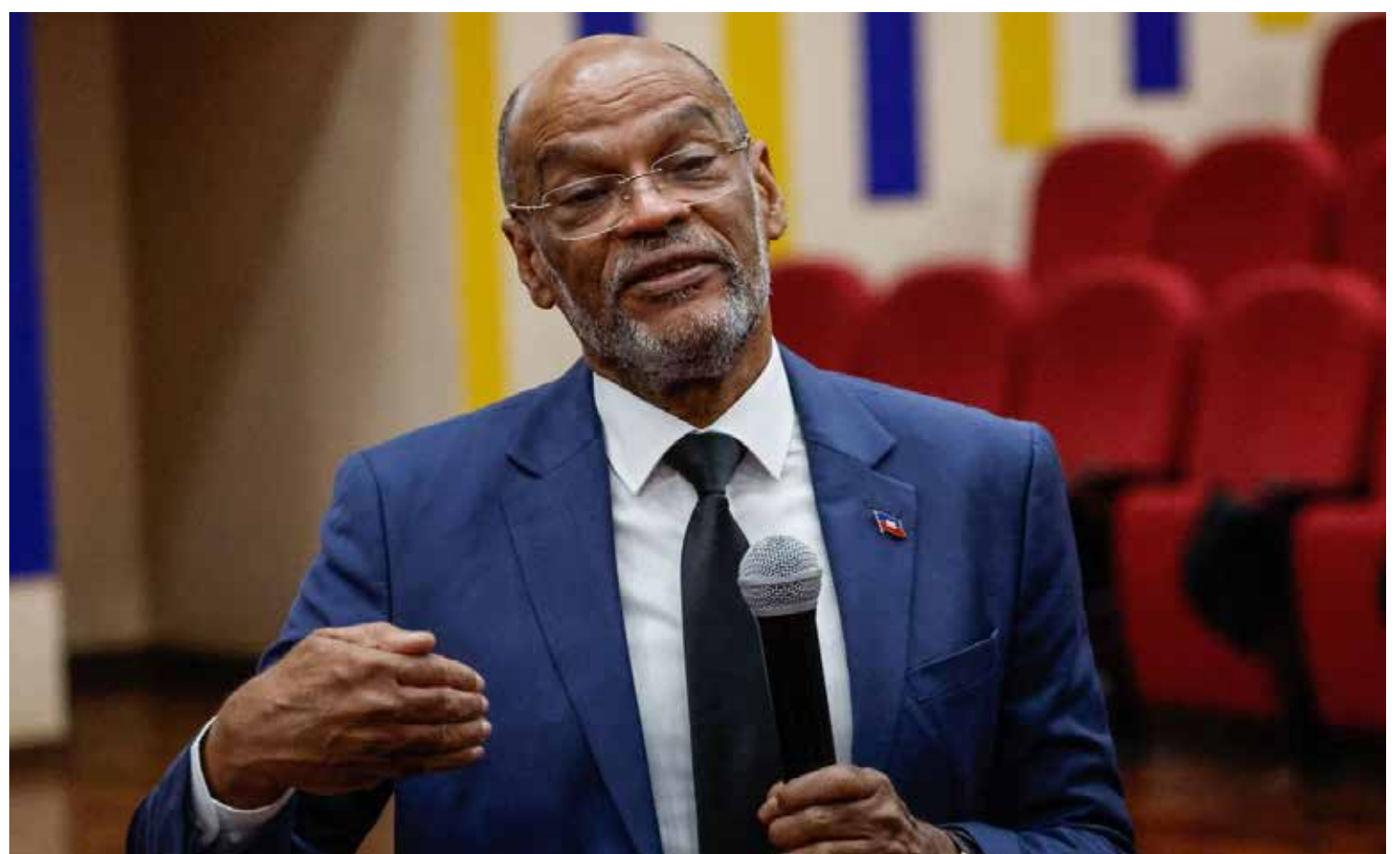
Ariel Henry, Haiti's Prime Minister