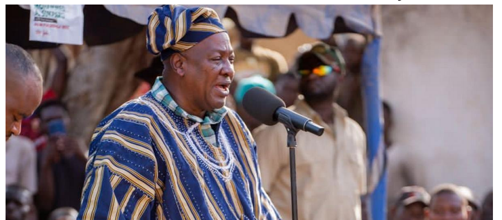
John Dramani Mahama, NDC Flagbearer