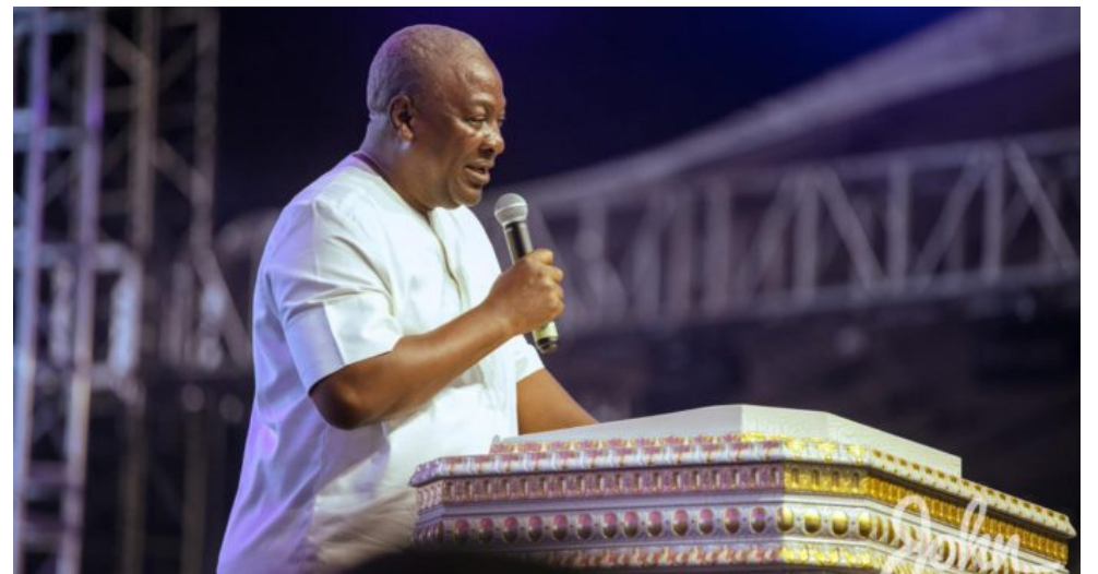
John Dramani Mahama, Former President of Ghana