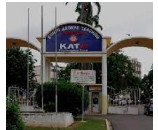
Komfo Anokye Teaching Hospital Entrance