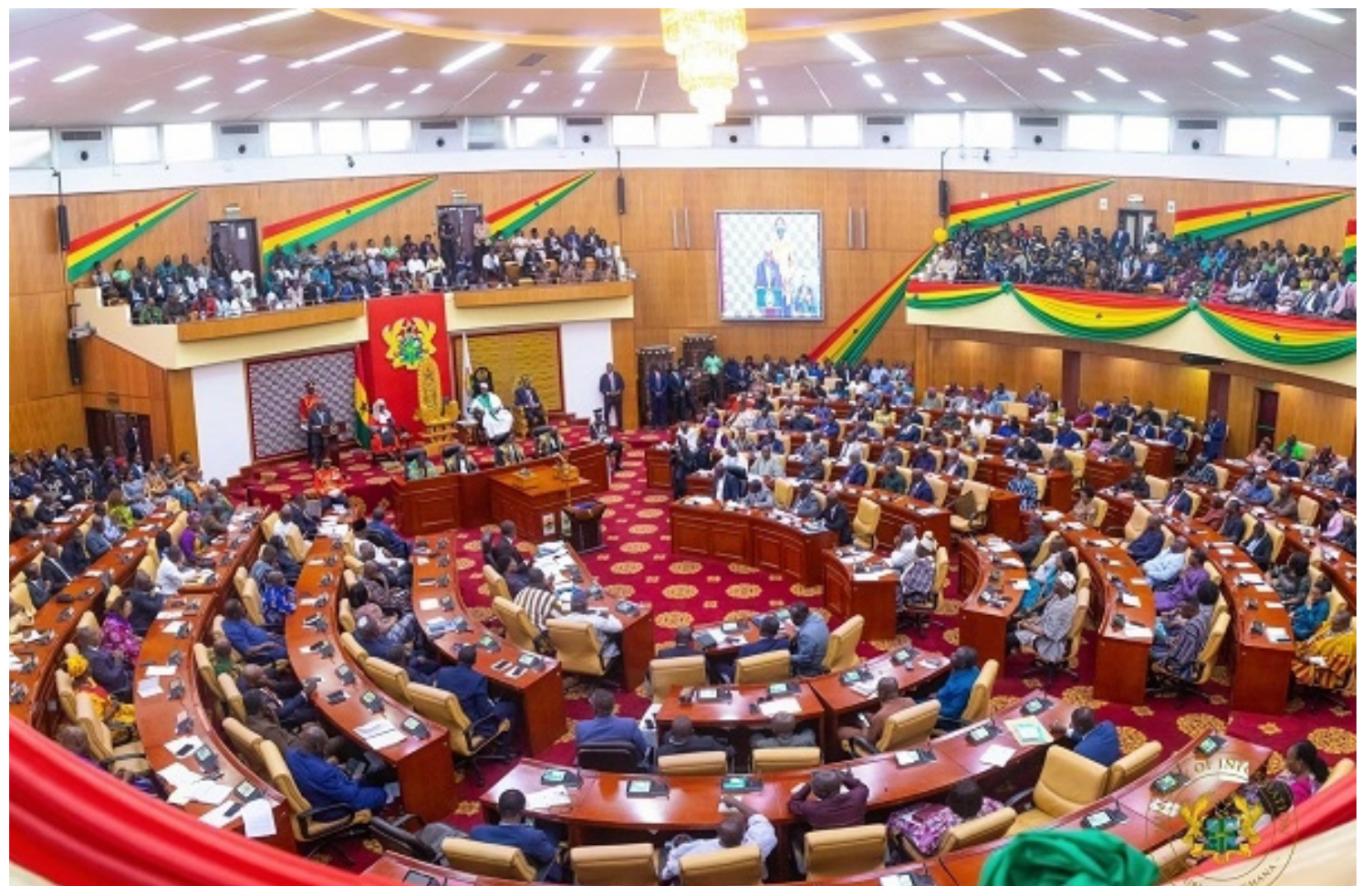
Parliament of Ghana