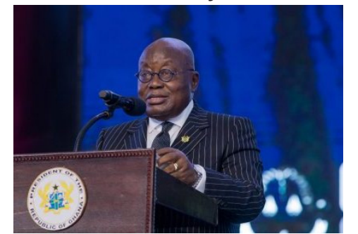
Nana Akufo-Addo, President of Ghana