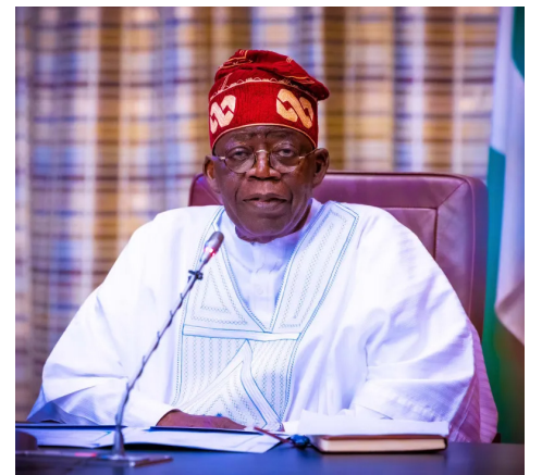
Bola Tinubu, President of Nigeria