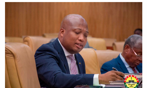
Samuel Okudzeto Ablakwa, MP North Tongu