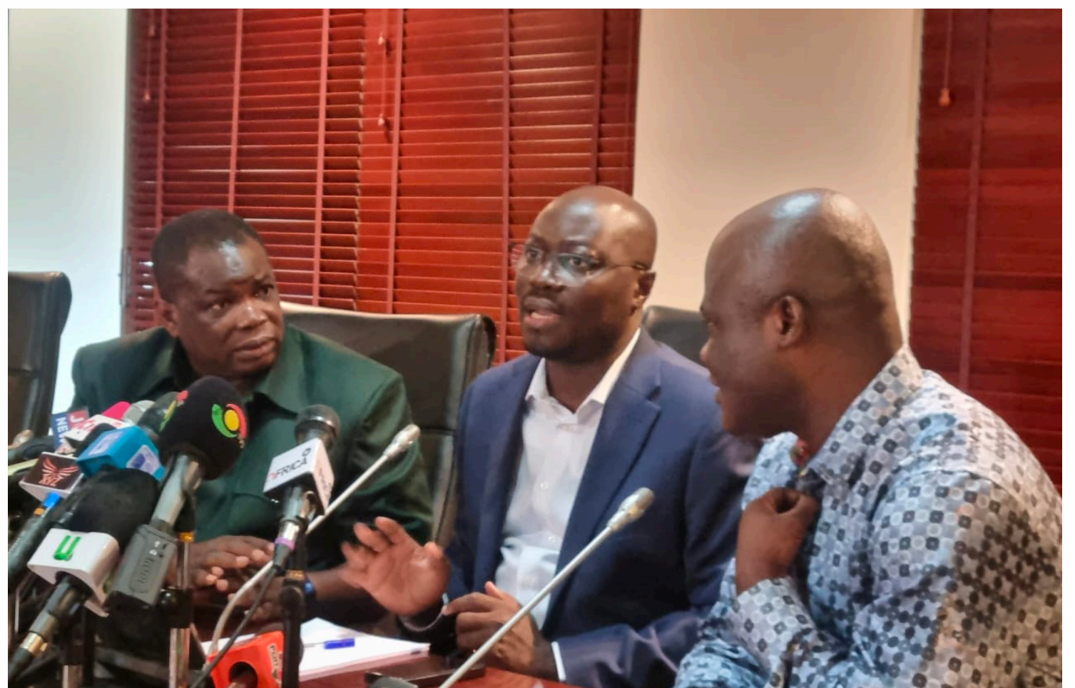
Dr Cassiel Ato Forson, Minority Leader and other committee members

Source: The Independent Ghana / Phoebe Martekie Doku