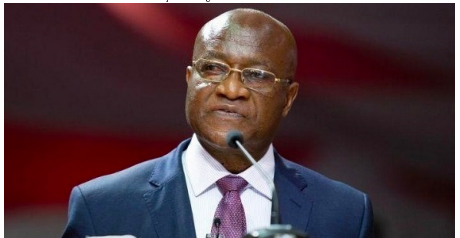
Kyei-Mensah-Bonsu, Majority Leader