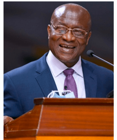
Kyei-Mensah-Bonsu, Majority Leader